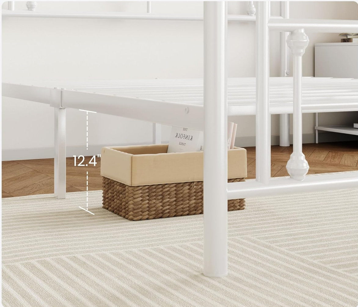
Image: Close-up of the under-bed storage area with a basket.

Maximize the available space for storing items