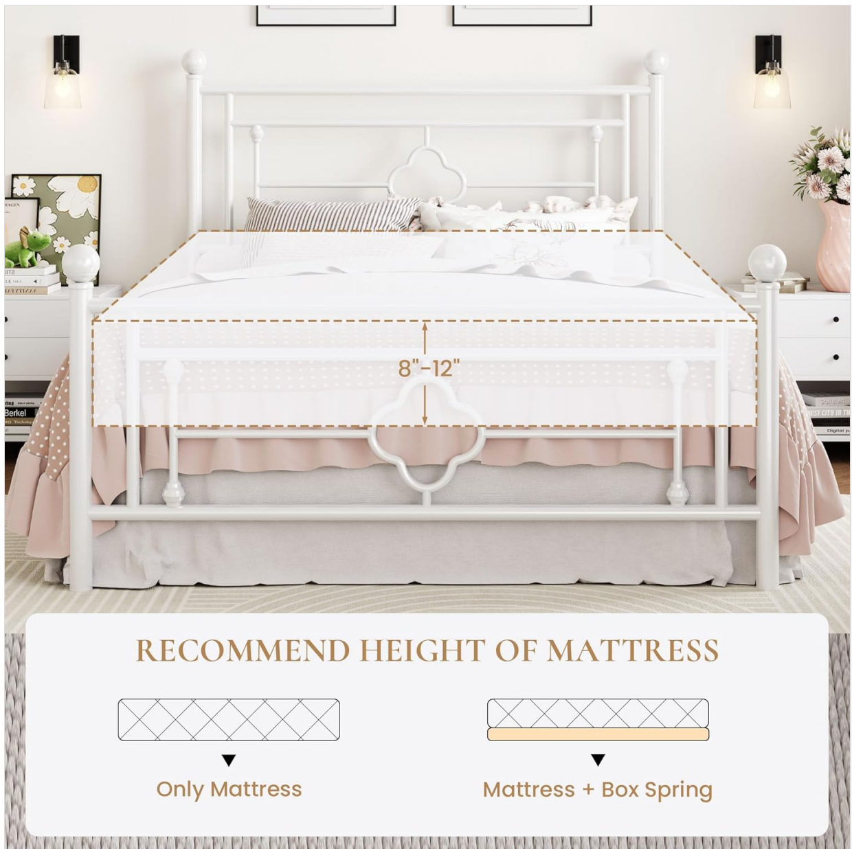
Image: Diagram showing recommended mattress height.