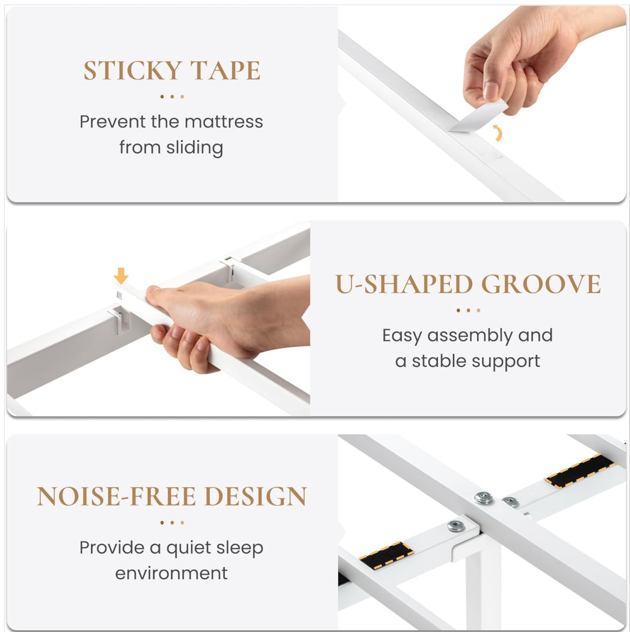
Image: Details of sticky tape, U-shaped groove, and noise-free design features.