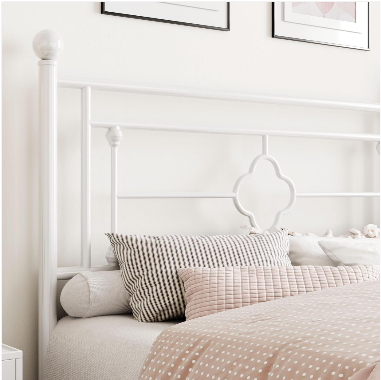
Image: Fully assembled white bed frame with bedding, showcasing its design.