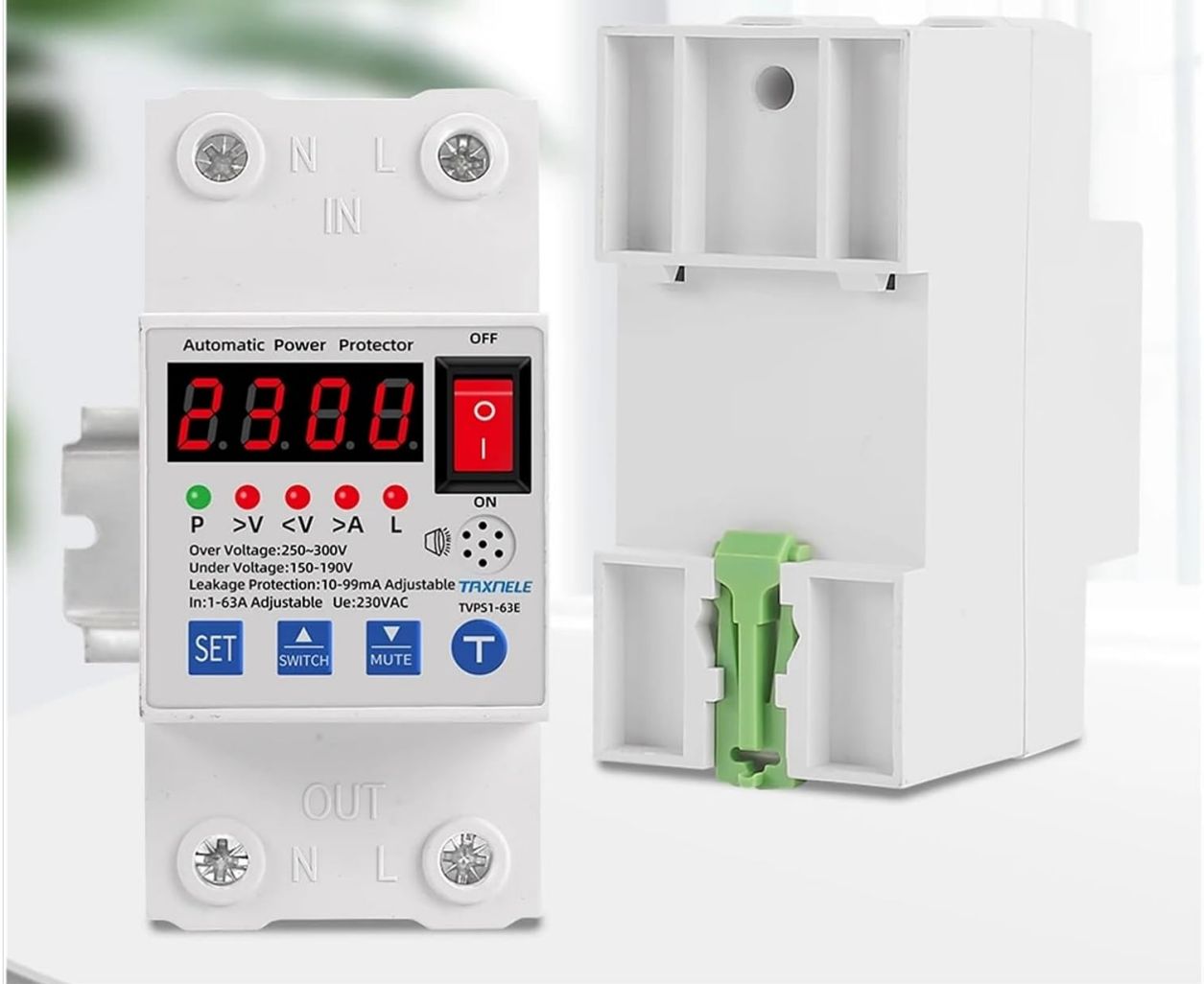
Figure 6.1: DIN Rail Assembly. The device is designed for household use and can be easily mounted on a 35mm DIN rail.

IDEAL FOR HOUSEHOLD USE IN 35MM DIN RAIL MOUNTED