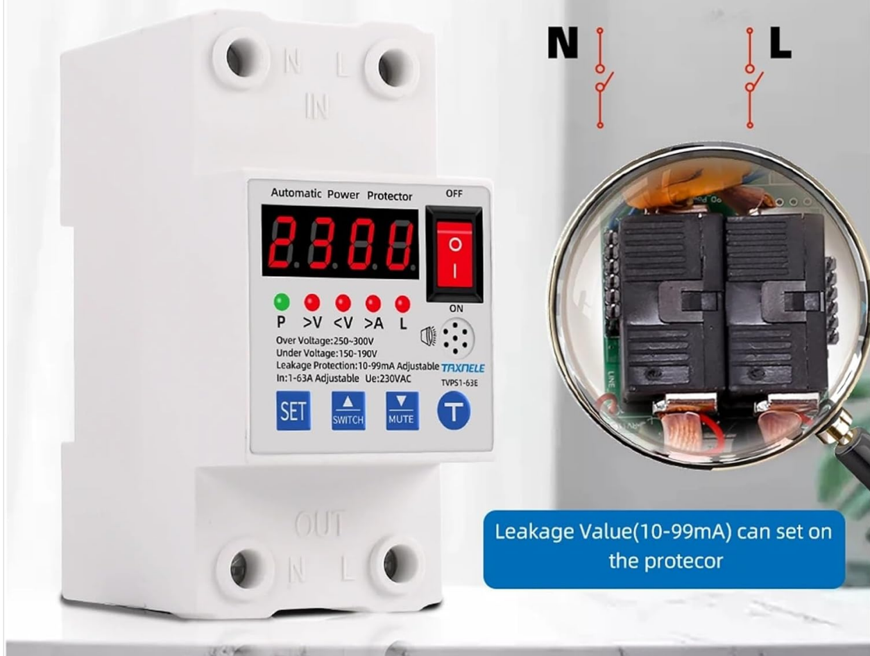
Figure 3.1: Earth Leakage Protection. This device features internal 63A relays that cut off both Live (L) and Neutral (N) wires simultaneously for enhanced safety compared to single-wire protection.

Inside Two 63A Relay, Cut off L N two wire at same time. More Safe than the market leakage protector which only Cut L wire