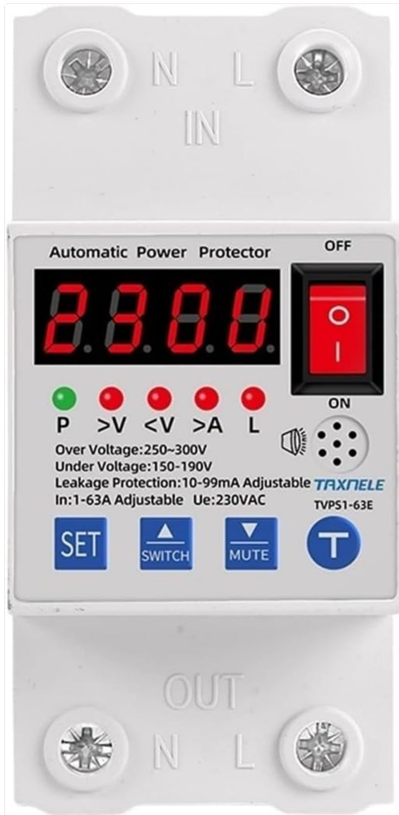
Figure 4.1: Front View of the RWRAPS TVPS1-63E. Shows the digital display, indicator lights, ON/OFF switch, and control buttons.