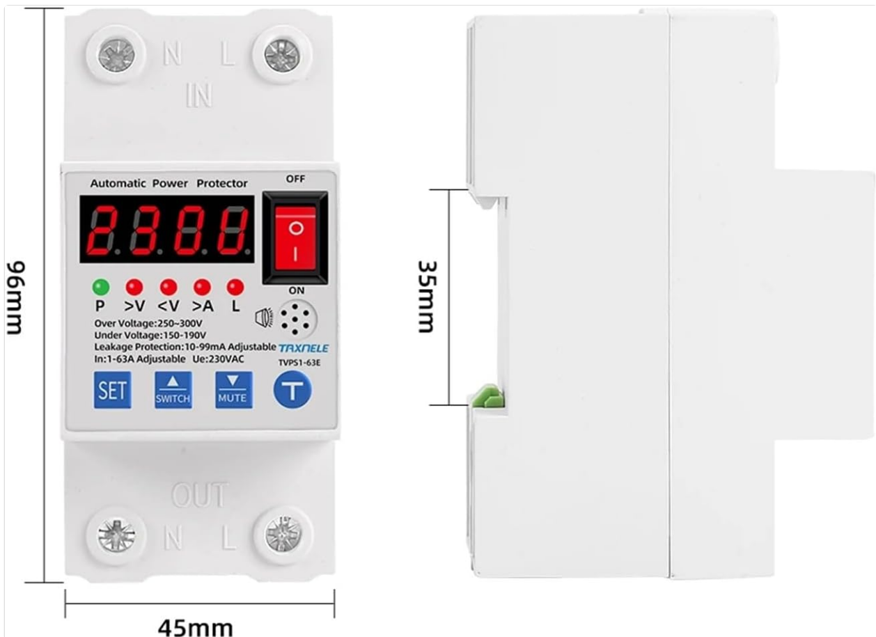
Figure 5.1: Device Dimensions. The diagram shows the approximate height of 96mm and width of 45mm for the main unit, and a depth of 35mm for the DIN rail mounting.