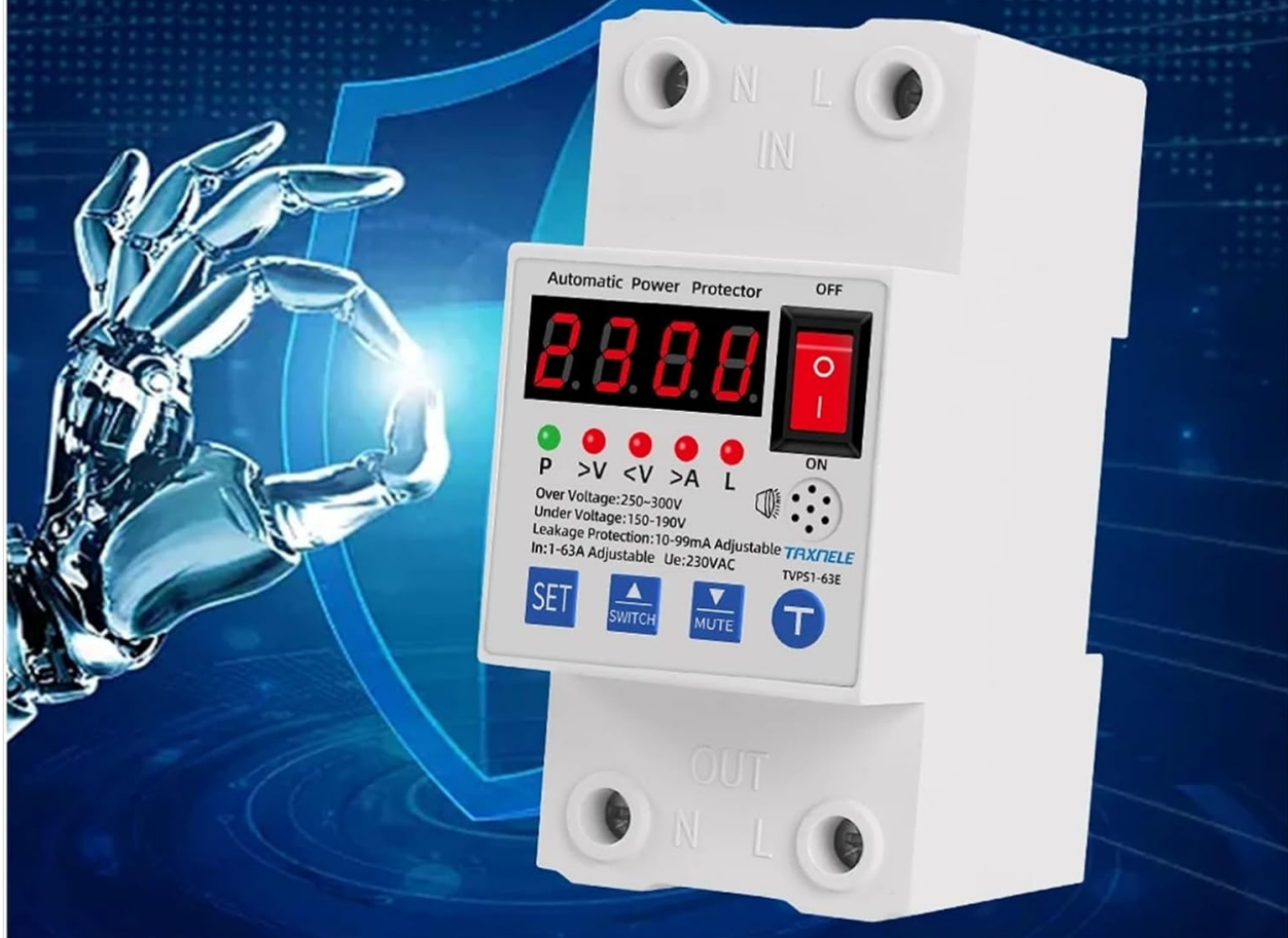
Figure 3.2: Real-time Display. The digital screen provides immediate feedback on voltage and current, with adjustable settings for overcurrent, over/under voltage, and over leakage protection.