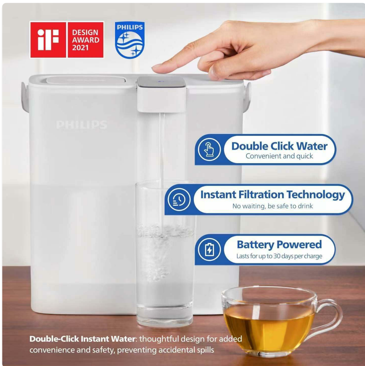
Image: Key features of the pitcher, including double-click dispensing and battery operation.