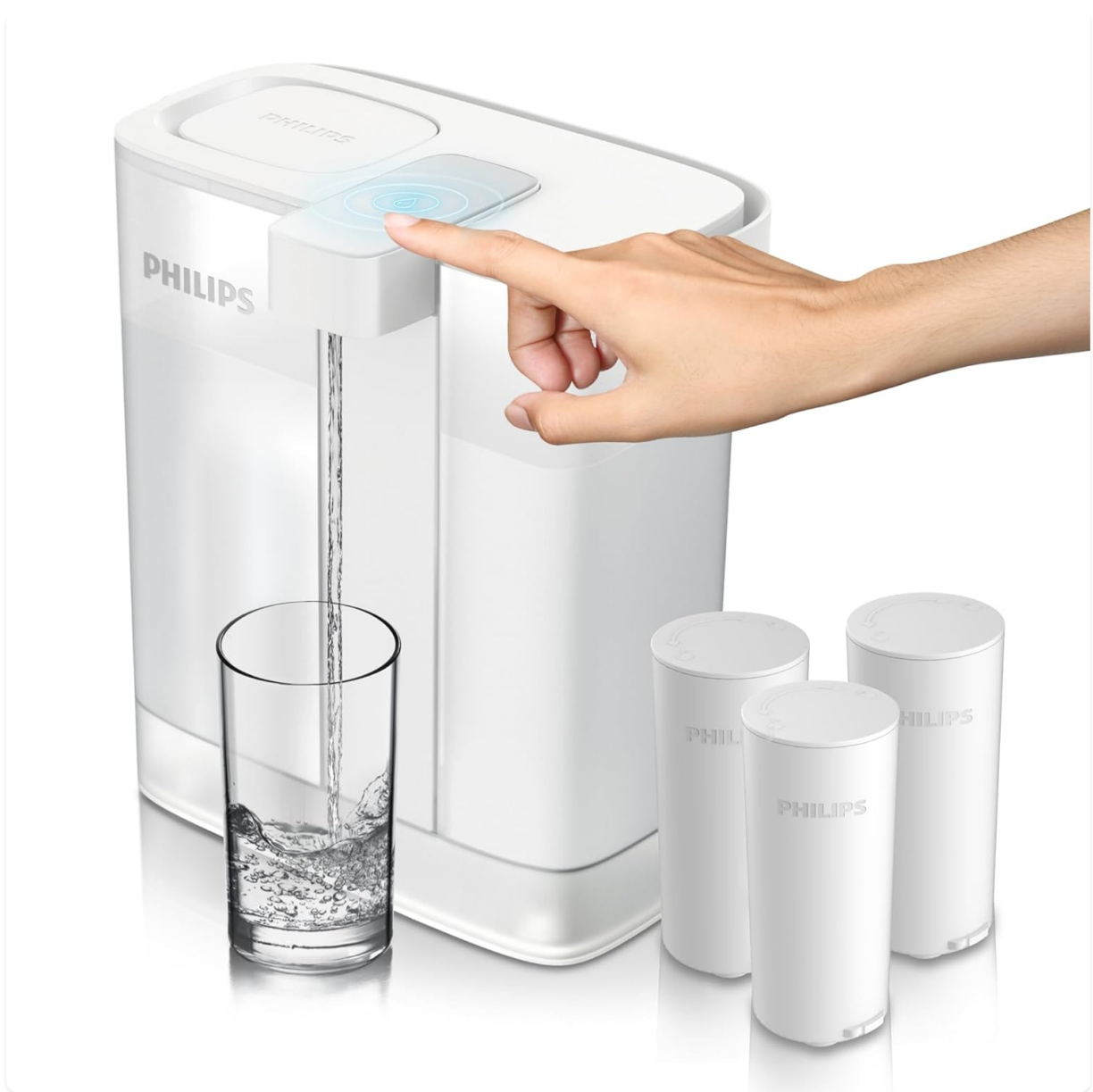
Image: Dispensing water from the pitcher into a glass.