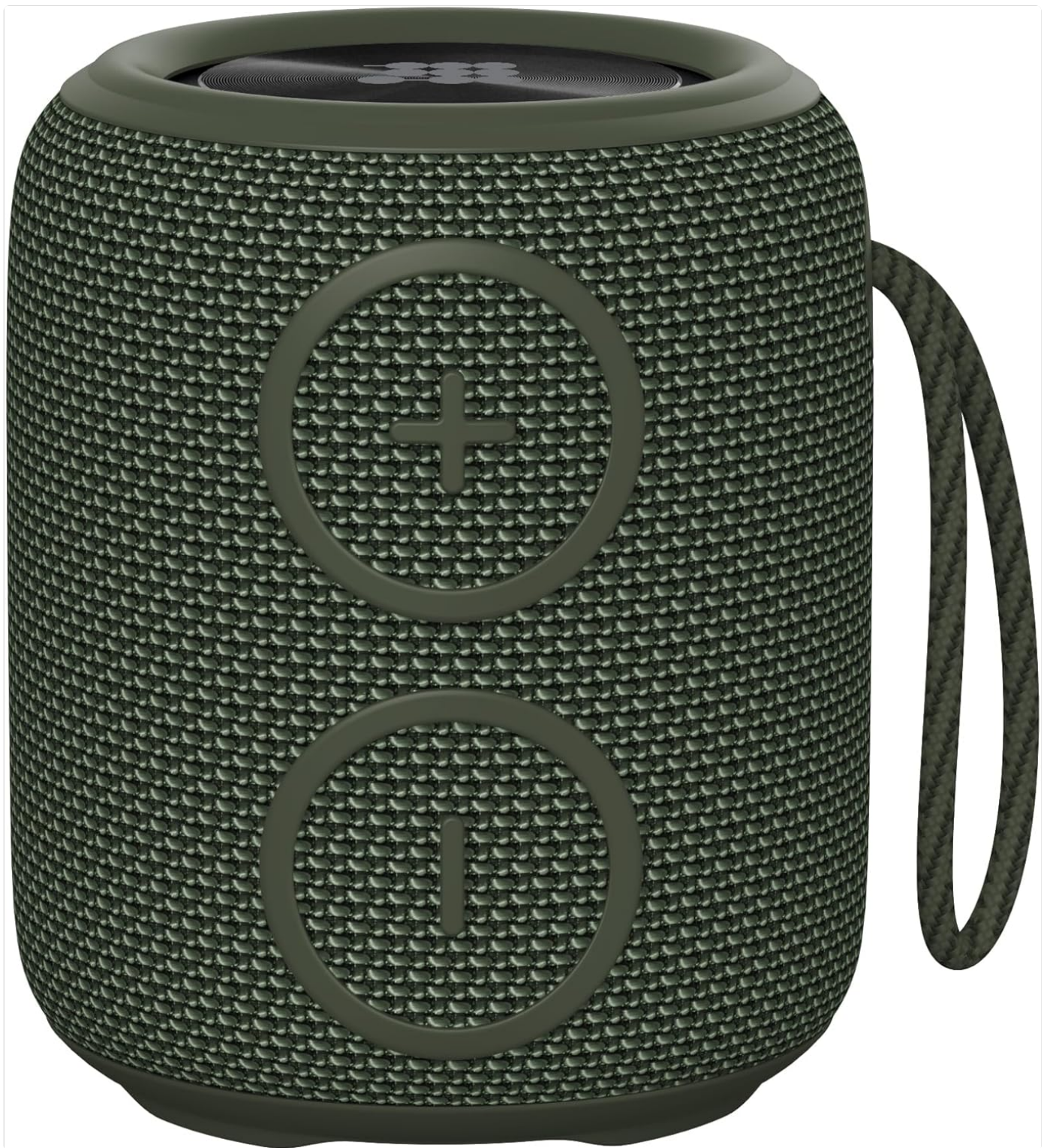
Figure 2: Top view of the Cubitt Power GO speaker, highlighting the power button and play/pause button.