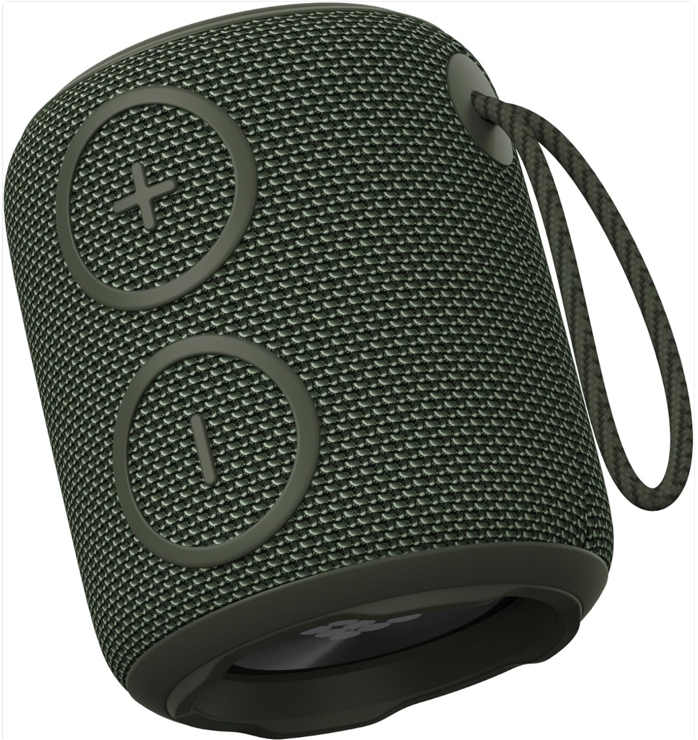
Figure 1: Front view of the Cubitt Power GO speaker, showing the volume up (+) and volume down (-) buttons.

Familiarize yourself with the speaker's components and controls.