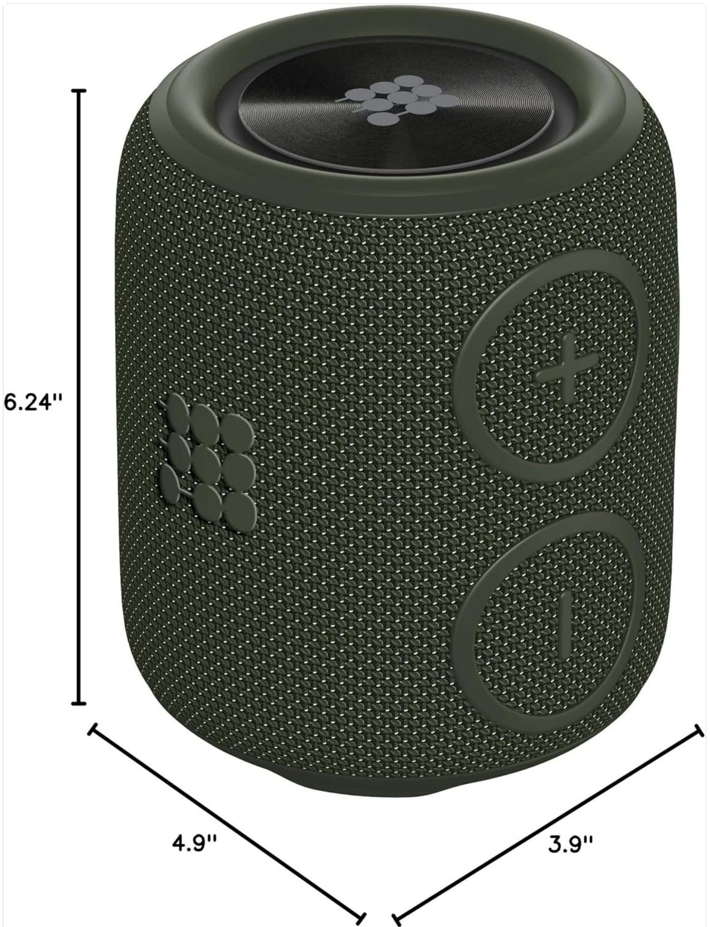
Figure 3: Dimensions of the Cubitt Power GO speaker, approximately 4.9"D x 3.9"W x 6.24"H.