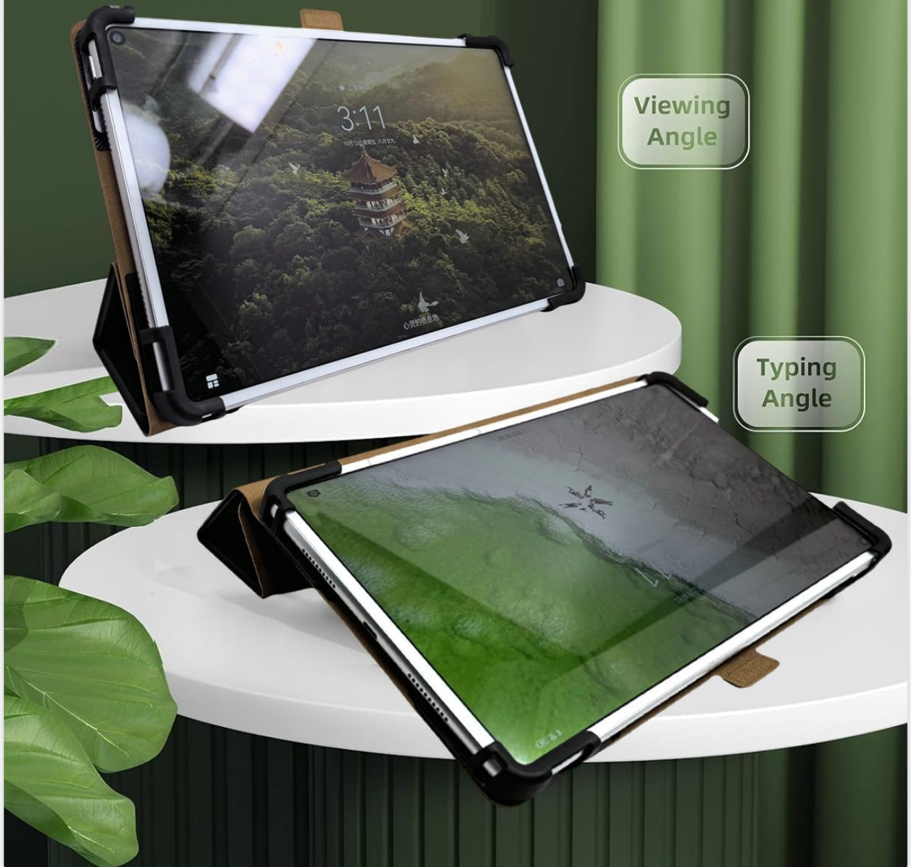
Image 4.1: The case demonstrating its ergonomic structure, allowing for both viewing and typing angles.

Built-in magnets bolster different positions.