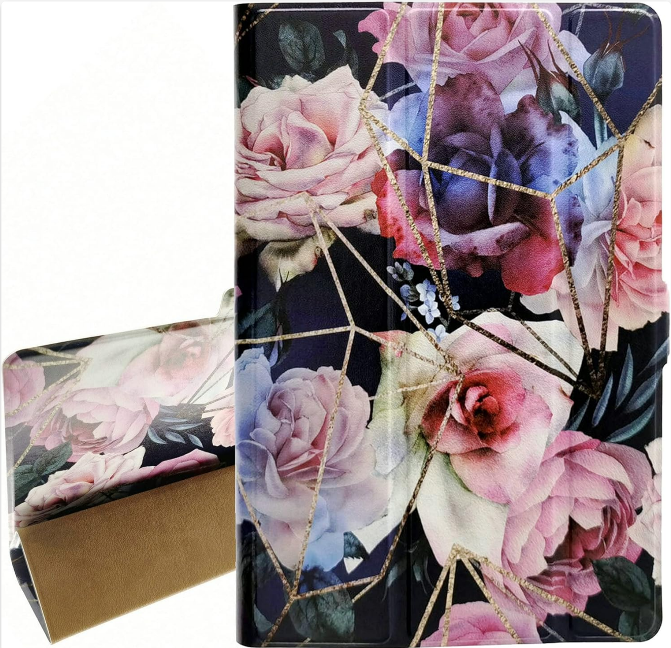
Image 1.1: The Aroepurt Slim Protective Case in its closed position, showcasing its unique floral pattern and slim profile.