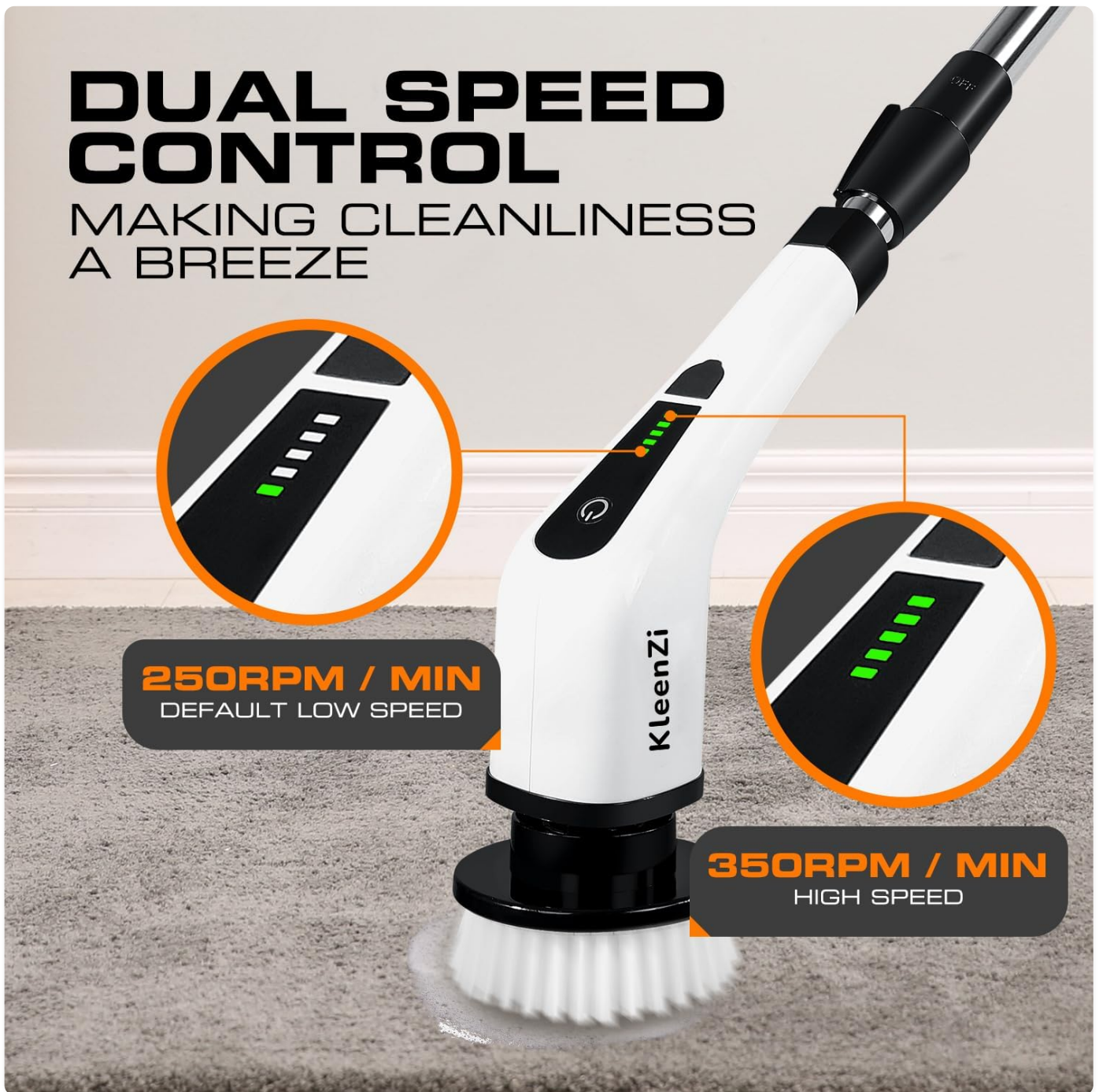
Image: Diagram illustrating the dual speed control feature, showing the default low speed of 250 RPM and the high speed of 350 RPM, with corresponding battery indicator lights.