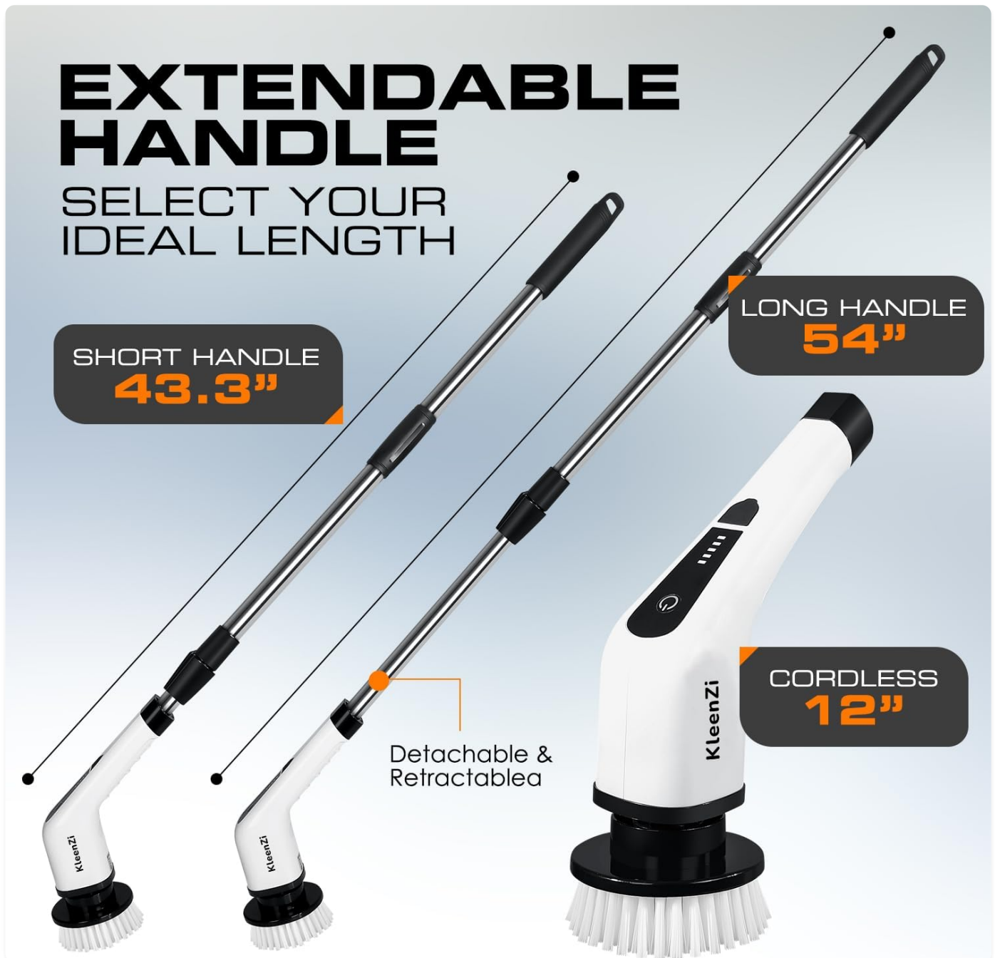
Image: Illustration showing the KleenZi Spin Scrubber in its cordless 12-inch configuration, and with the extendable handle at 43.3 inches and 54 inches, highlighting its versatility.