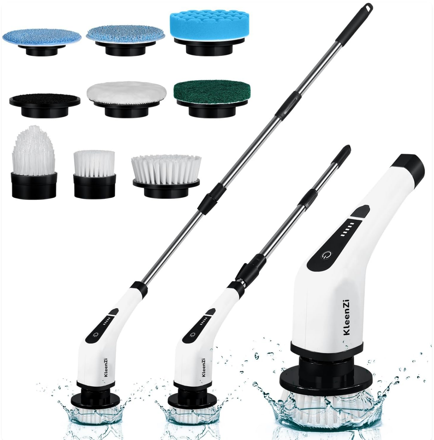
Image: The KleenZi Spin Scrubber with its main handle, extension handle, and all eight interchangeable brush heads.