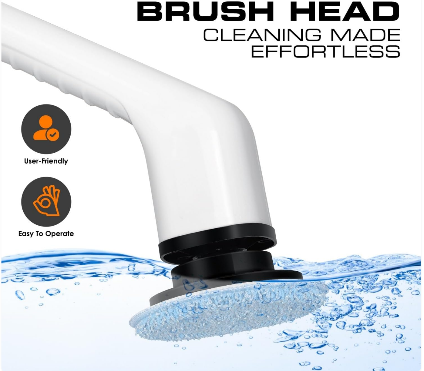
Image: A close-up of the KleenZi Spin Scrubber's brush head submerged in water, demonstrating its IPX7 waterproof protection and ease of operation.