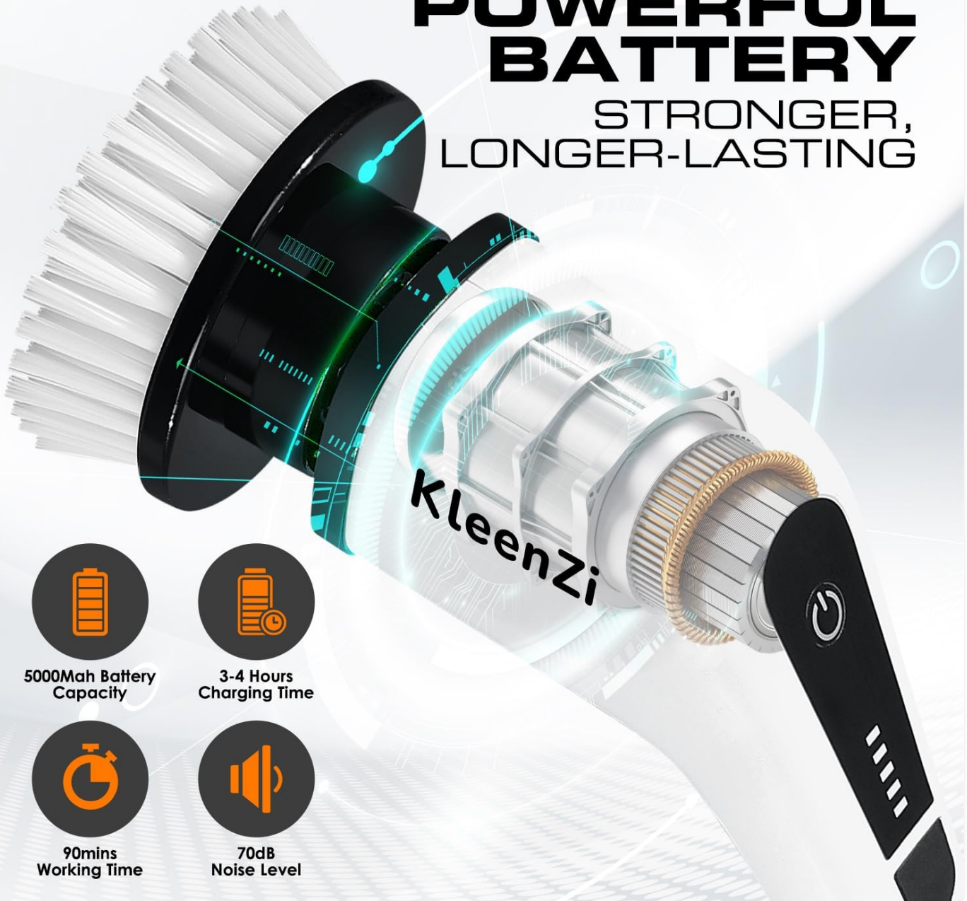
Image: Infographic detailing the powerful battery, showing 5000mAh capacity, 3-4 hours charging time, 90 minutes working time, and 70dB noise level.