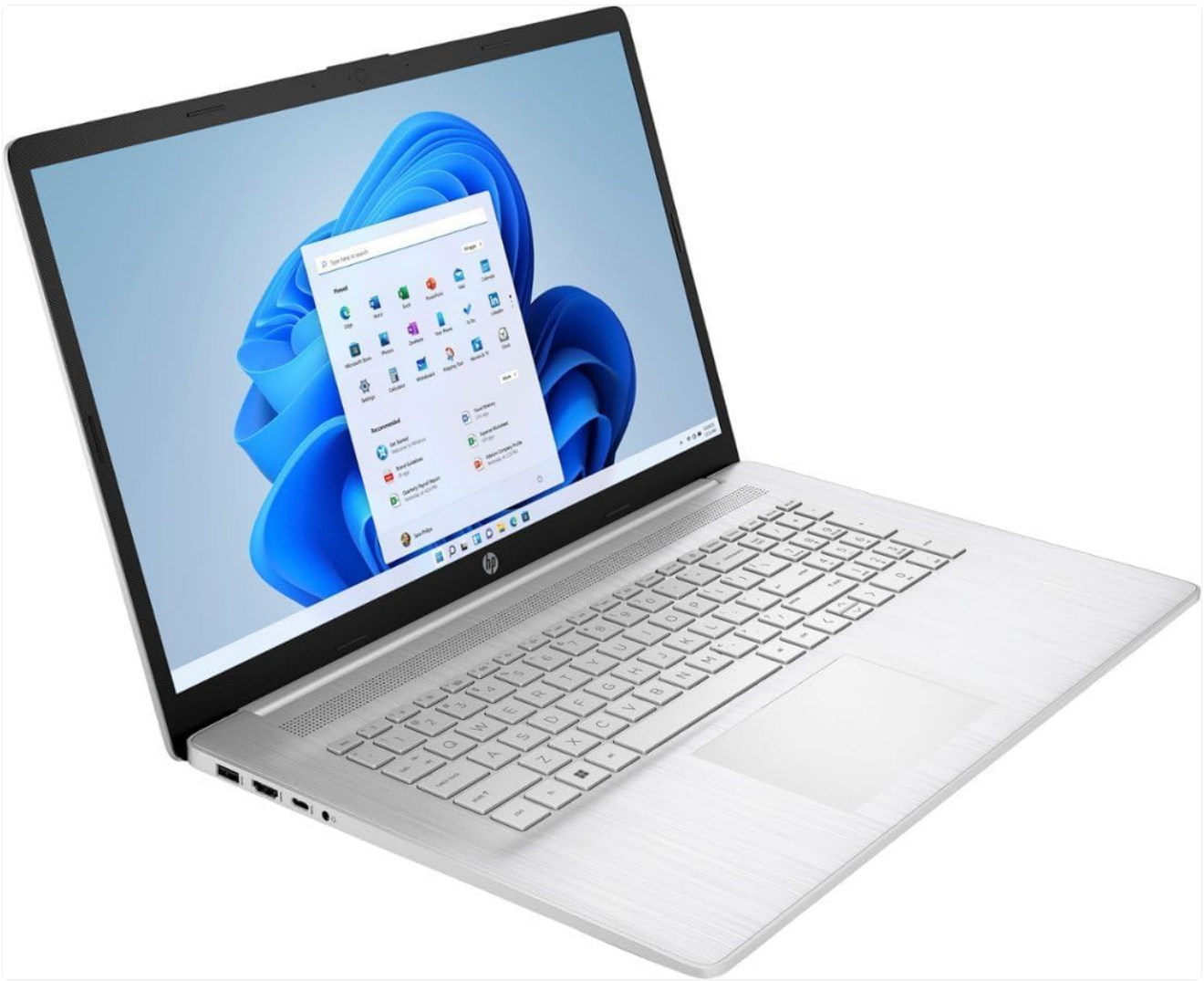
Figure 4: Angled view of the HP laptop, showcasing the keyboard, touchpad, and display.