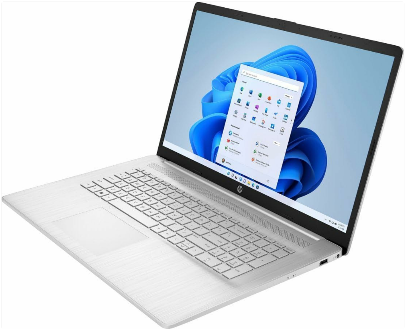
Figure 1: Front view of the HP 17.3-inch laptop displaying the Windows 11 desktop interface.