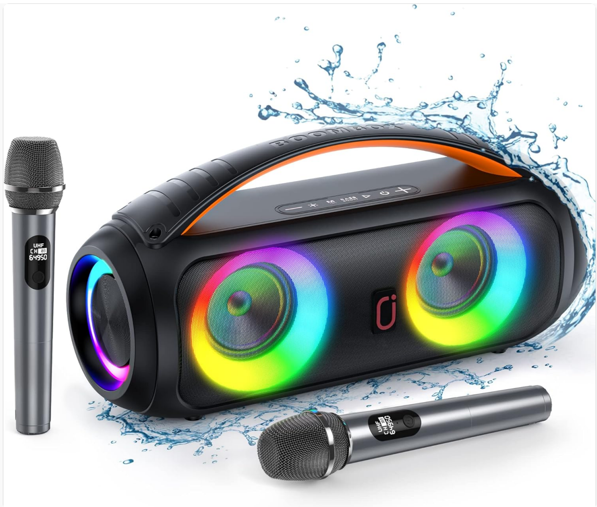
Image: The JYX D16T Karaoke Machine with its two accompanying wireless microphones, showcasing its portable design and vibrant speaker lights.