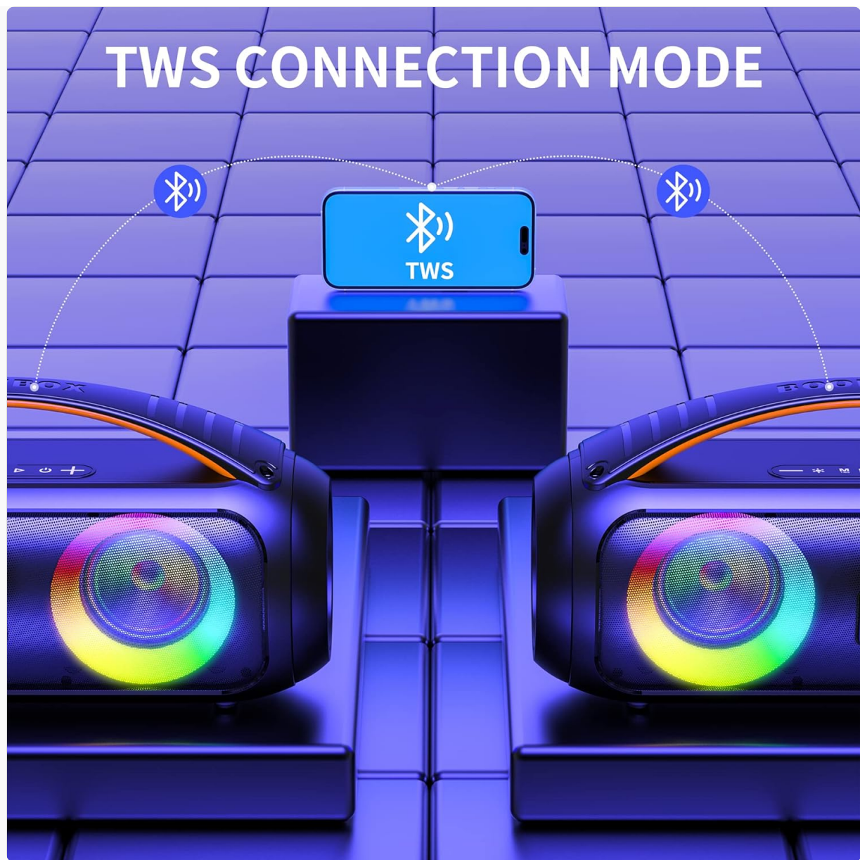
Image: Illustration of two JYX D16T speakers wirelessly connected in TWS mode for enhanced stereo sound.