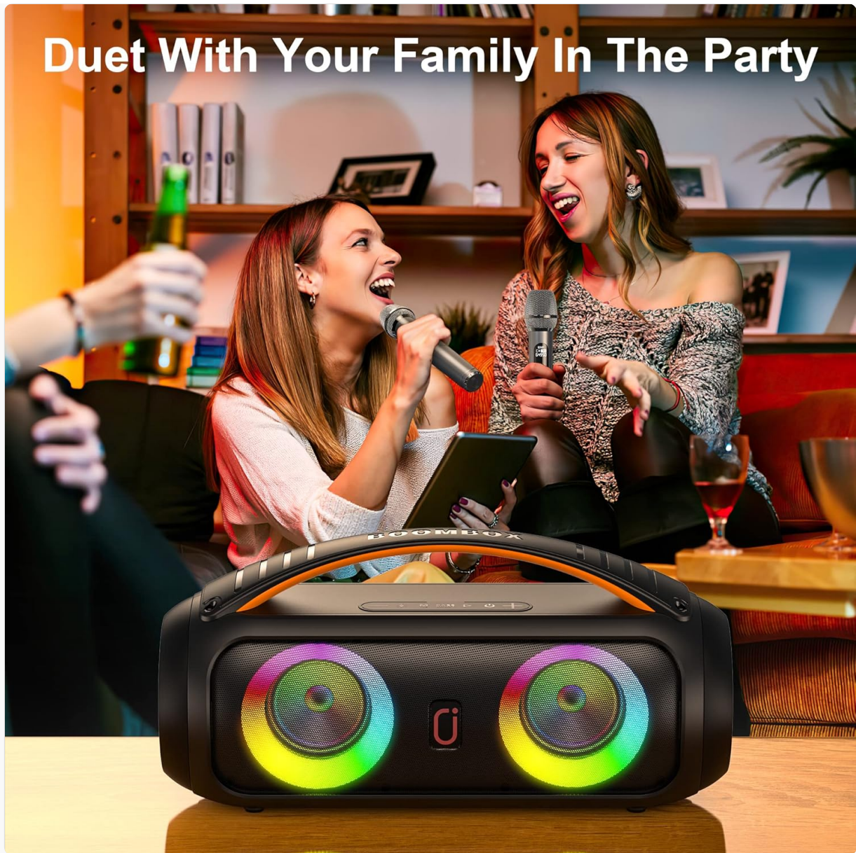
Image: Two individuals using the wireless microphones with the JYX D16T speaker, demonstrating the dual microphone feature.