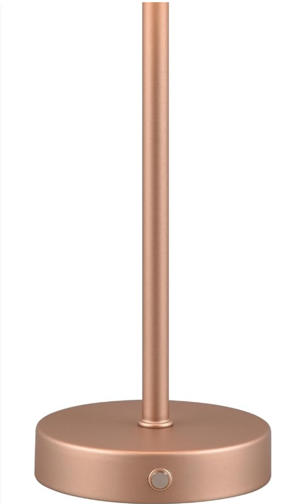
Image: The Reality Leuchten LED Rechargeable Table Lamp Jeff R59151165 in coffee metal finish.