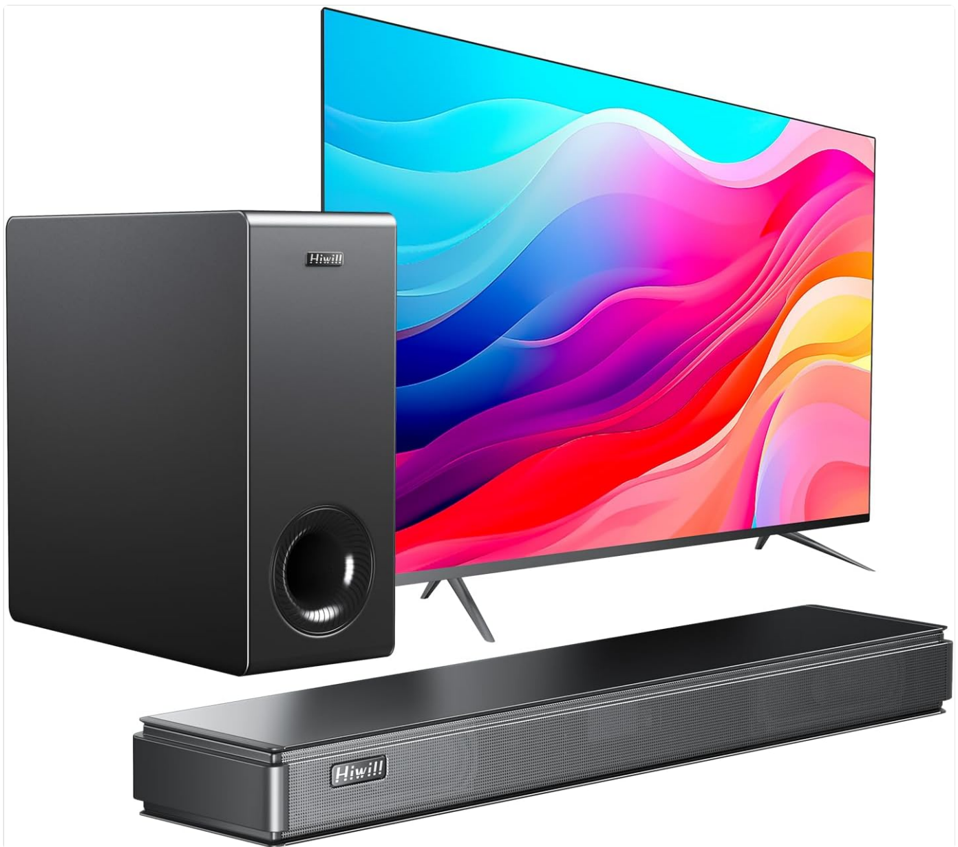
Image 1.1: The Hiwill HW210 Soundbar and Subwoofer system, shown with a television for illustrative purposes.