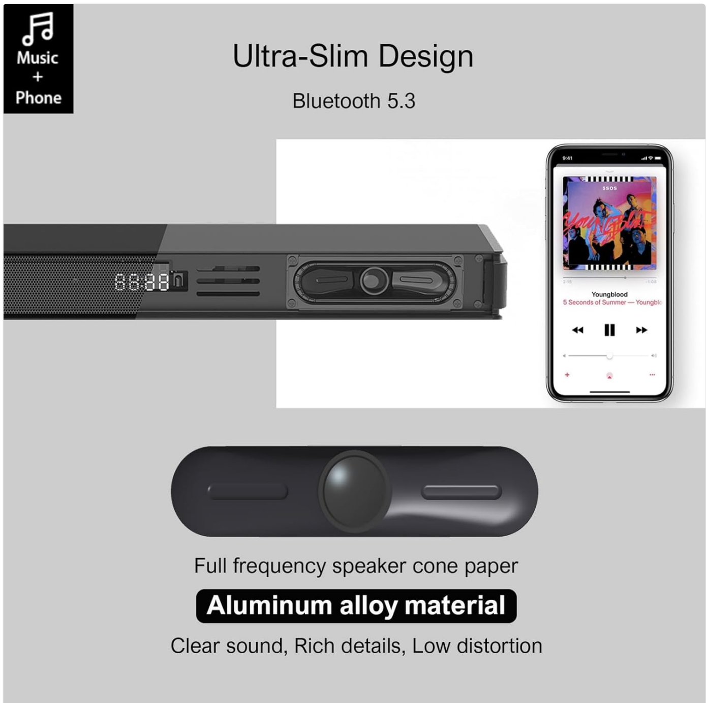
Image 4.1: Detail of the soundbar's ultra-slim design, showing the front display and integrated speakers.