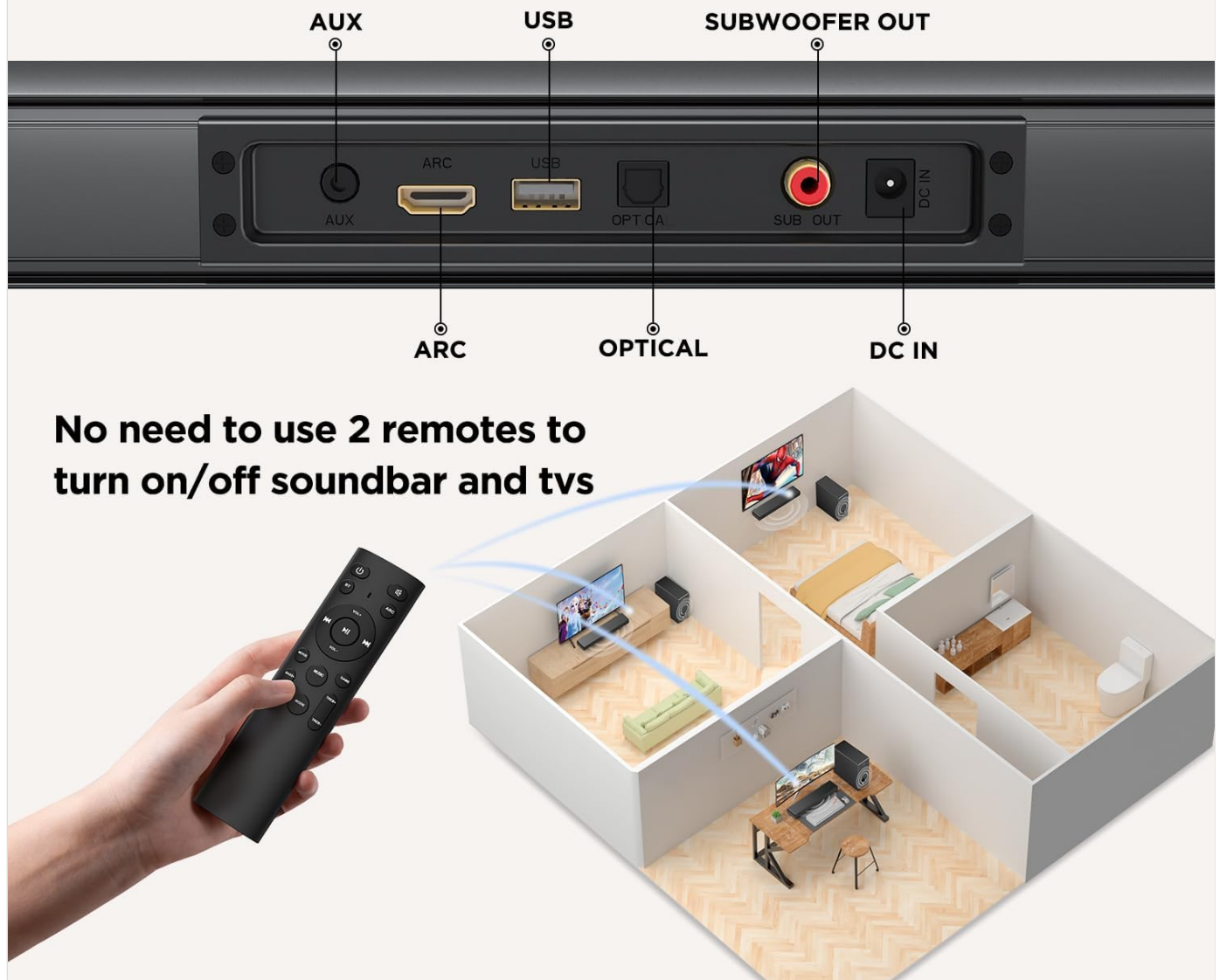
Image 4.2: Rear view of the soundbar showing input ports: AUX, HDMI ARC, USB, Optical, Subwoofer Out, and DC In.