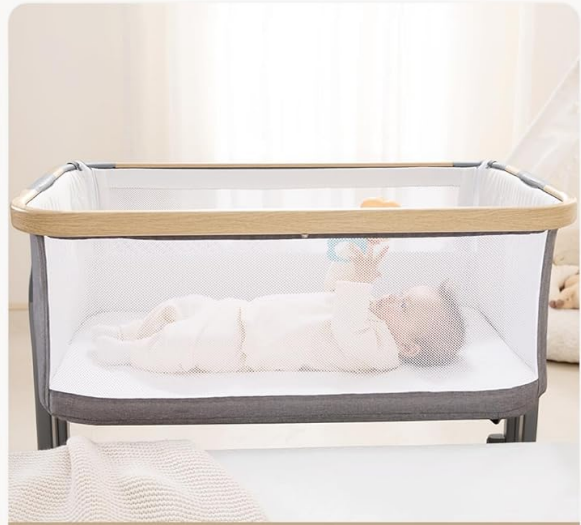
Breathable Mesh for Airflow

Detailed view of the bassinet's features: high-quality mosquito net, detachable large storage basket, 360° silent wheels with brake, and breathable mesh sides.