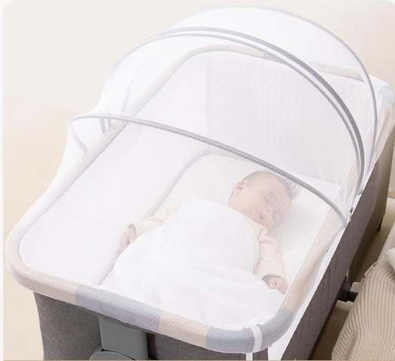
High-quality Mosquito Net