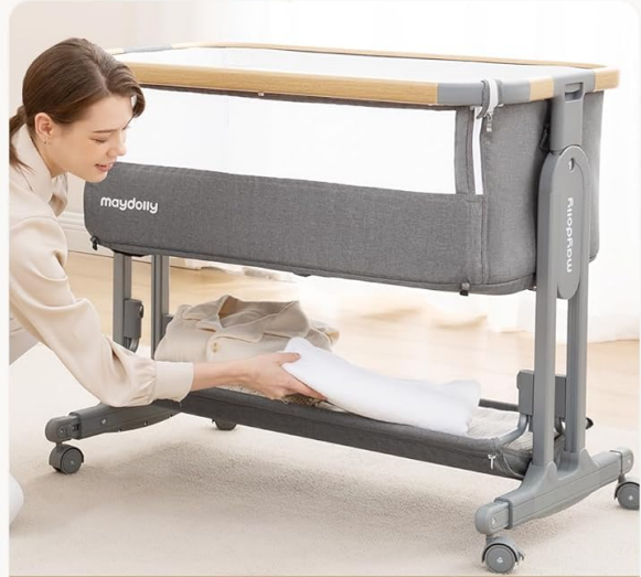
Detachable Large Storage Basket