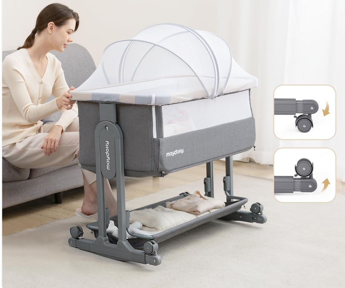
Image depicting the bassinet configured for rocking mode, with a parent observing. Video showcasing the Maydolly Bedside Bassinet with its rocking mode functionality.