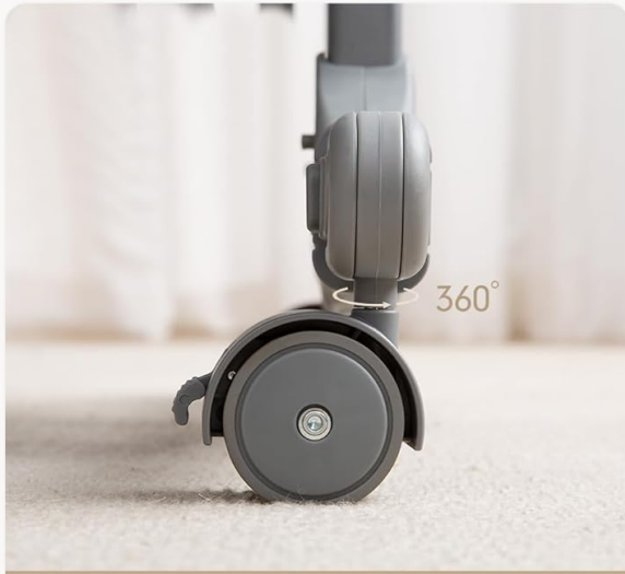
360° Silent Wheels with Brake