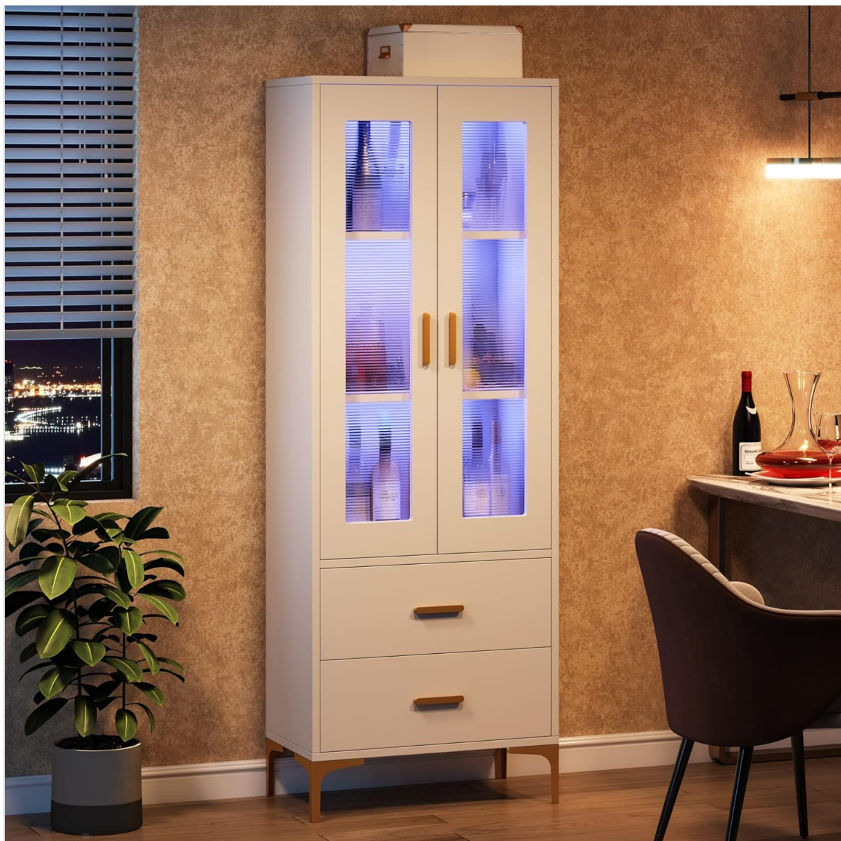
Figure 4: Bookcase with LED lights in operation.