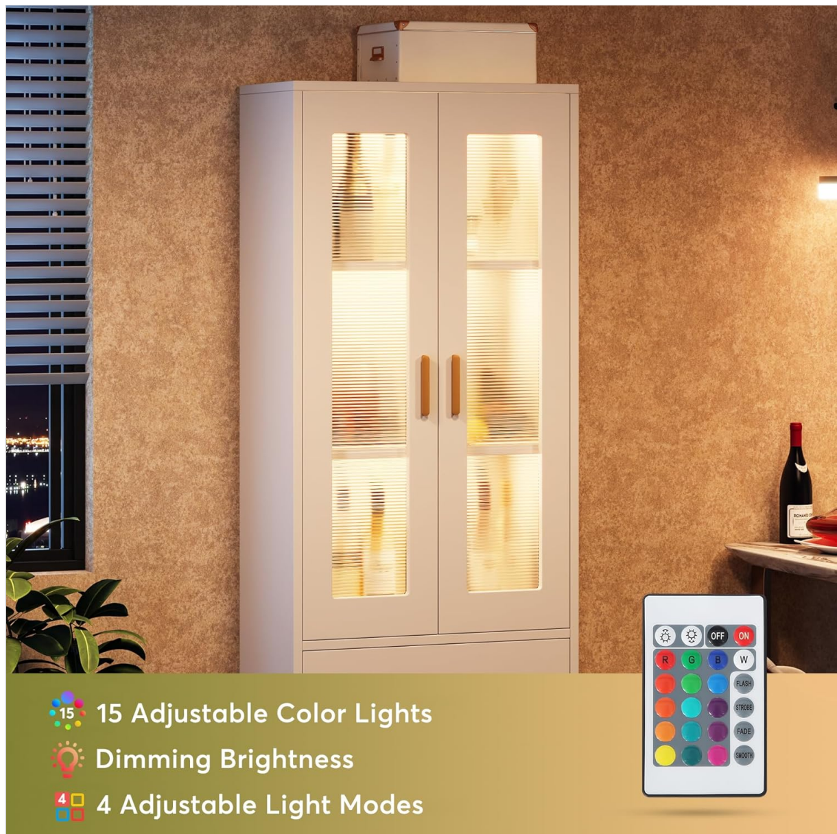
Figure 3: LED light remote control for color and mode adjustments.