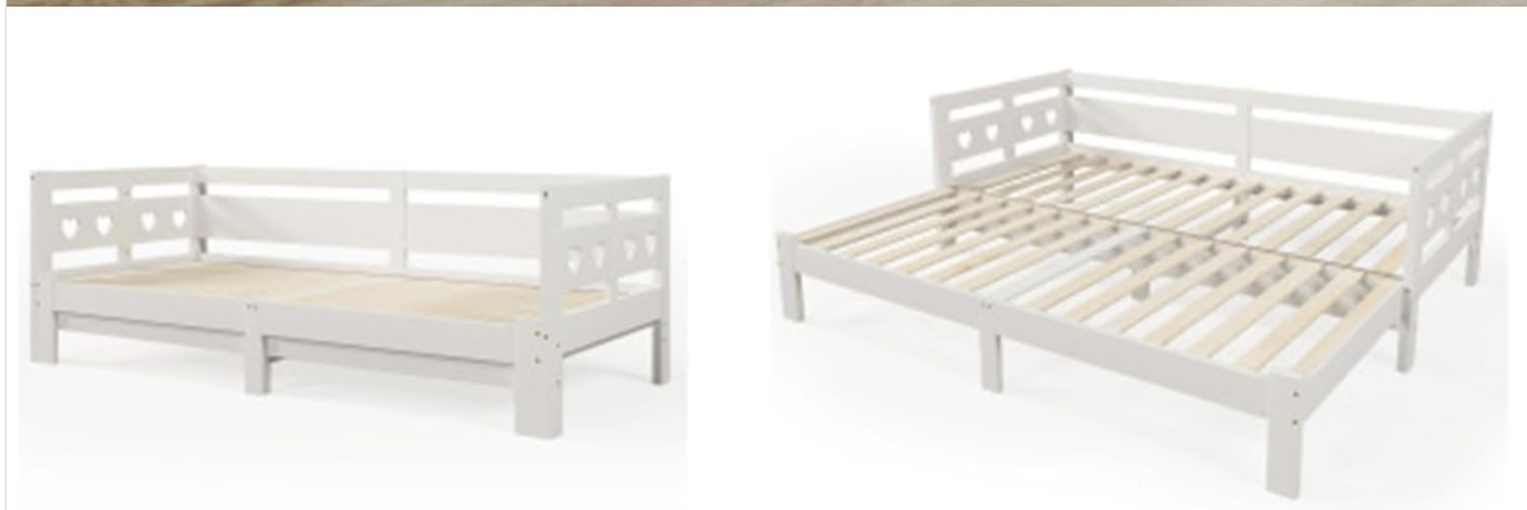
Image 4.1: The AufuN Daybed in its compact configuration, ready for use as a sofa or single bed.