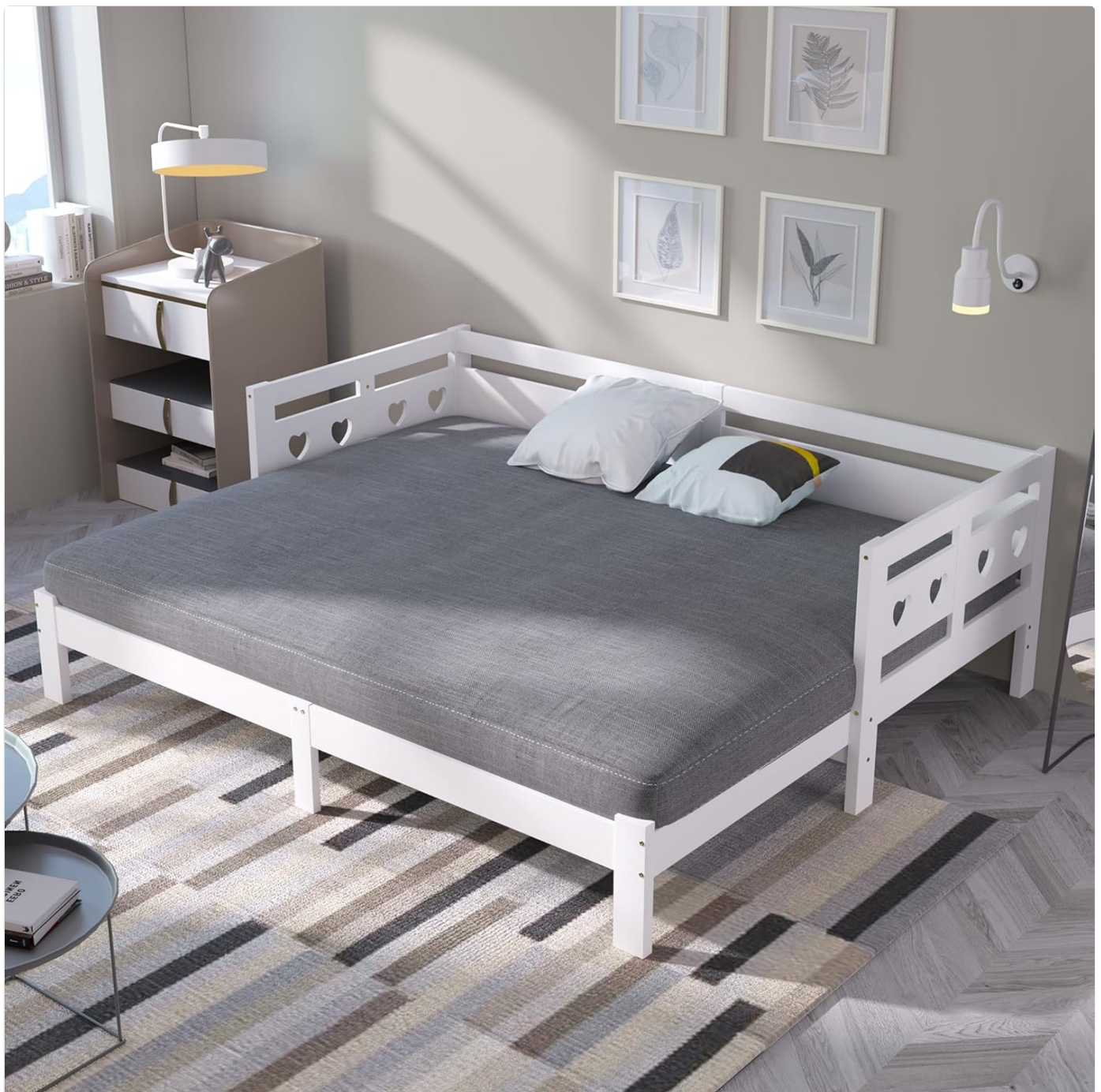
Image 5.1: The daybed serving as a comfortable sofa in its compact form.