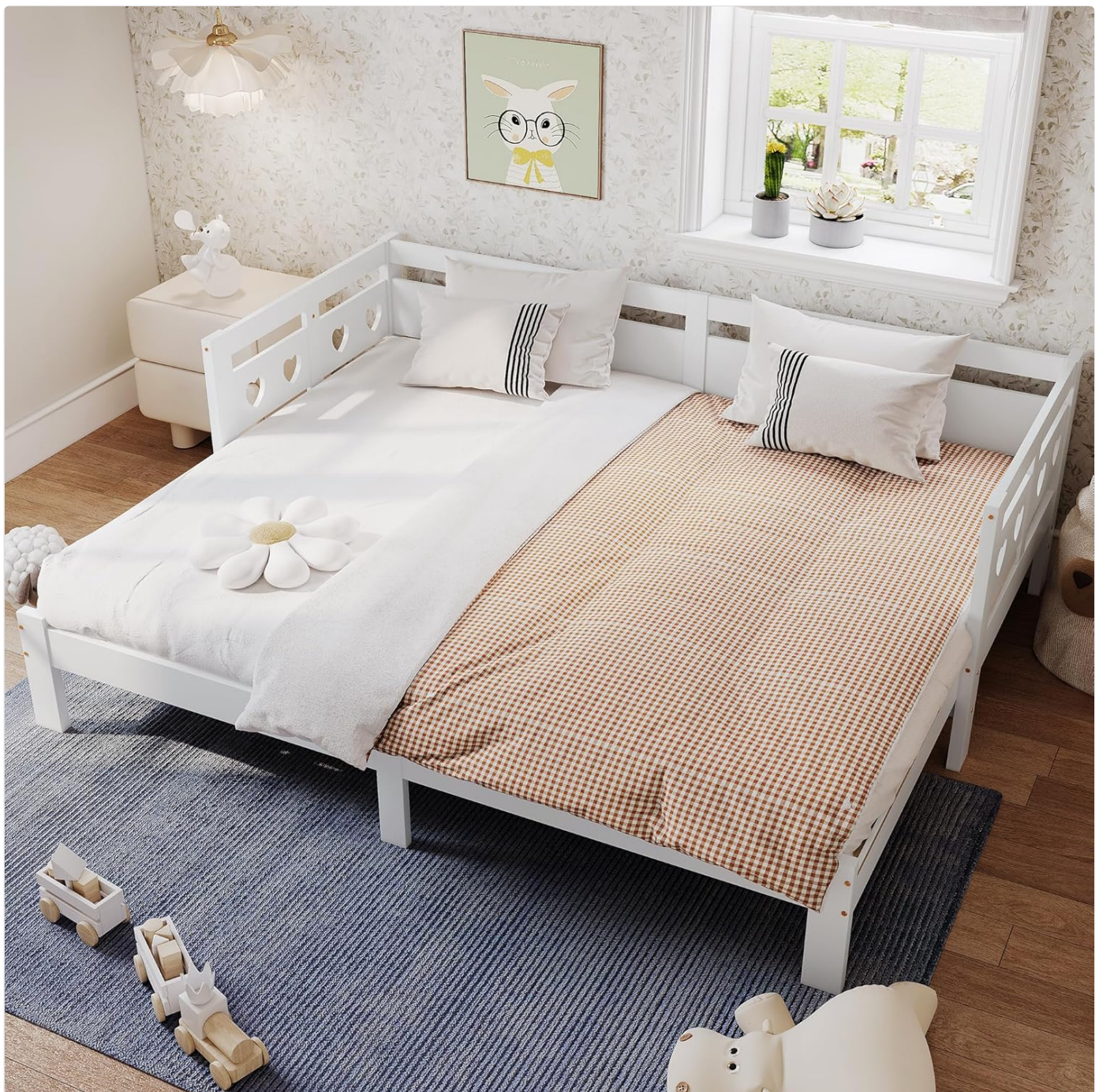
Image 5.2: The daybed fully extended, providing a spacious sleeping area for two.