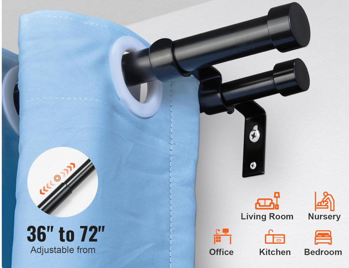
Image: VEVOR Double Curtain Rods installed, highlighting adjustable length and suitability for various rooms.