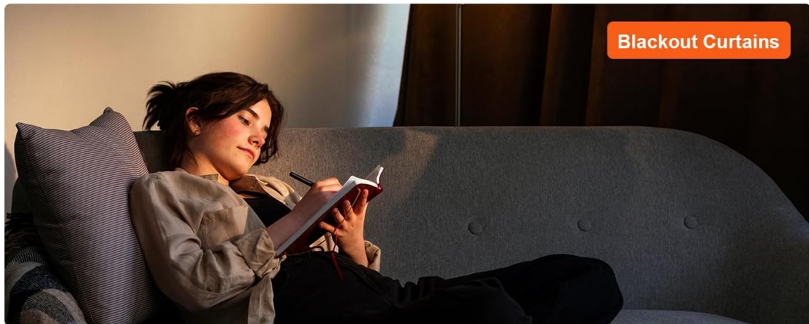
Image: Illustrates the dual functionality of the rods for enhanced privacy and light control with layered curtains.