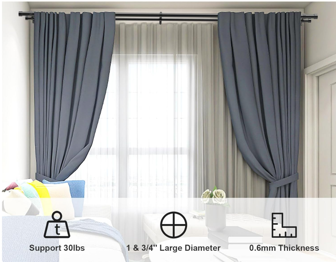
Image: The curtain rod demonstrating its robust construction and ability to support heavy fabrics without sagging.

Provide perfect support for heavy fabrics