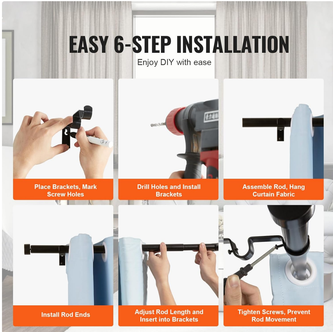
Image: Visual guide detailing the 6-step installation process for the curtain rods.