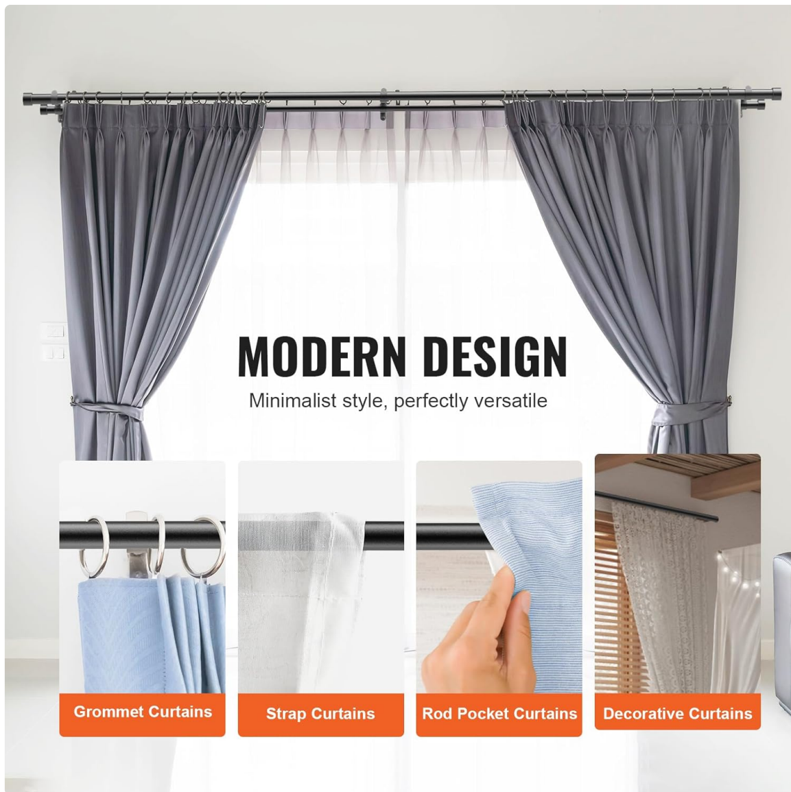
Image: Displays the modern design and versatility of the rods with different curtain hanging methods.