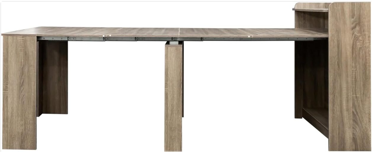
Image 5.1: The table's extension mechanism, illustrating how the leaves are supported and integrated.

leaves, creating a continuous table surface.