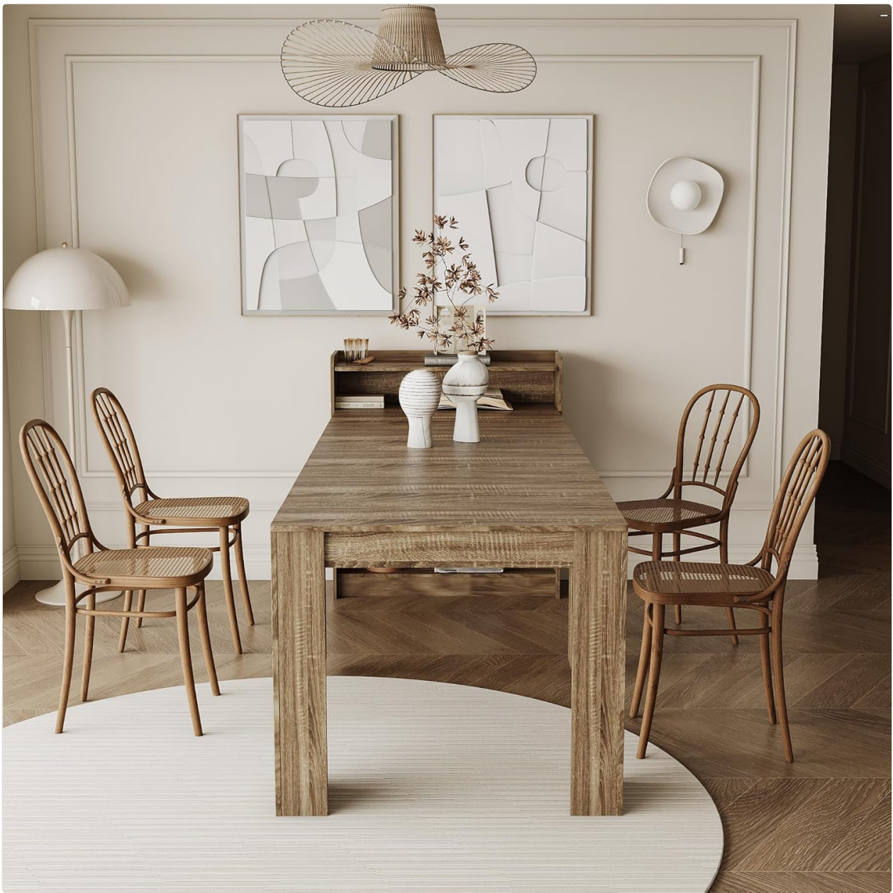
Image 5.2: The table fully extended, ready for use as a dining surface.