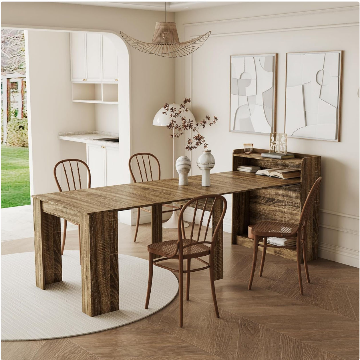
Image 1.1: The Henf Extendable Dining Table in its fully extended dining configuration, showcasing its natural wood finish and capacity for multiple guests.