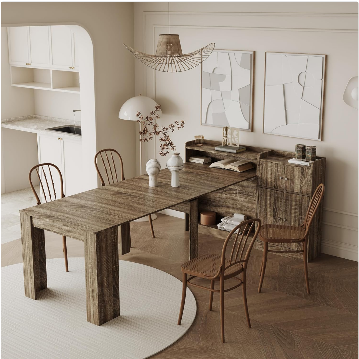
Image 4.2: Detailed view of the table's construction, highlighting the smooth rolling rails and the designated storage area for extension leaves.