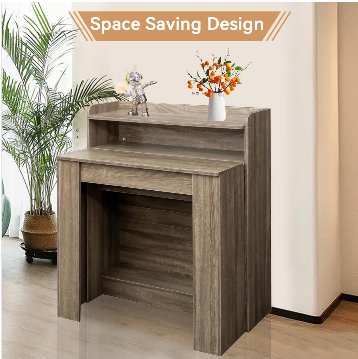
Image 5.3: The table in its retracted console form, functioning as a stylish sideboard.