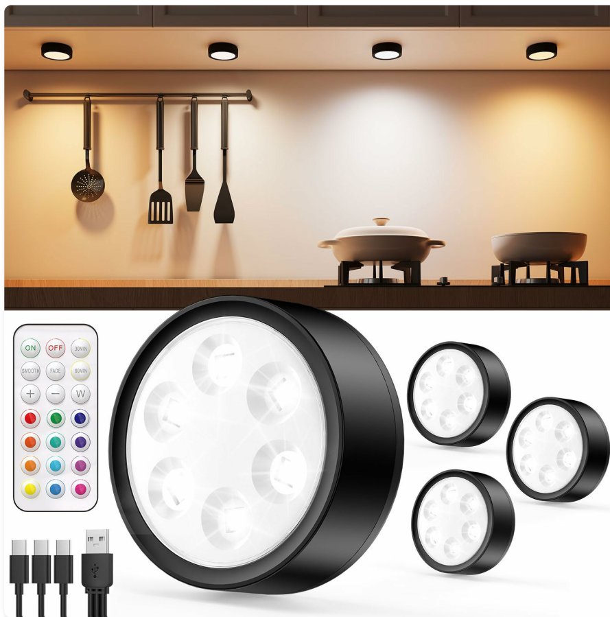
Figure 1: Package Contents

The image displays the Vloee Rechargeable Puck Lights kit, showing four black puck lights, a white remote control, and two multi-head USB-C charging cables, all neatly arranged in their packaging.