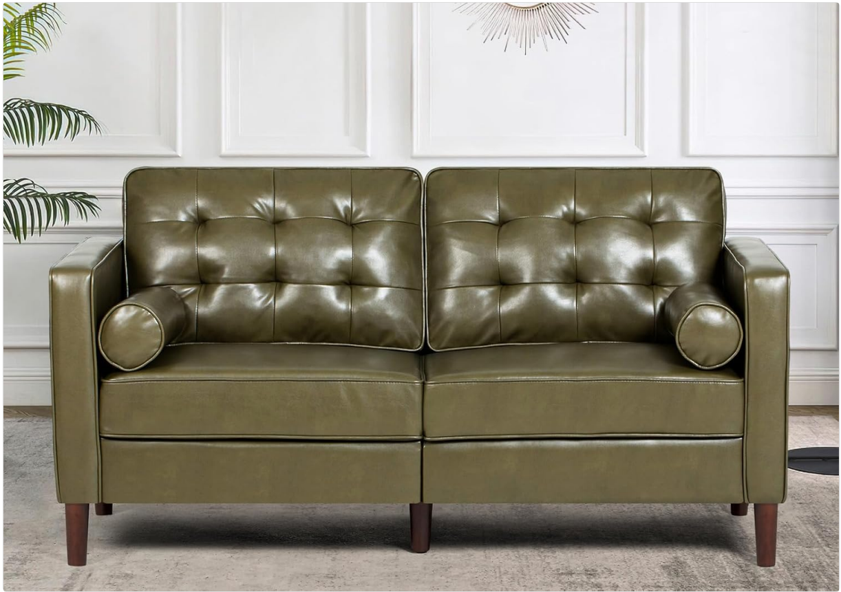
Image: The Nansiee 67-inch Faux Leather Loveseat in Olive Green, showing its complete assembled form with two bolster pillows.