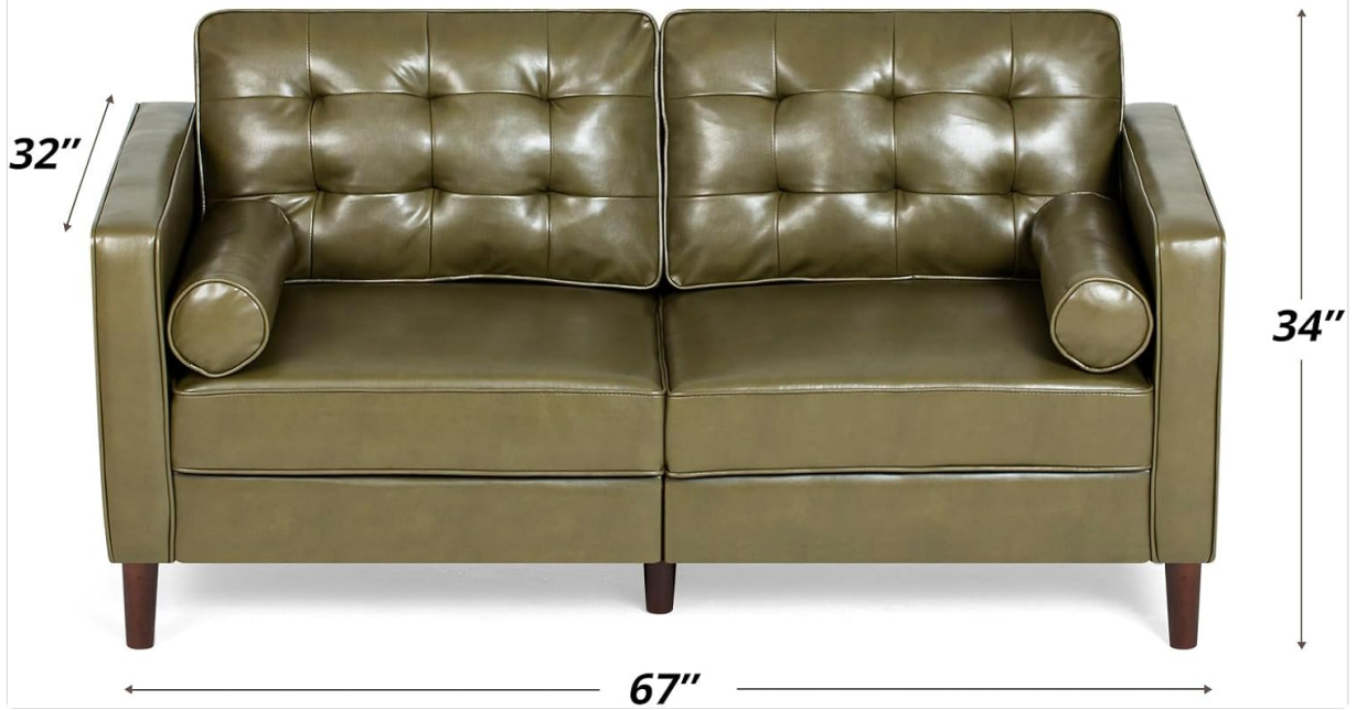
Image: Diagram illustrating the dimensions of the Nansiee Loveseat: 32 inches deep, 67 inches wide, and 34 inches high.