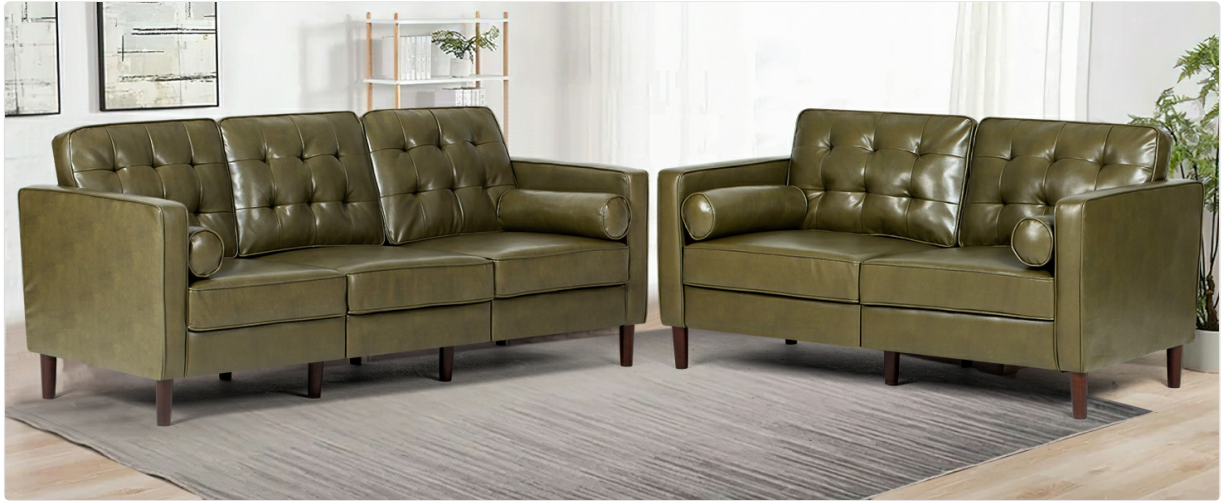
Image: The Nansiee Loveseat positioned in a modern living room, demonstrating its suitability for different spaces.