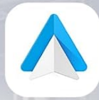
Wireless Android Auto