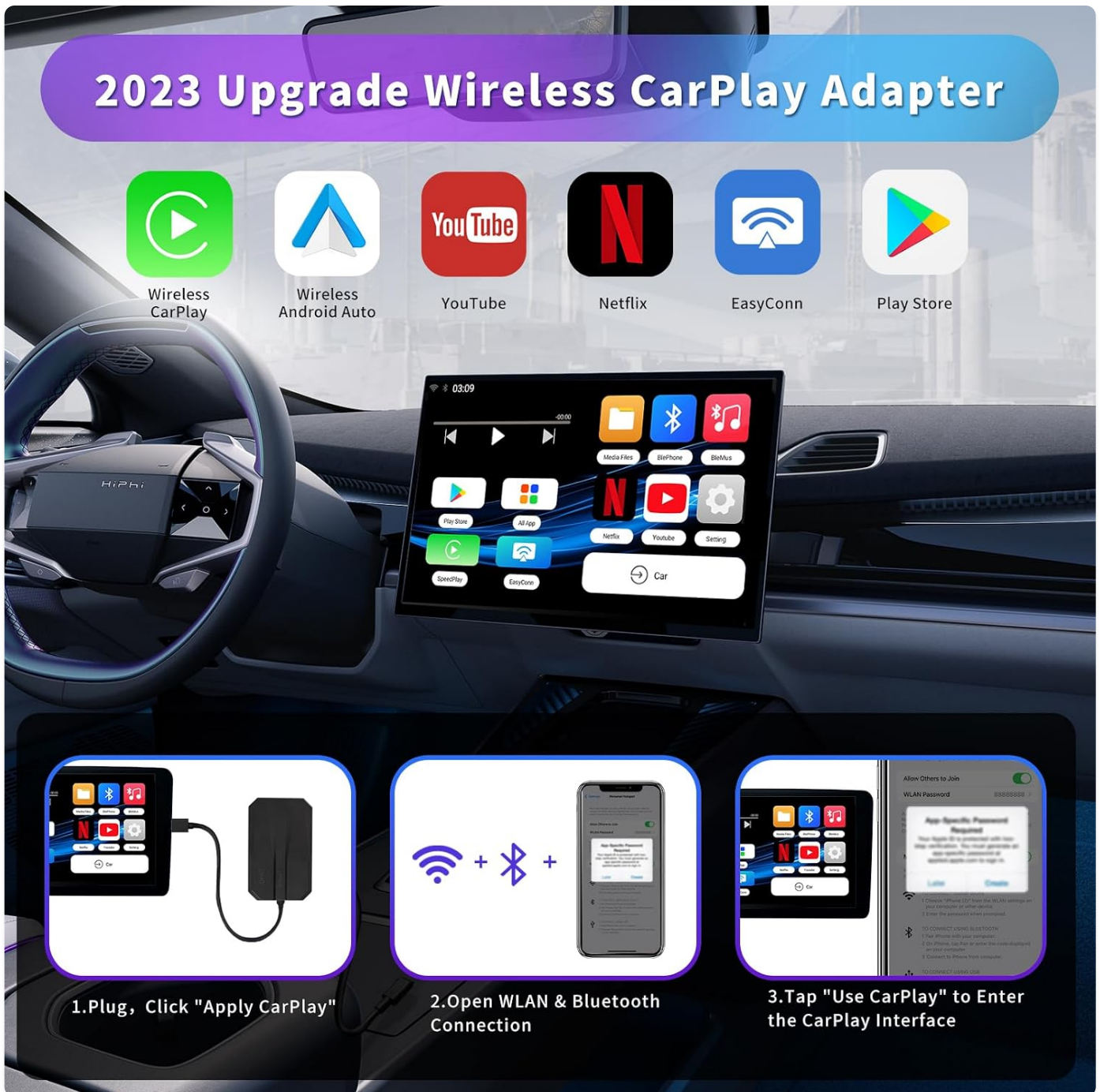
Image: Visual guide for connecting the wireless CarPlay adapter.