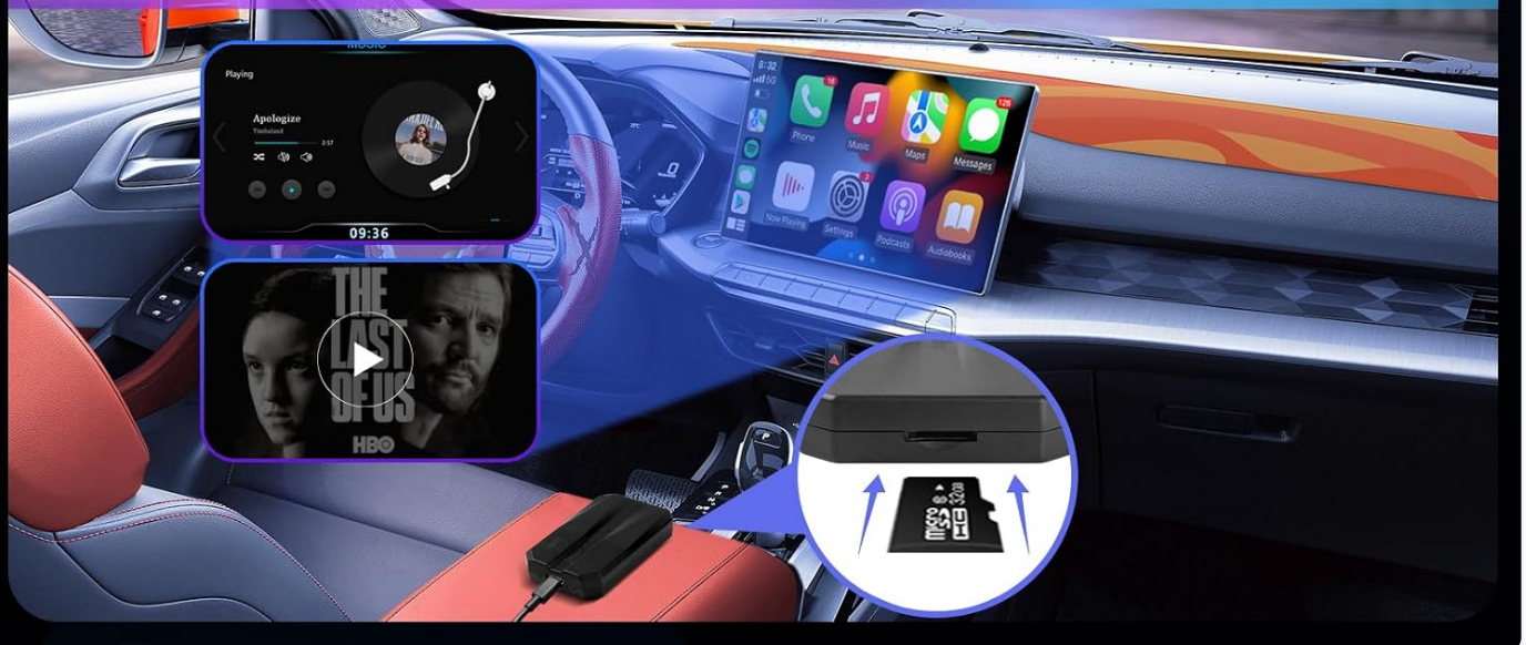
Image: Demonstrates watching streaming services and using the TF card slot.

Support TF card video and music playback