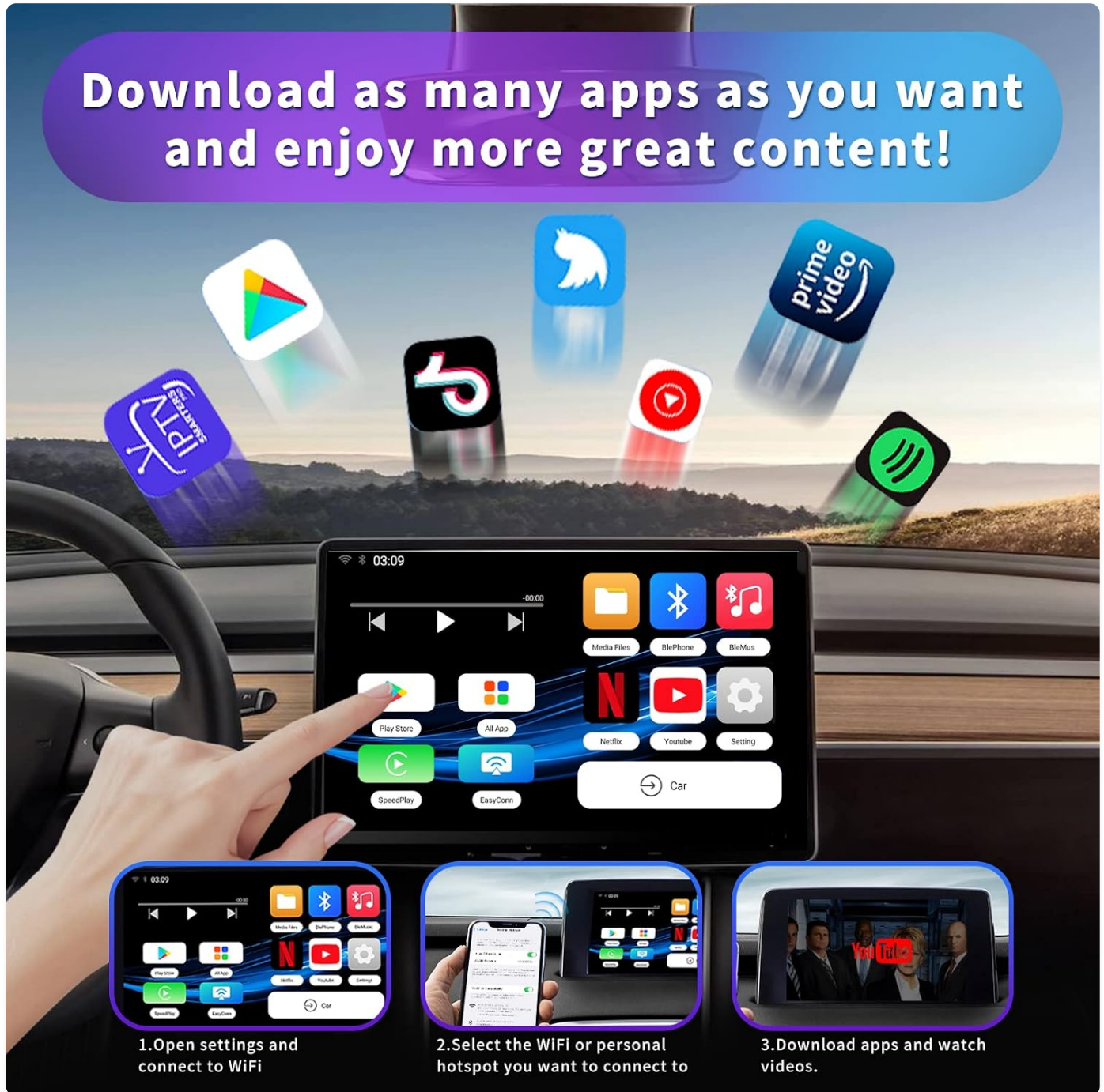
Image: Car display showing various apps available for download and use.