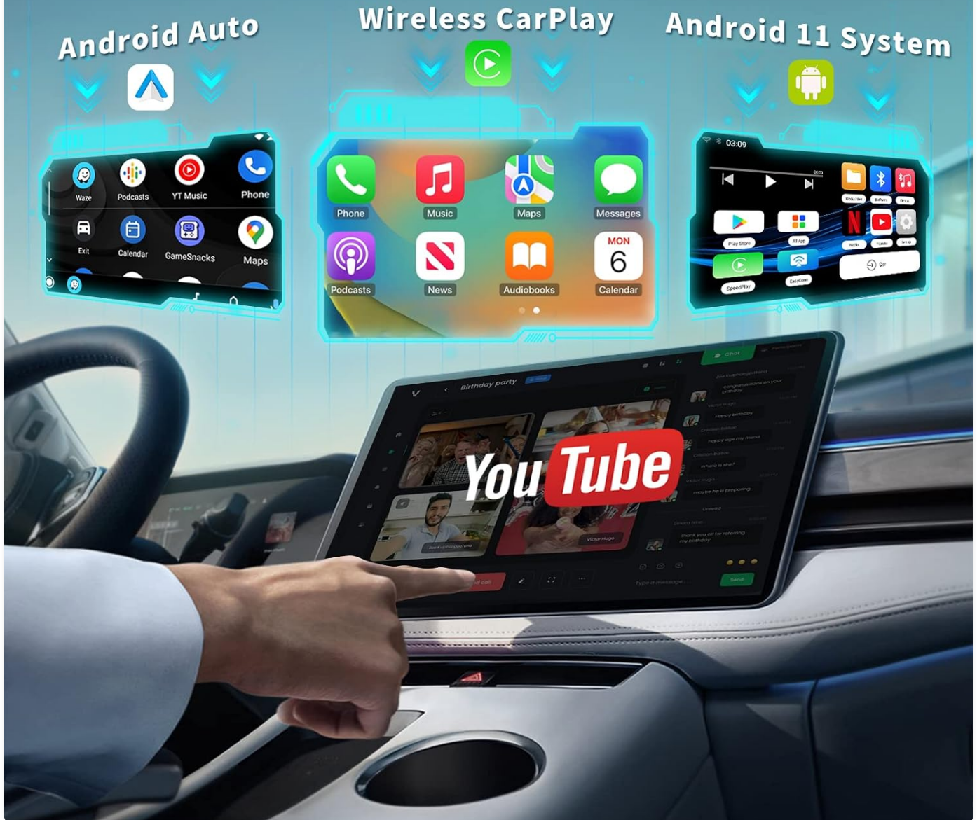
Image: Visual representation of the three systems supported: Android Auto, Wireless CarPlay, and Android 11.