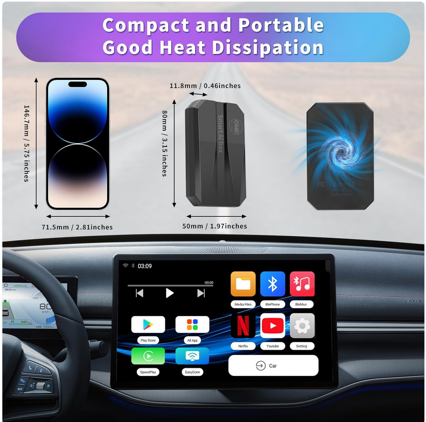
Image: Illustrates the compact size and heat dissipation design of the Smart AI Box.