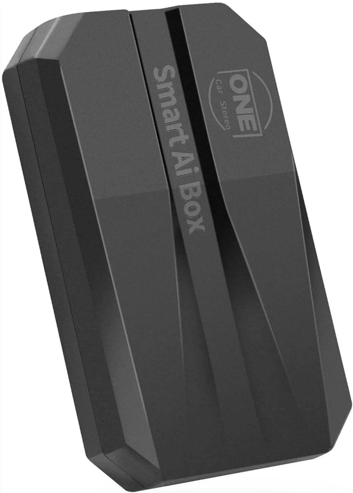
Image: The compact OneCarStereo Smart AI Box.