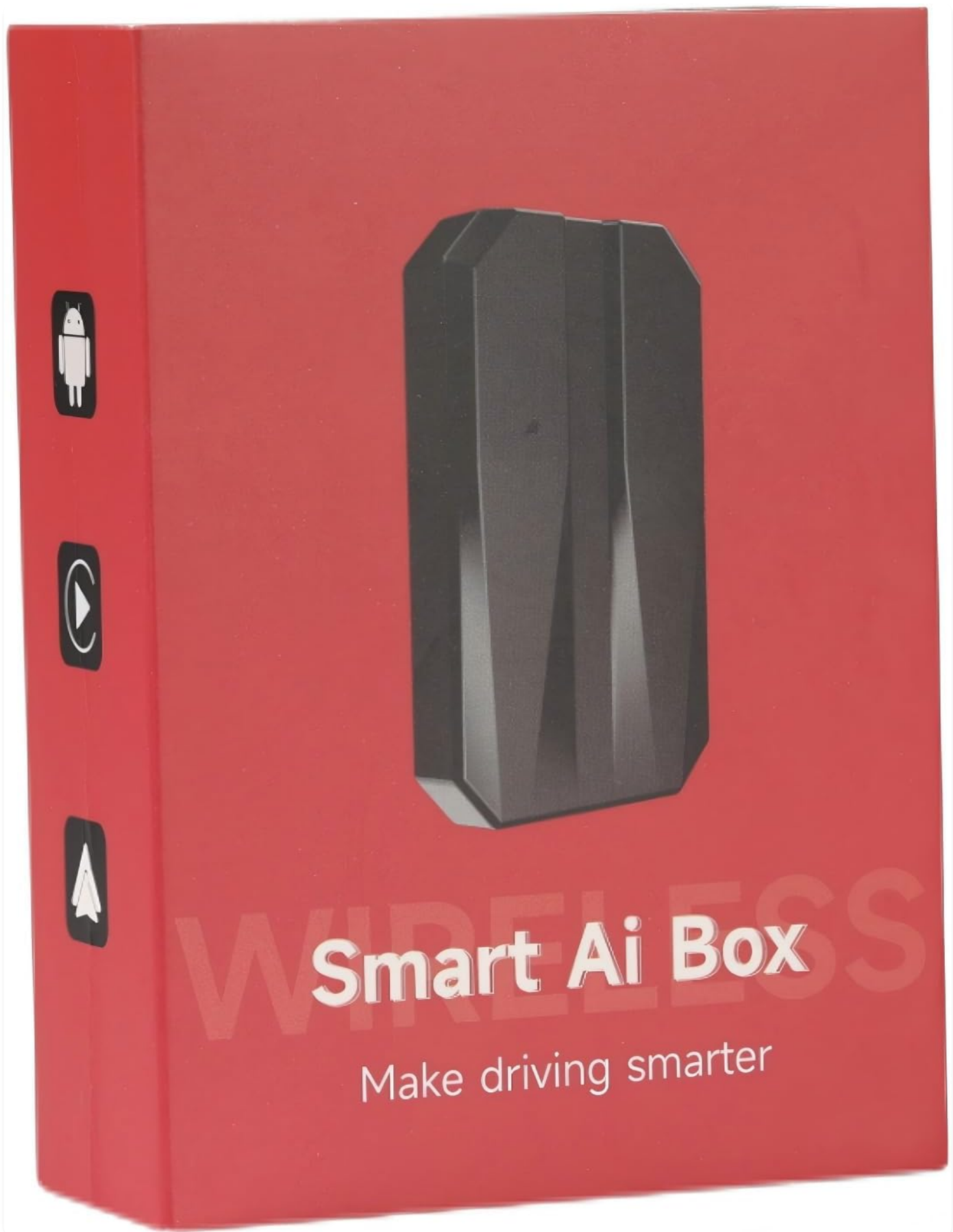
Image: The retail packaging of the Smart AI Box, indicating contents.