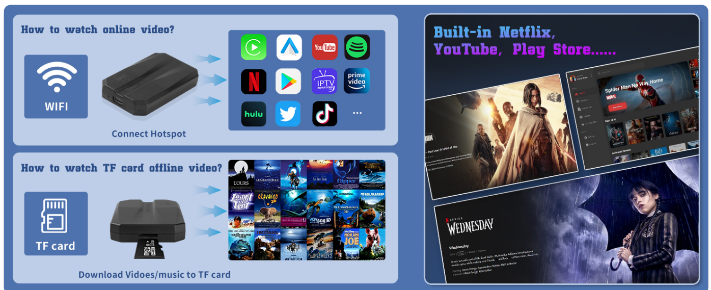
Image: Visual guide for MirrorLink setup and usage.

Video: Demonstrates how to connect Android wireless MirrorLink.