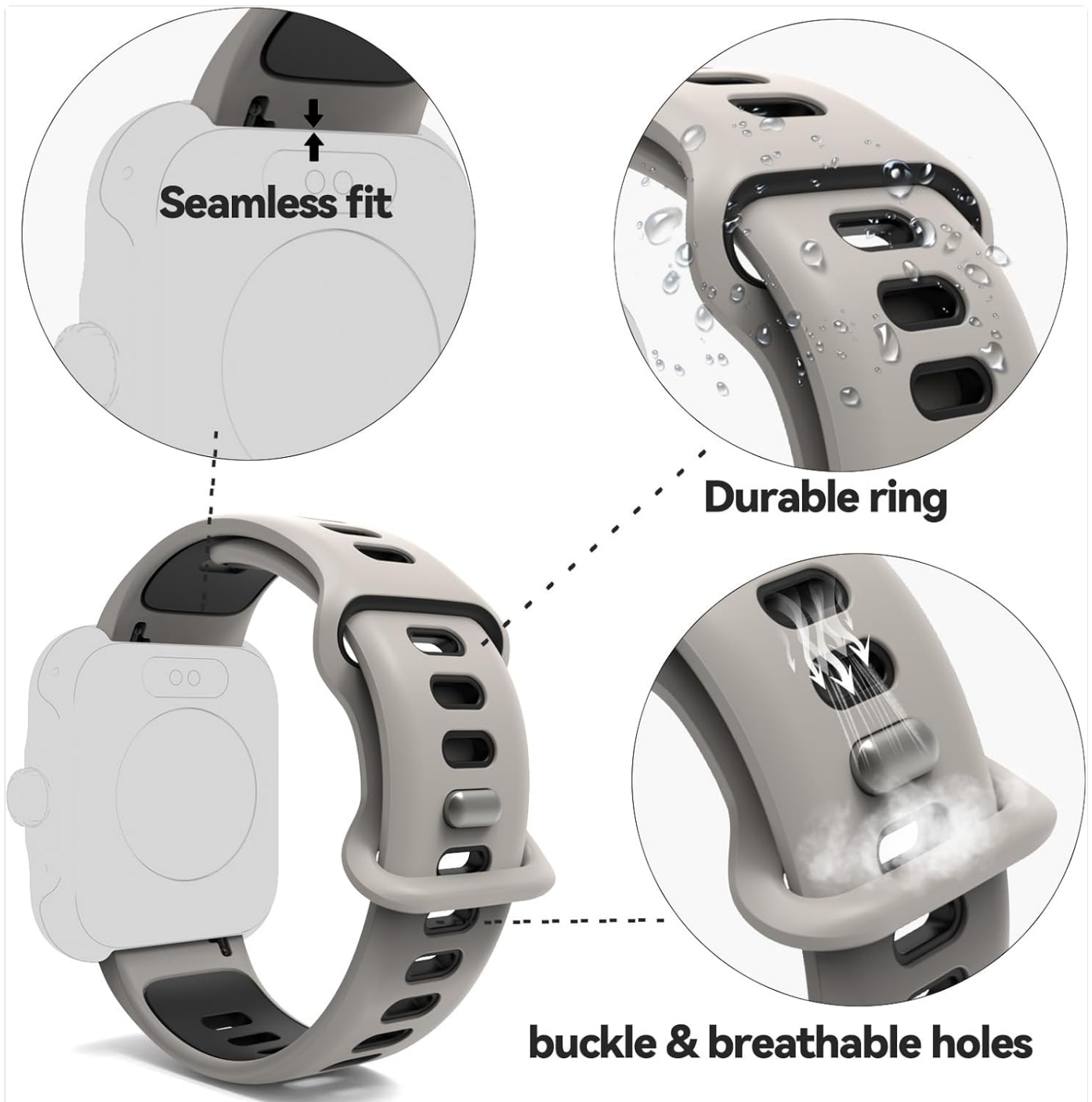
Image: Watch Band Features. This image details the design elements of the watch band, including its seamless connection to the watch, the durable retaining ring, the buckle, and the breathable holes, with water droplets indicating its water-resistant nature.