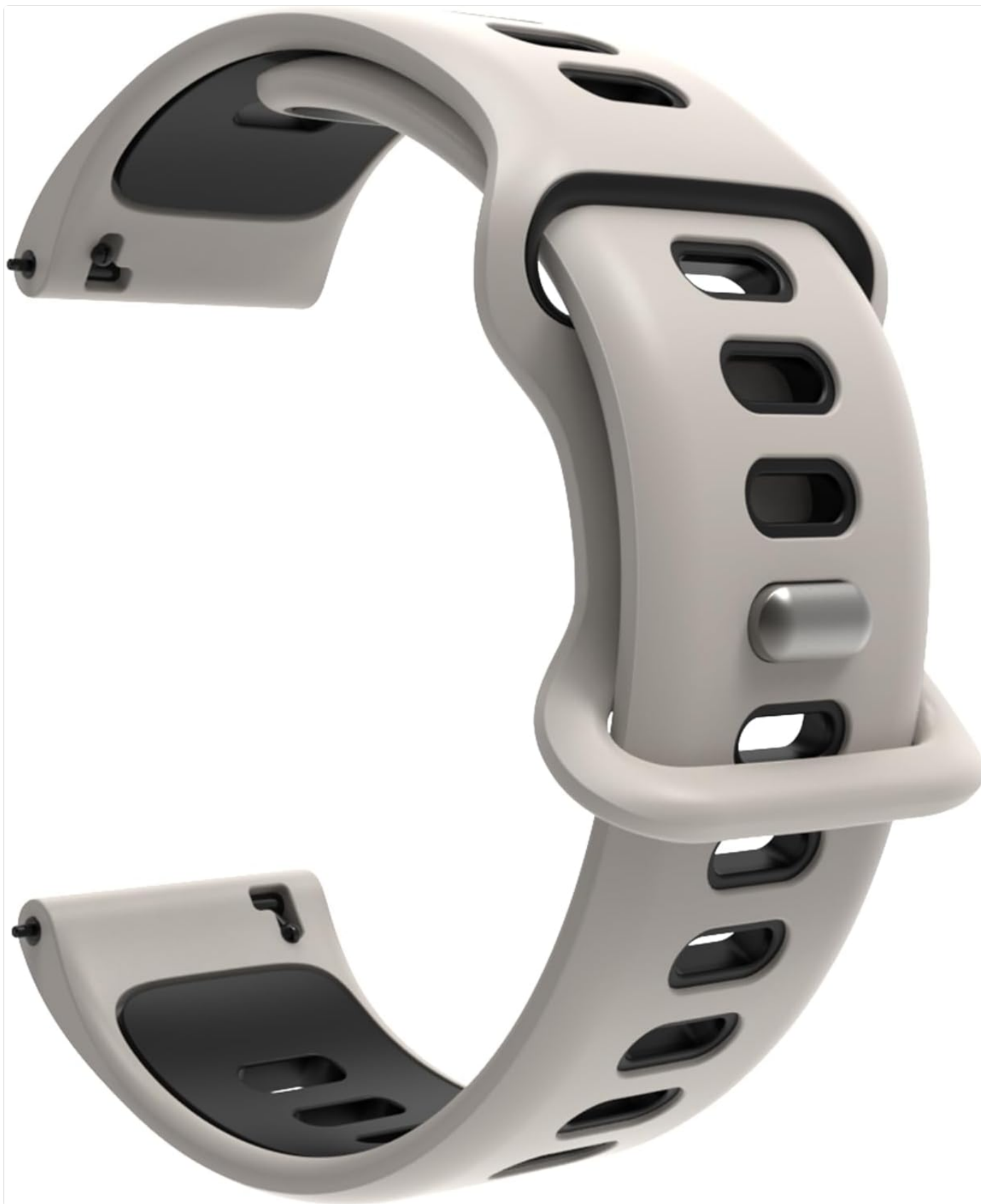
Image: anyloop Silicone Replacement Watch Band. A detailed view of the Dual White silicone watch band, showcasing its design and texture.