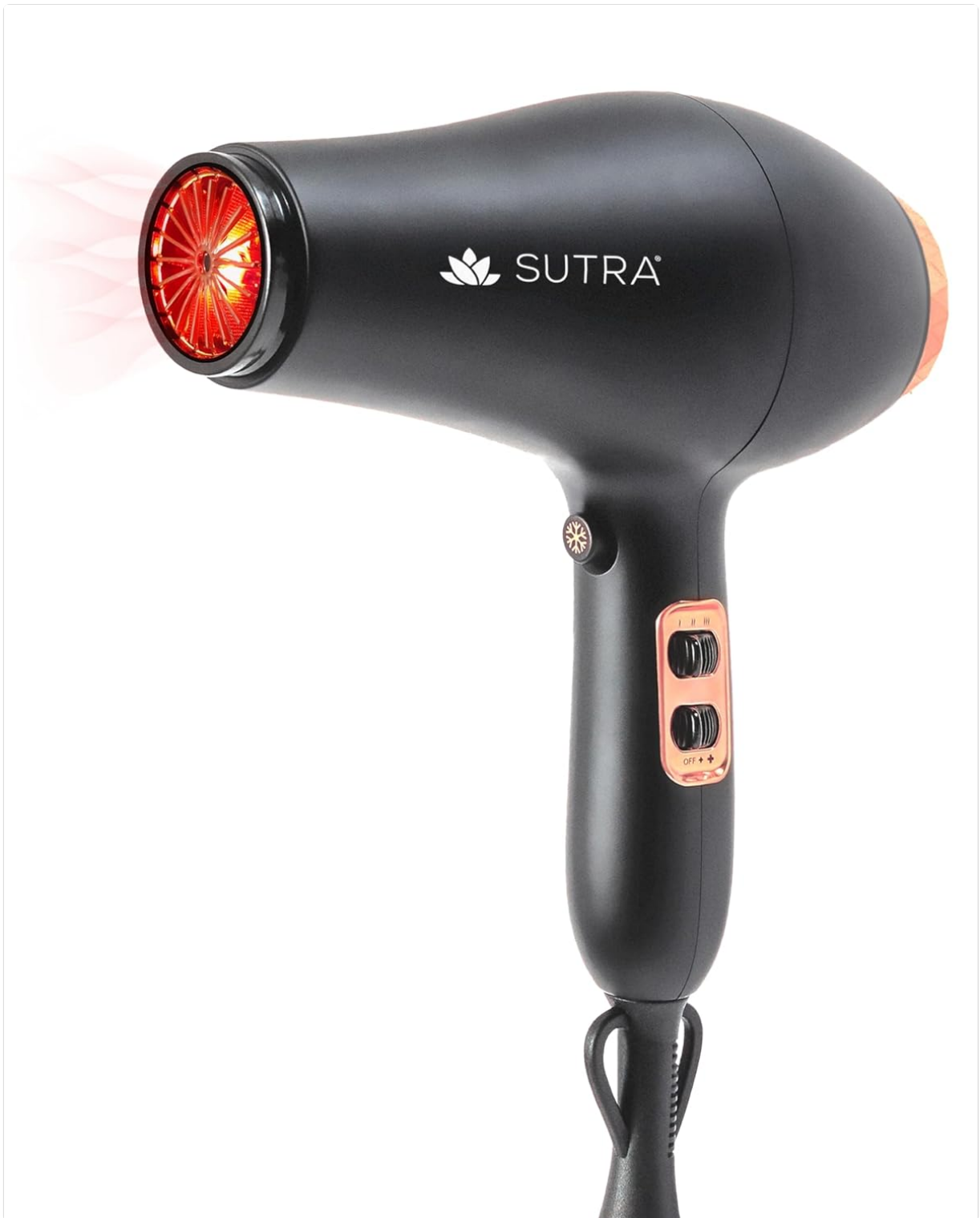
Image 2.1: The Sutra Infrared AC Blow Dryer, featuring its black matte finish and rose gold accents, with the infrared light visible at the nozzle.