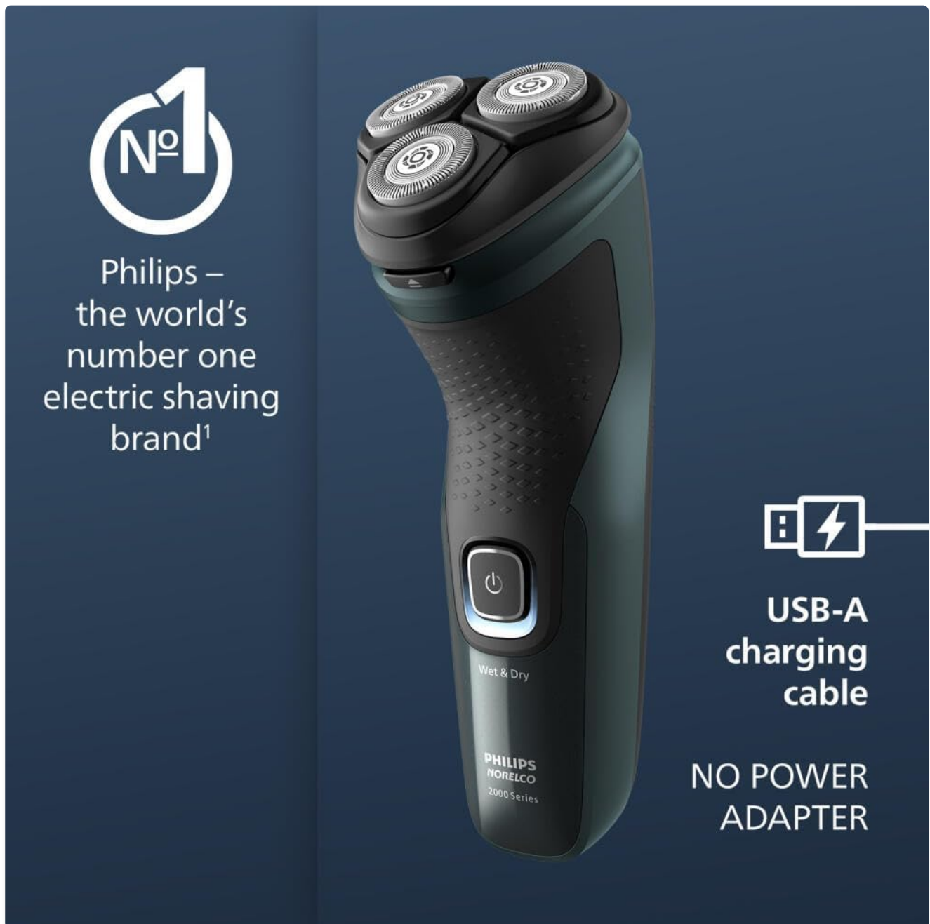
Image: The Philips Norelco Shaver 2600 Series alongside its USB-A charging cable, indicating that a power adapter is not included.

power adapter is not included and must be supplied by the user.