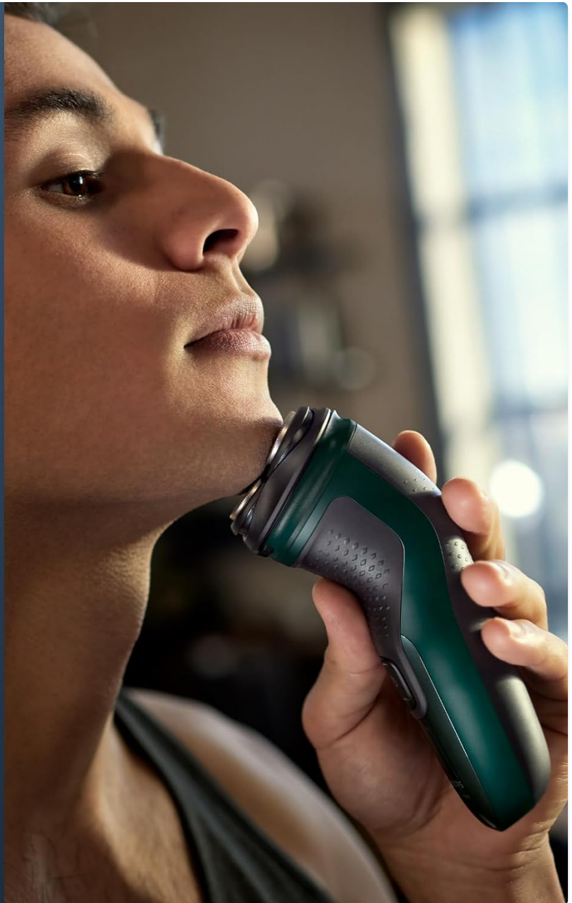
Image: A man using the Philips Norelco Shaver 2600 Series on his jawline, demonstrating the shaver's ergonomic design and skin protection technology.