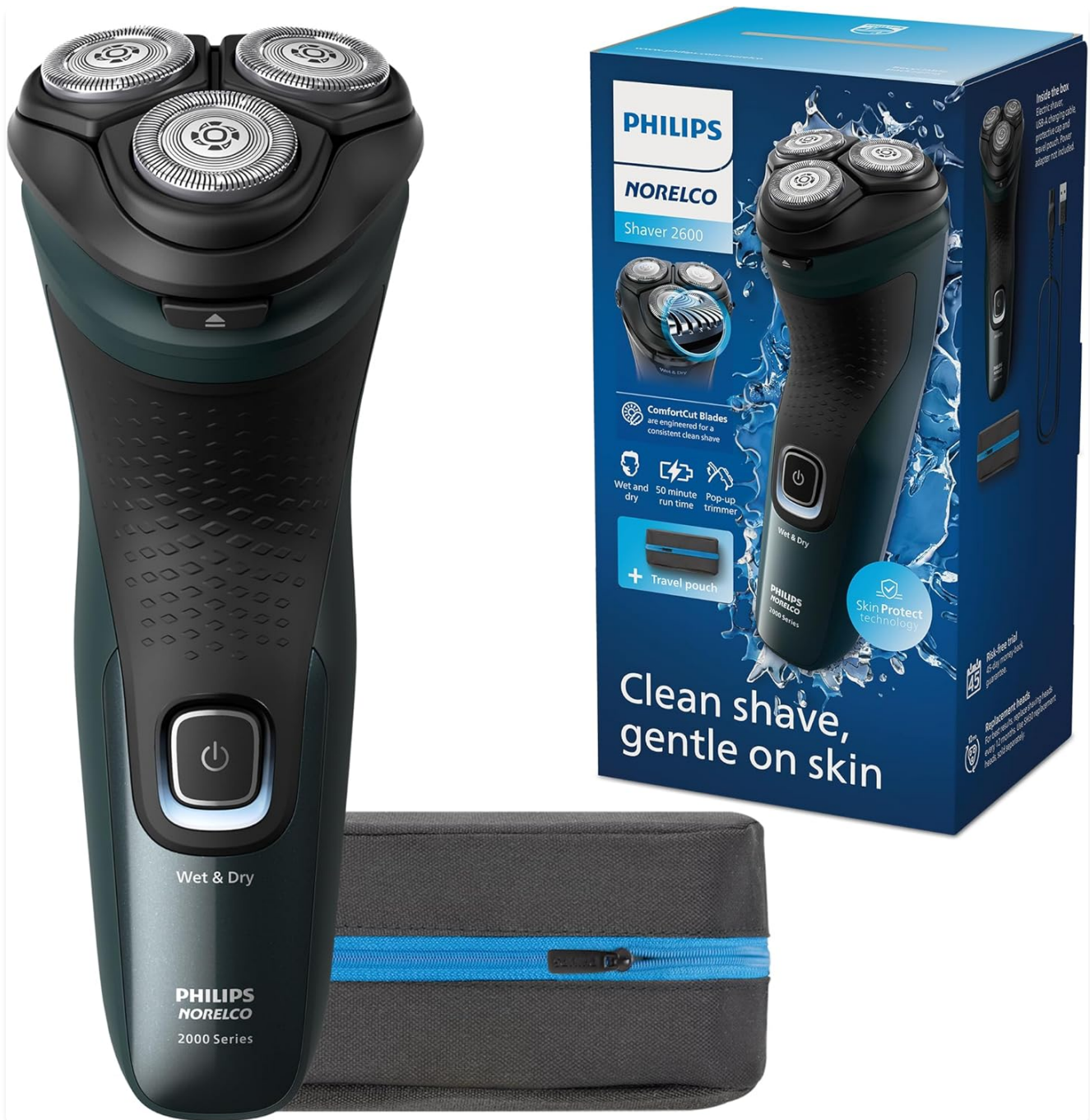
Image: The Philips Norelco Shaver 2600 Series, including the shaver unit, its retail packaging, and a travel pouch.