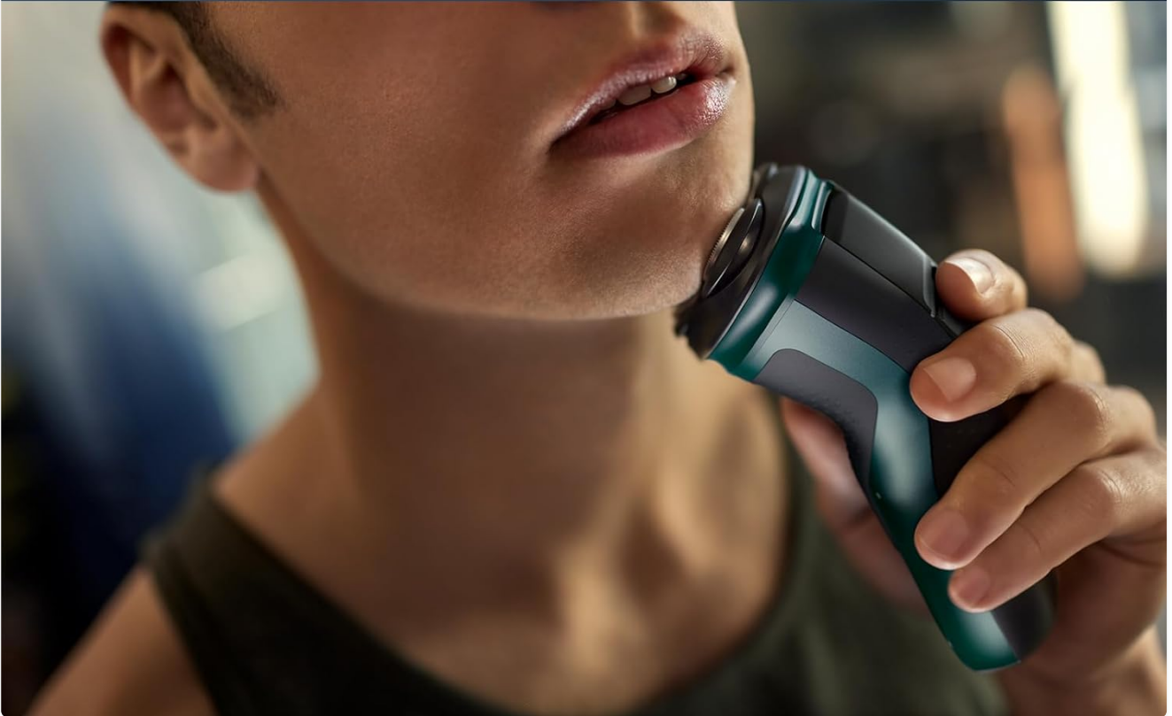
Image: A graphic illustrating the 4D Flex Heads of the Philips Norelco Shaver 2600 Series, designed to follow facial contours for a clean shave.

4D Flex Heads follow facial contours for a clean shave