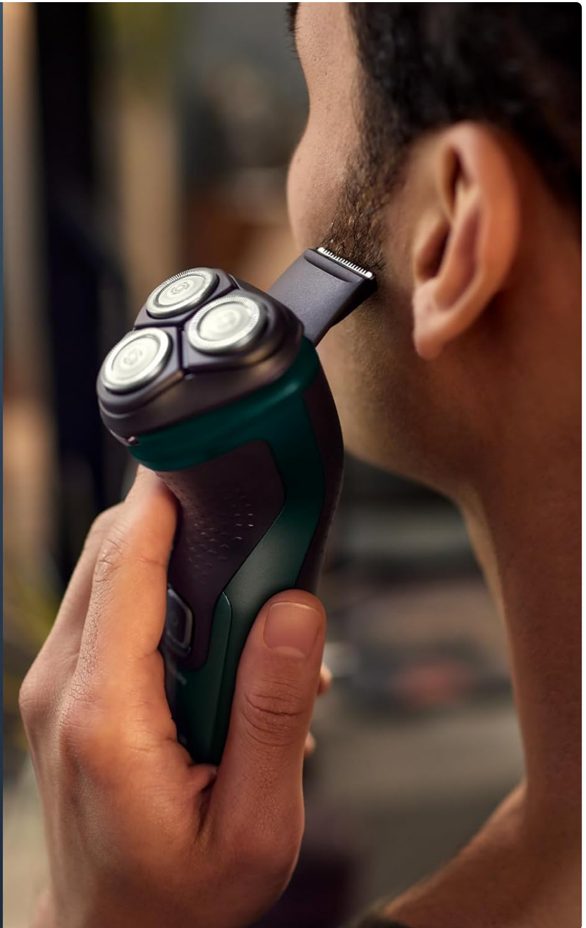
Image: A hand demonstrating the use of the pop-up trimmer on the Philips Norelco Shaver 2600 Series, suitable for refining sideburns and mustaches.