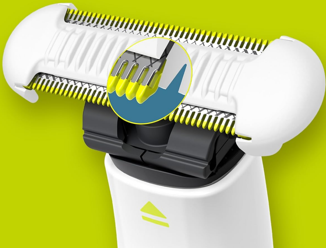
Image: The SkinProtect blade features a triple protection system with rounded edges, a bridge, and rounded tips to prevent skin irritation.

Triple protection system designed to prevent skin irritation