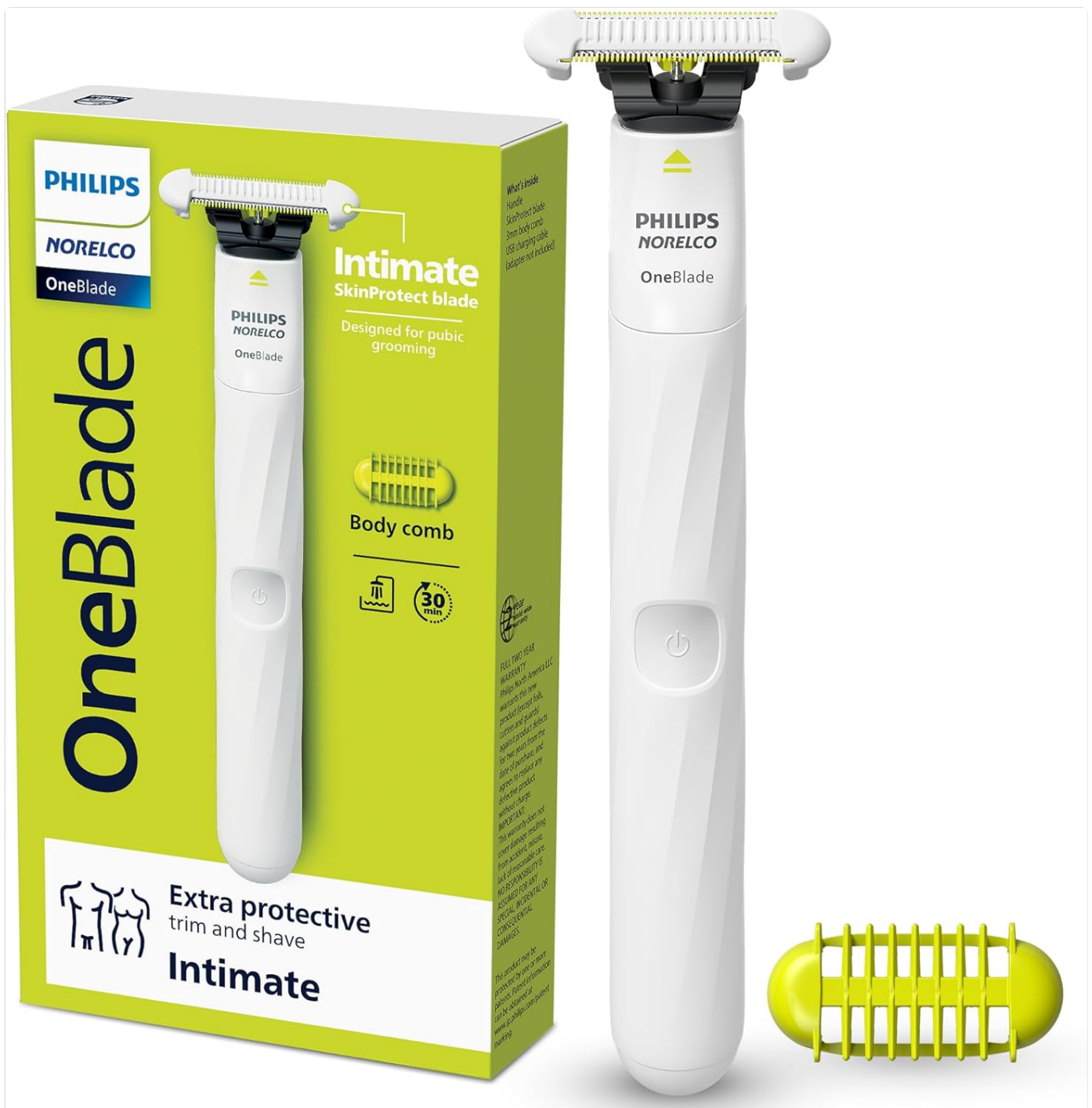
Image: The Philips Norelco OneBlade Intimate device, its retail packaging, and the included 3mm body comb.