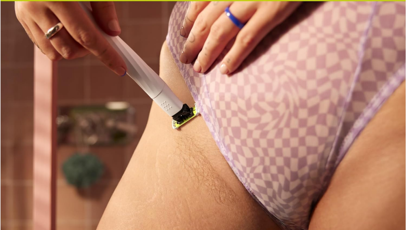
Image: Illustration of the recommended shaving technique: stretch skin, lay blade flat, and shave slowly against the grain.