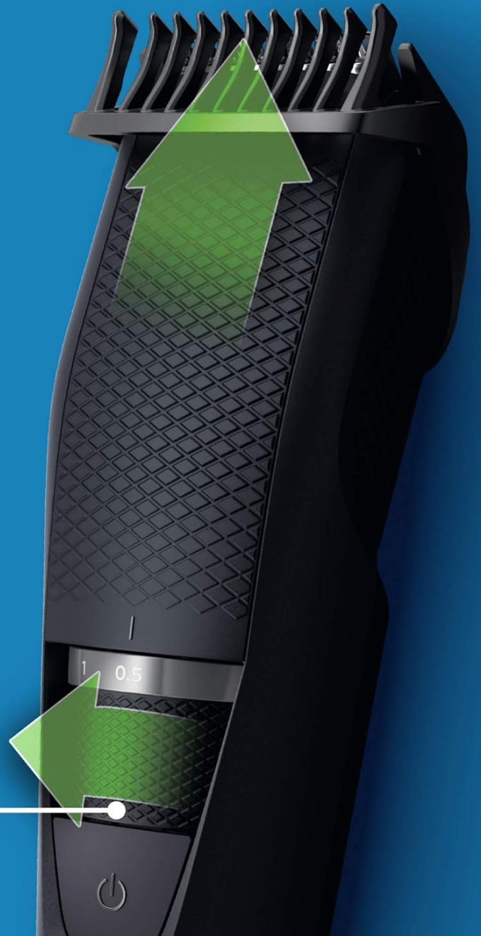
Image: The Philips Norelco Beard Trimmer highlighting the zoom wheel for locking in 10 different length settings.