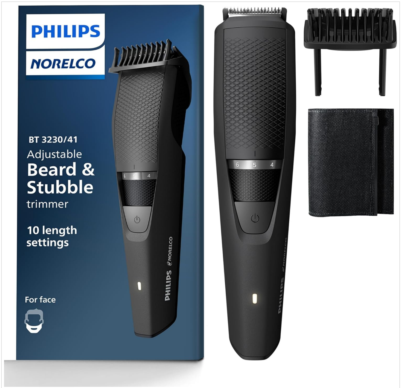
Image: Philips Norelco Beard Trimmer and Hair Clipper BT3230/41, showing the trimmer, adjustable comb, and charging cable.