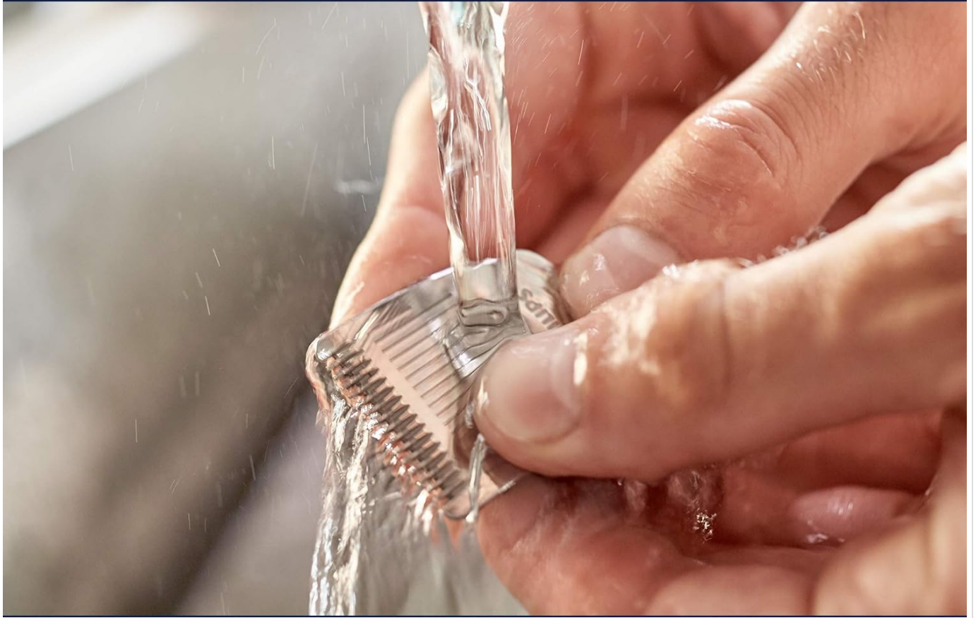
Image: The detachable head of the Philips Norelco Beard Trimmer being rinsed under running water, demonstrating its ease of cleaning.