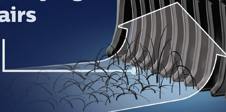
Image: An illustration demonstrating the Lift & Trim system of the Philips Norelco Beard Trimmer, showing how it lifts low-lying hairs for a more effective trim.