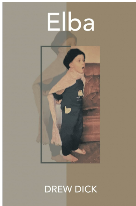
Image 1: Front cover of "Elba" by Drew Dick. The cover features the title "Elba" at the top, an image of a young child wearing a hat and scarf in the center, and the author's name "DREW DICK" at the bottom. The background is a split tone of light and dark brown.