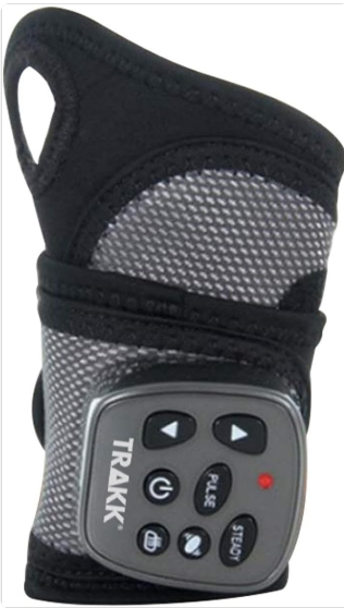
Front view of the TRAKK Wrist & Hand Massager, showing the main unit and adjustable strap.