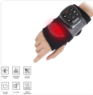
The massager in use, showing the red light indicating active heat therapy.