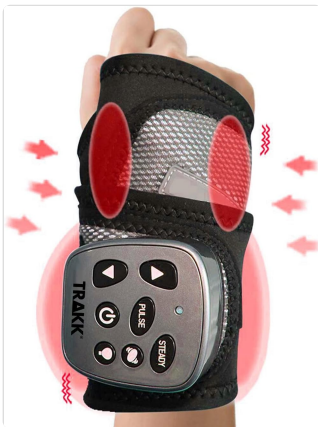
Diagram illustrating the heat distribution from the massager's contact points.