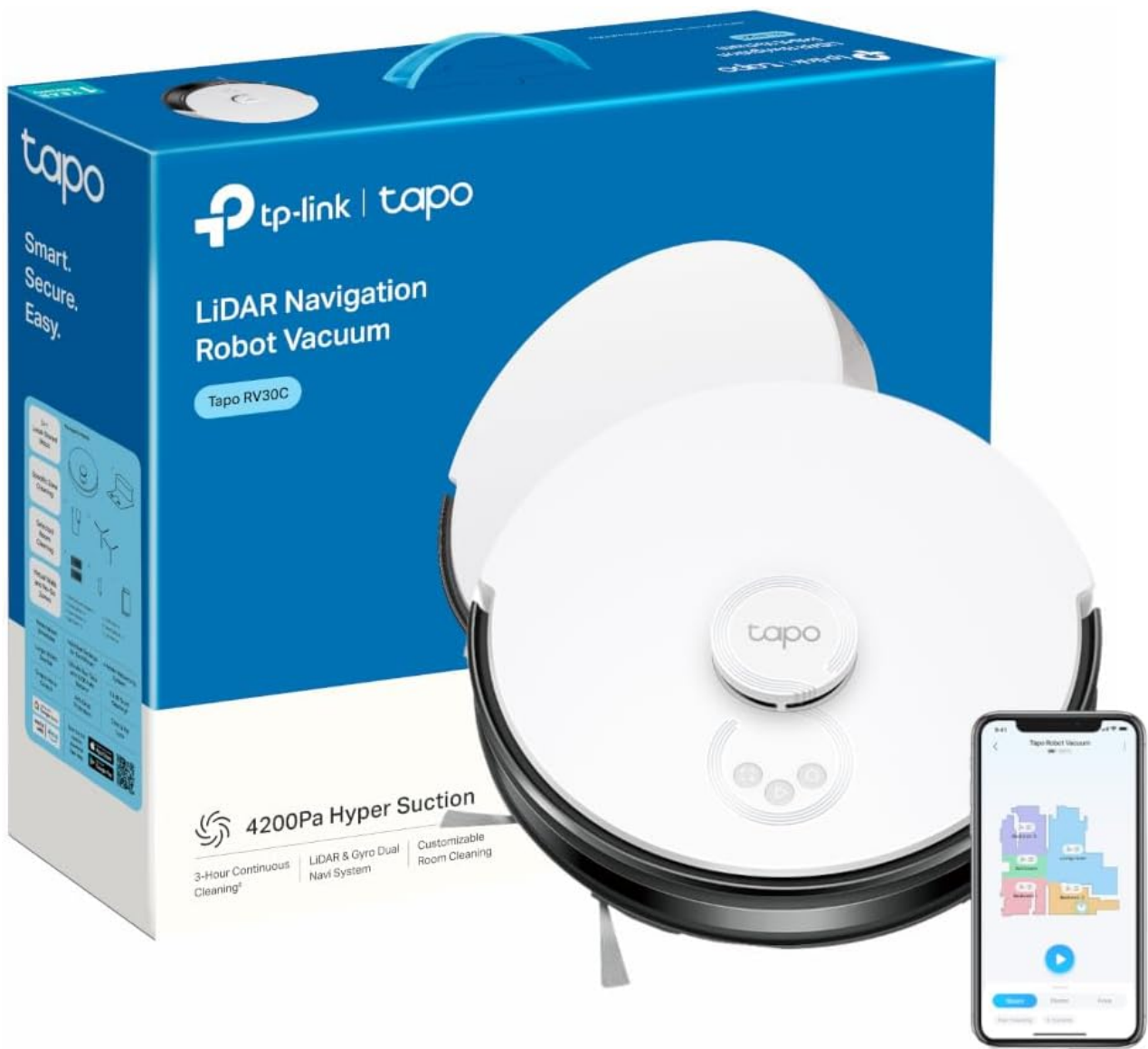
Image: The Tapo RV30C Robot Vacuum, its retail box, and a smartphone displaying the Tapo application's mapping feature.