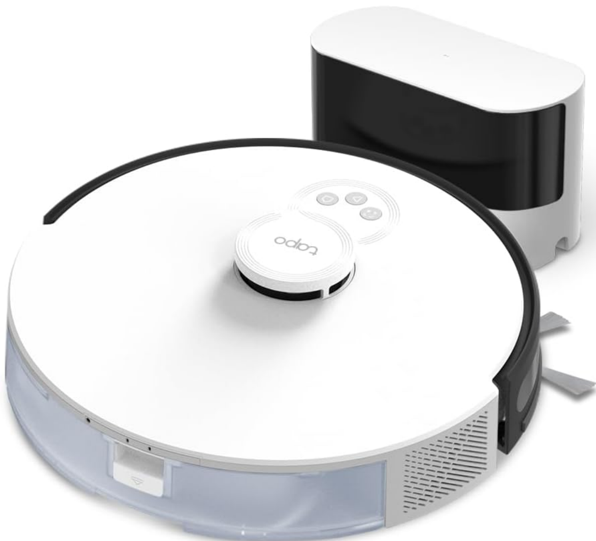
Image: The Tapo RV30C Robot Vacuum positioned next to its charging base.