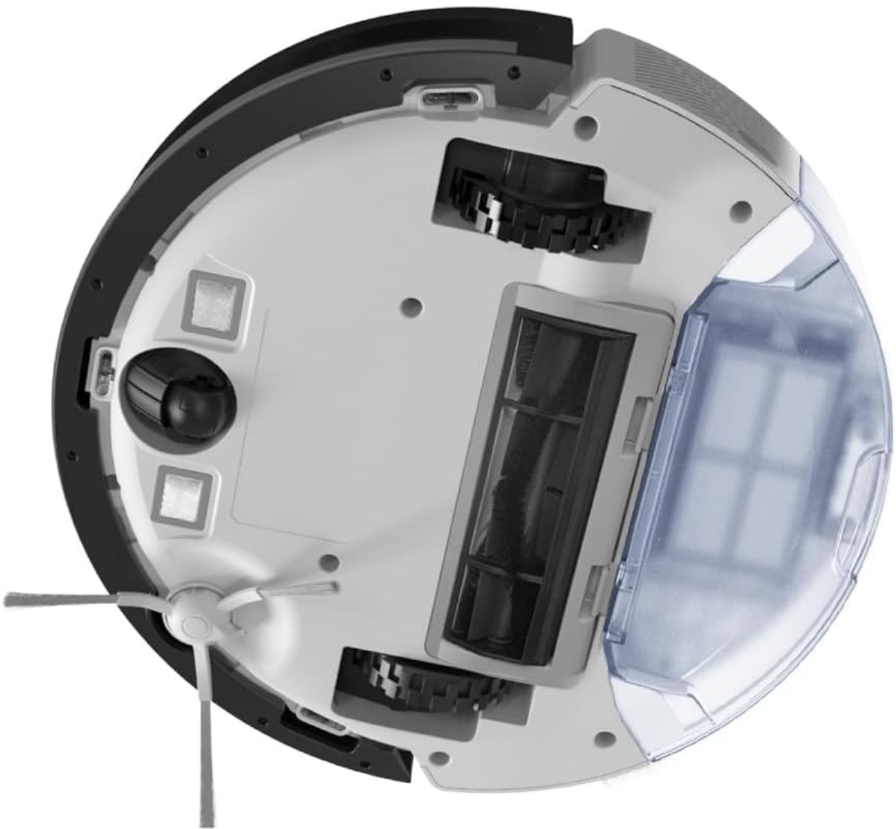
Image: The underside of the Tapo RV30C, showing the main brush, side brushes, and dust bin compartment.