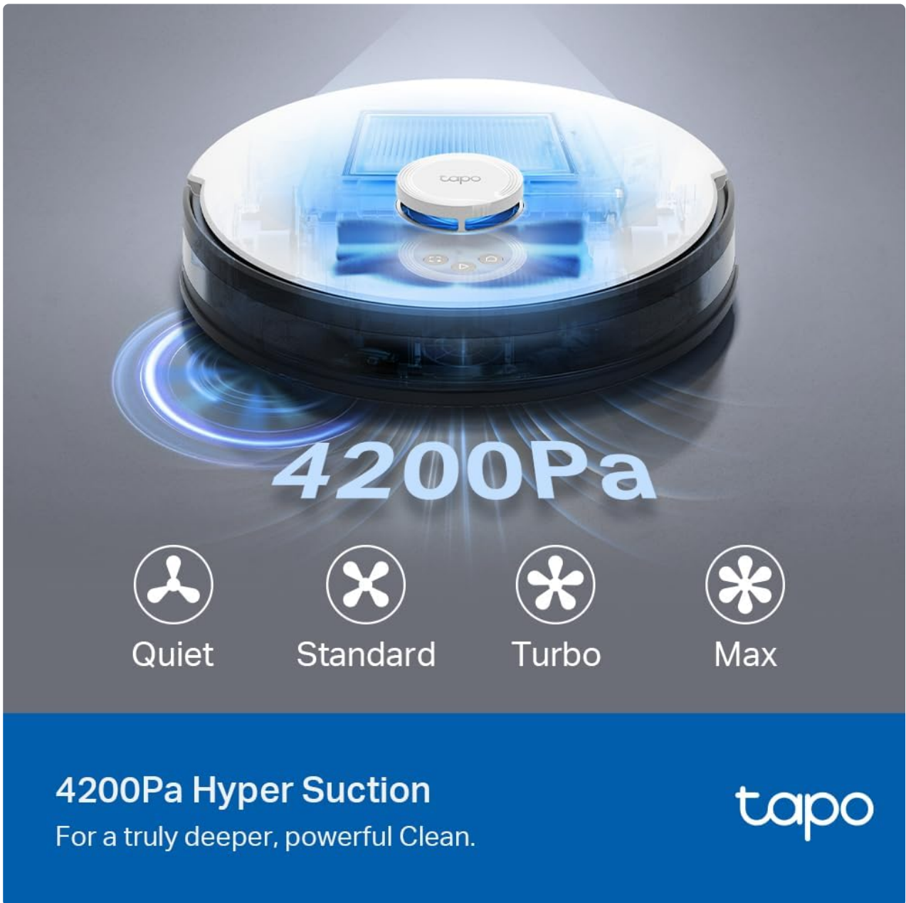
Image: A detailed view highlighting the 4200Pa Hyper Suction capability and various cleaning modes.