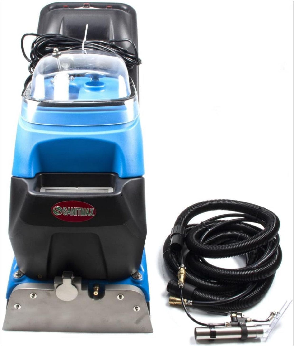
Figure 1: SANITMAX SM350 Main Unit with Accessories. This image displays the complete carpet extractor unit in blue and black, alongside its coiled hose and hand tool attachment, ready for operation.

The SANITMAX SM350 is a robust commercial carpet extractor designed for efficiency and deep cleaning.