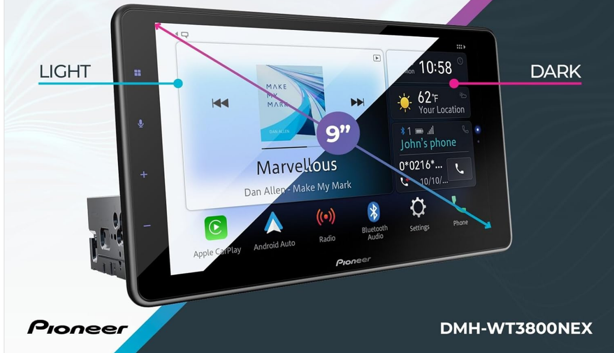
Figure 6: An illustration demonstrating the exclusive Light and Dark modes available on the Pioneer DMH-WT3800NEX. The image shows how the display automatically switches between these modes, optimizing screen visibility and reducing eye strain in varying lighting conditions, such as day and night driving.