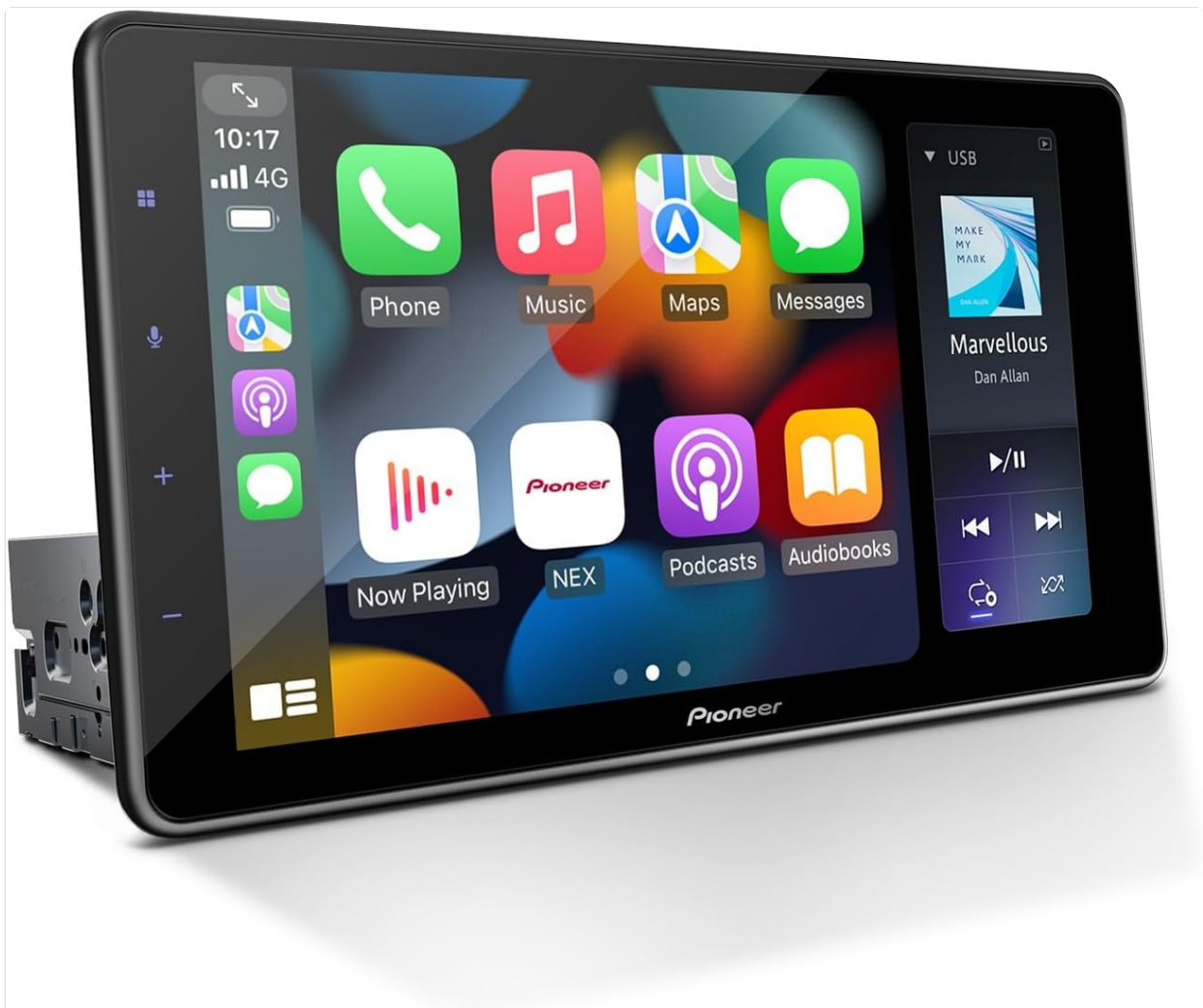
Figure 2: This image displays the Pioneer DMH-WT3800NEX unit, highlighting its large 9-inch touchscreen. The screen shows the Apple CarPlay interface with various app icons like Phone, Music, Maps, and Messages, indicating its smartphone integration capabilities. The unit features a sleek, minimalist design with physical buttons on the left side.