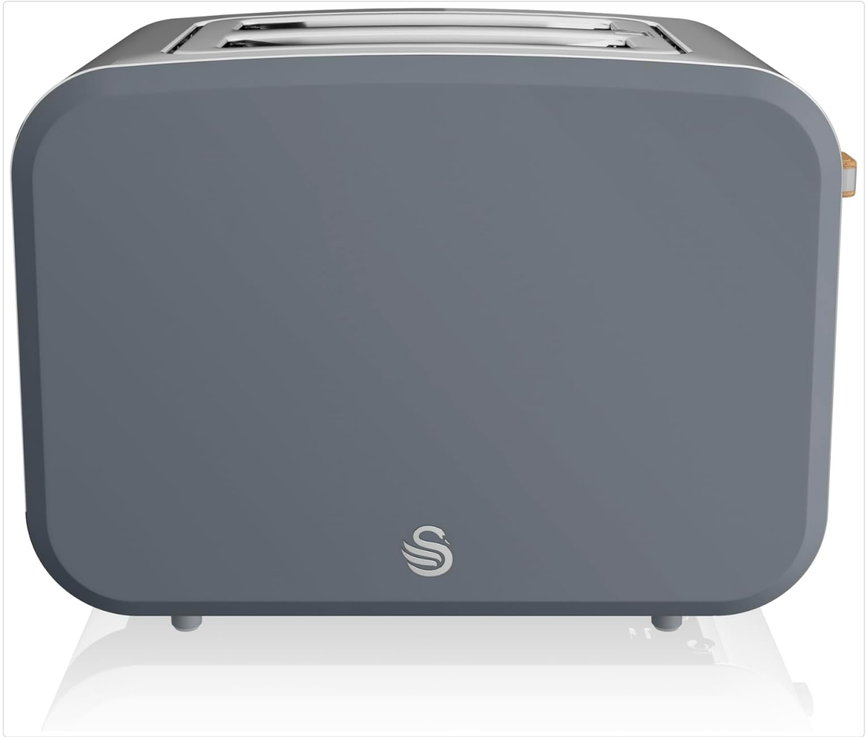
Image 1: Front view of the Swan SNT2G Nordic 2-Slice Toaster in Slate Grey, showcasing its minimalist design and the Swan logo.

The Swan SNT2G Nordic 2-Slice Toaster features a sleek slate grey design with a durable stainless steel body and rubberized finish. It includes wood effect controls for a modern aesthetic and practical functionality.