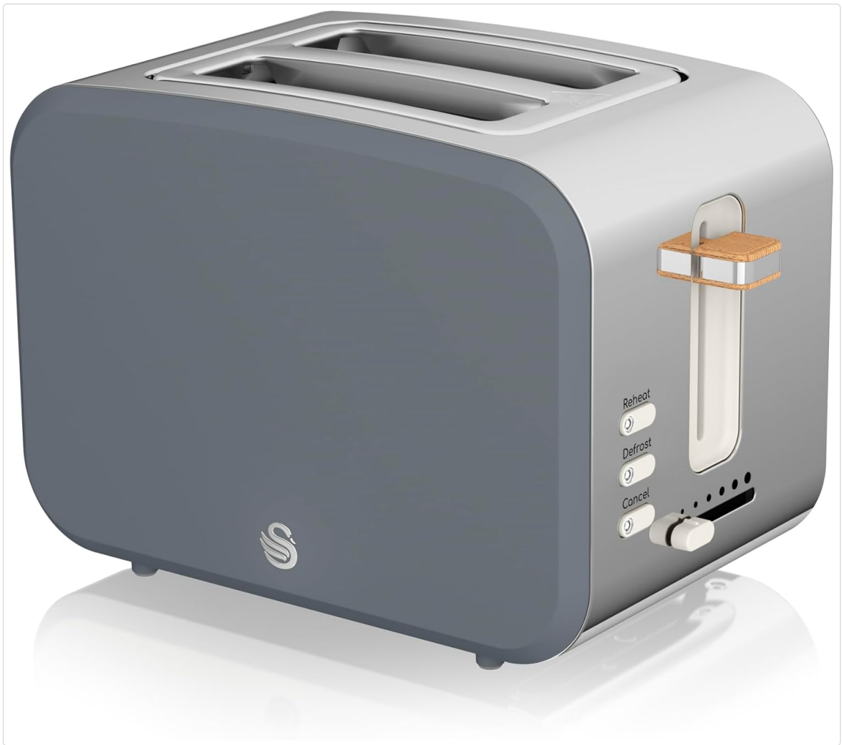
Image 2: Angled view of the toaster, highlighting the control panel with Reheat, Defrost, and Cancel buttons, along with the browning control dial and toast lever.