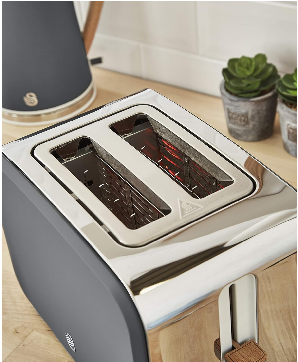
Image 4: Top view of the toaster, showing the two wide toasting slots designed to accommodate various bread types.