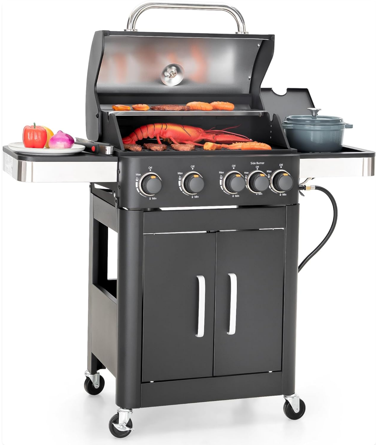
Image 1.1: The Captiva Designs 4-Burner Propane Gas BBQ Grill, featuring a main cooking area, side burner, and storage cabinet.

The Captiva Designs 4-Burner Propane Gas BBQ Grill is designed for outdoor cooking, offering a total of 46,700 BTU output. It features porcelain-enameled cast iron grates for even heat distribution and durability, a side burner for additional cooking flexibility, and a built-in thermometer for temperature monitoring.