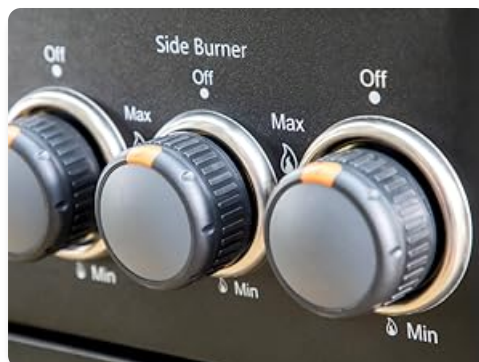
Image 6.1: Control knobs for individual burners, allowing precise temperature adjustment.