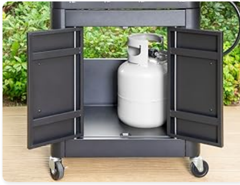
Image 5.1: The internal cabinet provides secure storage for a standard propane tank.