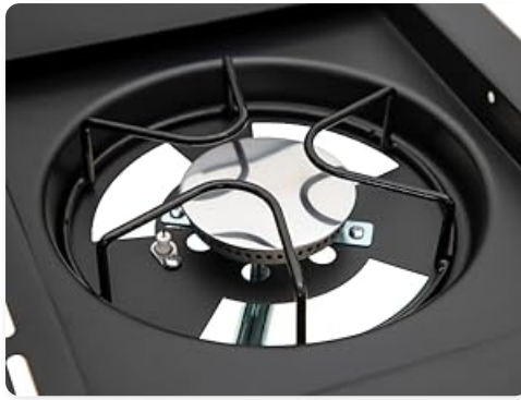
Image 6.2: The integrated side burner provides additional cooking capacity for sauces or side dishes.