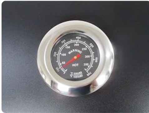
Image 6.3: The lid-mounted thermometer displays the internal temperature of the grill.

The grill features a built-in thermometer on the lid to monitor the internal temperature. Adjust individual burner control knobs to achieve desired cooking temperatures. The porcelain-enameled cast iron grates ensure even heat distribution across the 360 sq. in. primary cooking area.