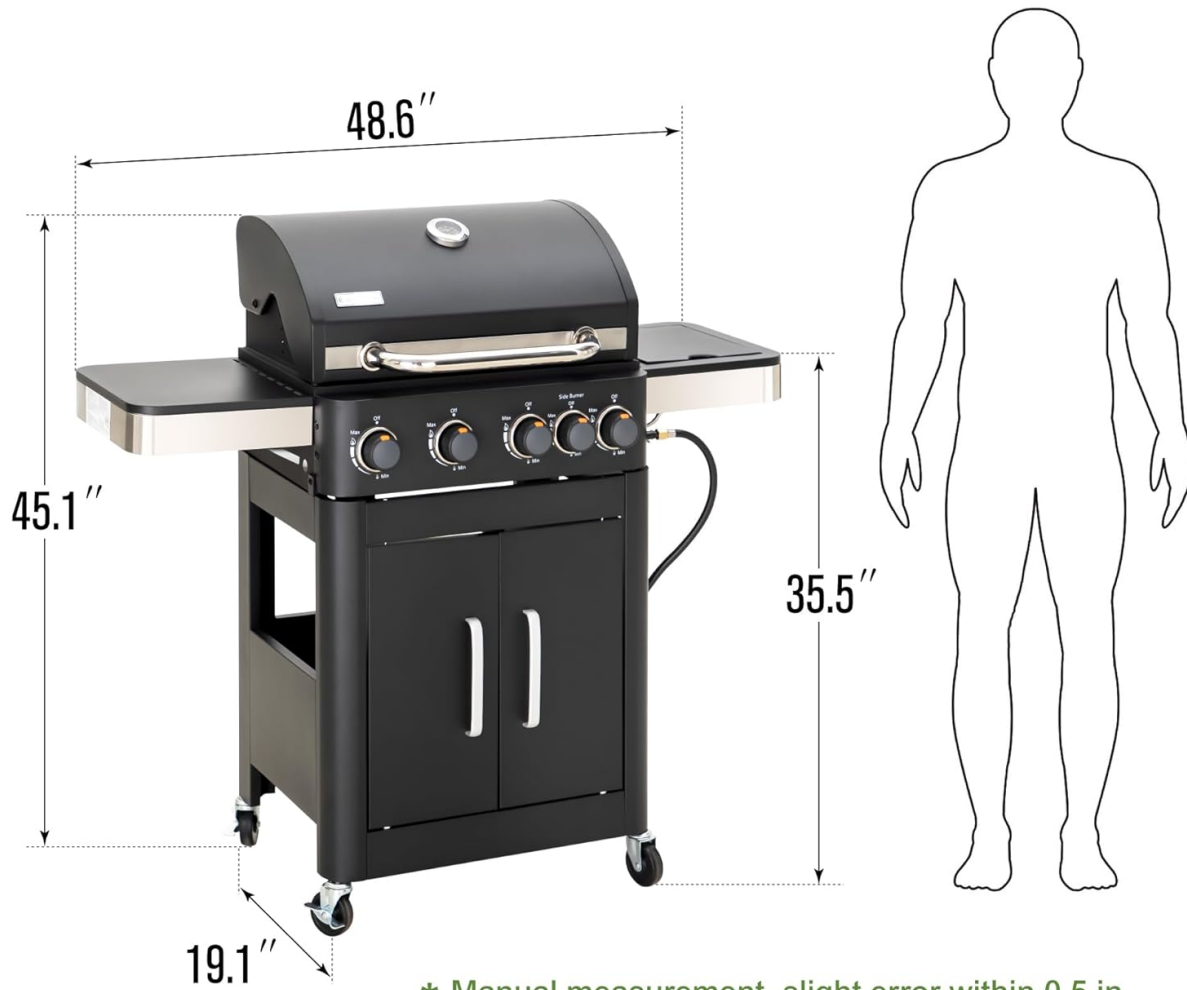
Image 4.1: Overall dimensions of the grill: 48.6"W x 19.1"D x 45.1"H, with a cooking height of 35.5 inches.