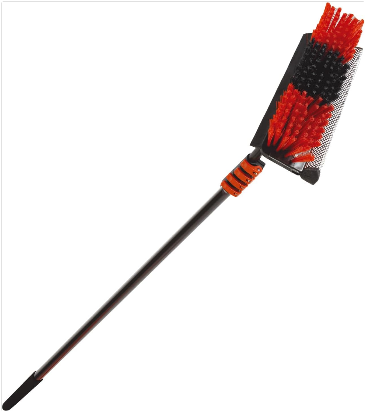
Figure 1: The HydroCleaner XL Telescoping Power Wash Brush, showcasing its extended reach and brush head.