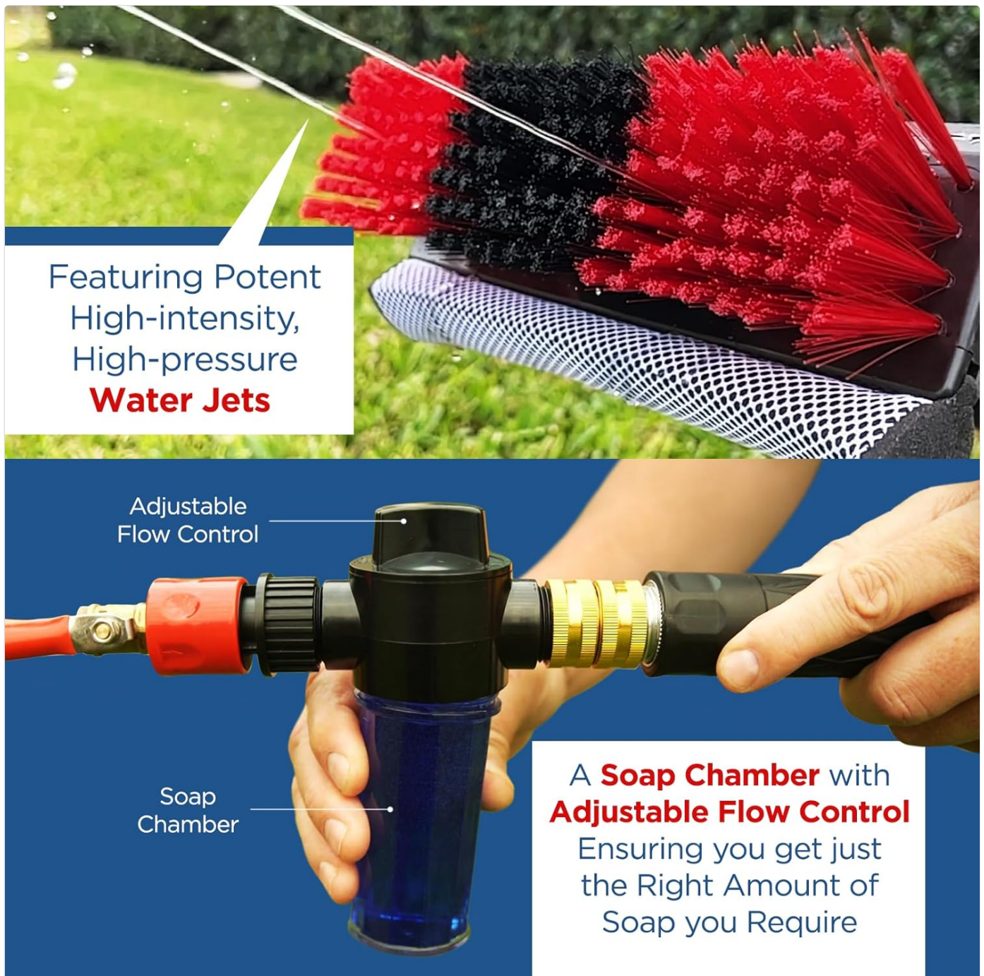
Figure 4: Close-up of the HydroCleaner XL demonstrating the potent high-pressure water jets and the soap chamber with its adjustable flow control.