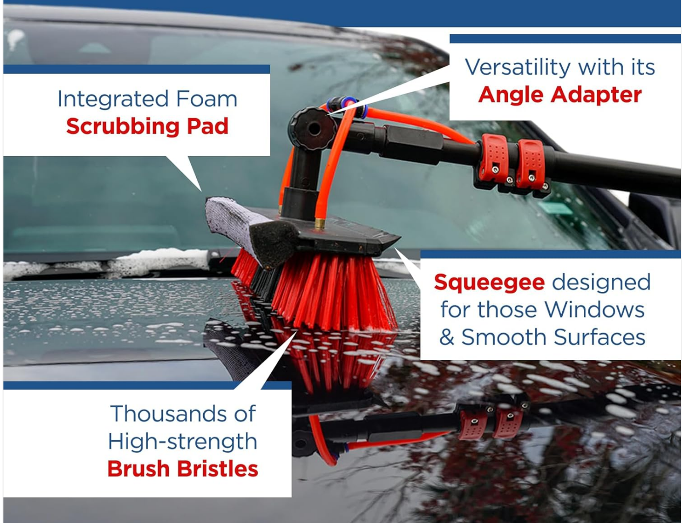
Figure 3: Detailed view of the HydroCleaner XL's versatile features, including the integrated foam scrubbing pad, angle adapter, squeegee, and high-strength brush bristles.