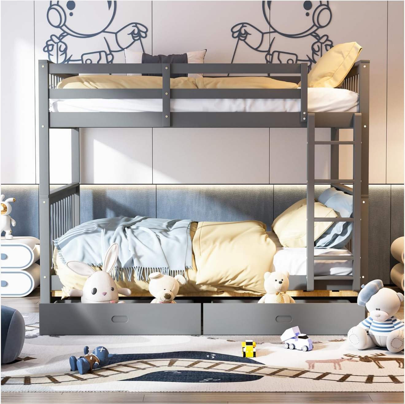
Figure 2.1: Fully assembled Merax Full Over Full Wood Bunk Bed in Grey, showcasing its design and integrated ladder.