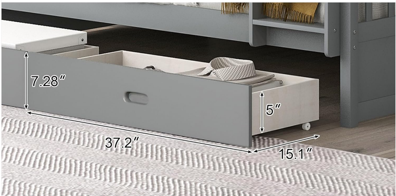
Figure 5.1: View of the two large capacity storage drawers integrated into the base of the bunk bed, designed for easy access and organization.