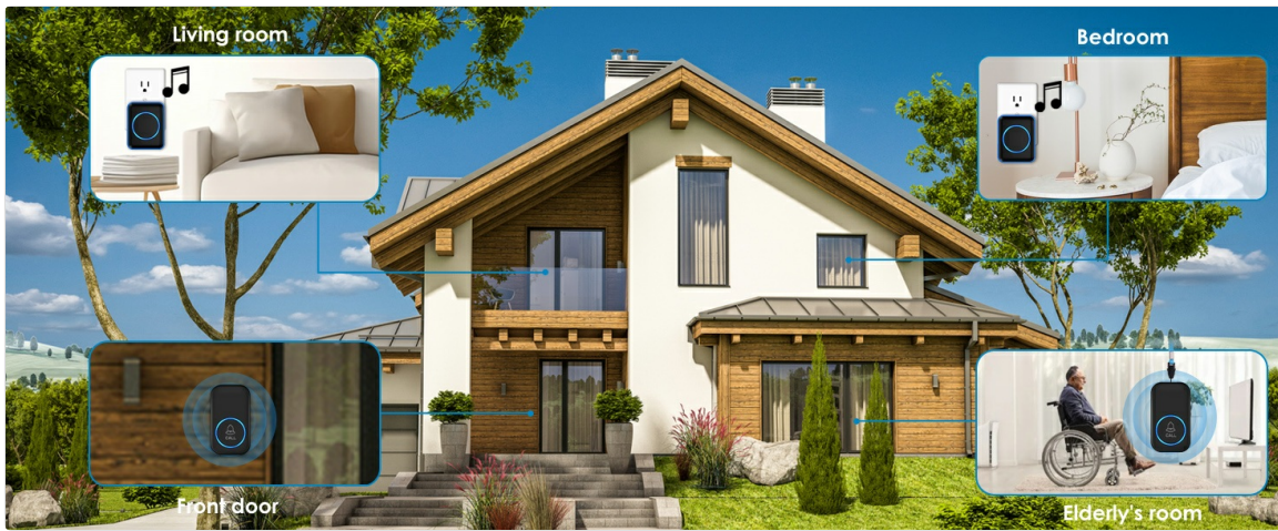
Figure 1: Illustration of the wireless range, demonstrating signal coverage across various distances and through walls.