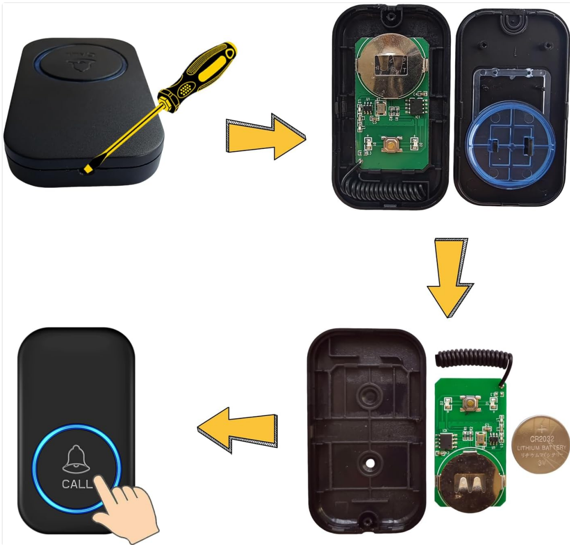
Figure 6: Steps for replacing the CR2032 battery in the call button.