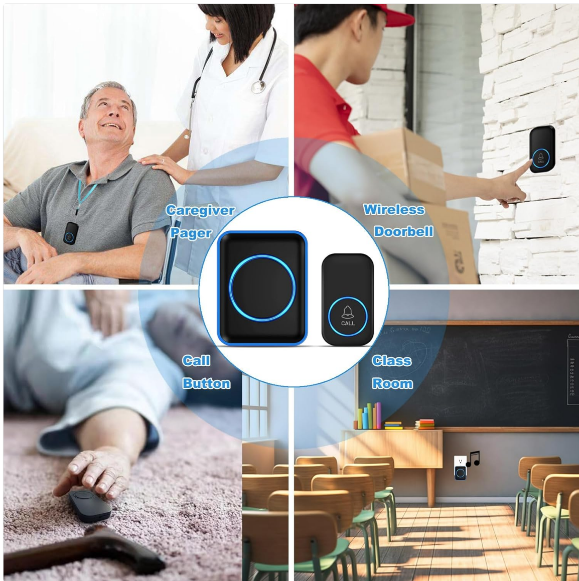
Figure 4: Various applications and placement options for the call button.