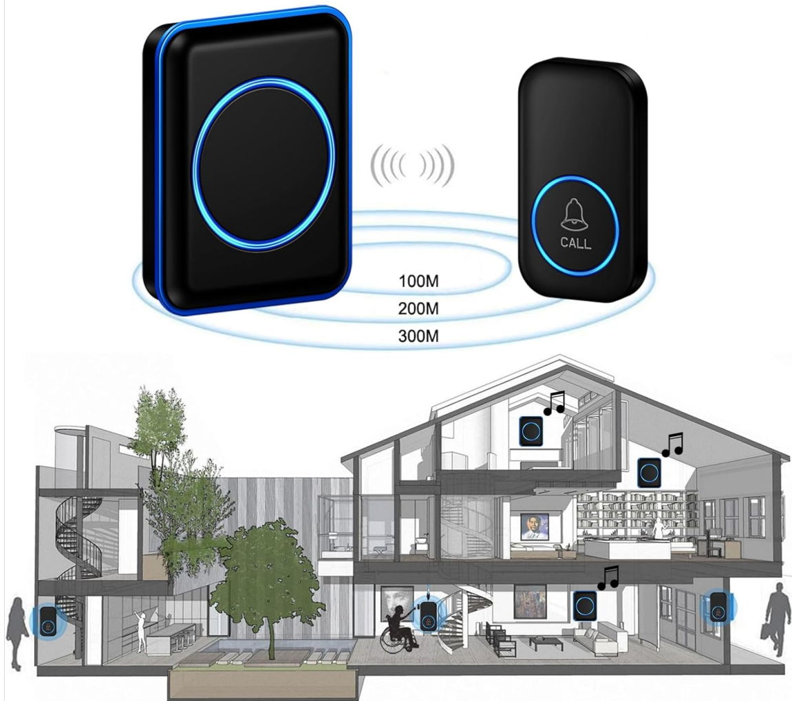
Figure 2: The plug-in receiver and call button.

Different buttons can set different ringtones to distinguish the location of visitors.