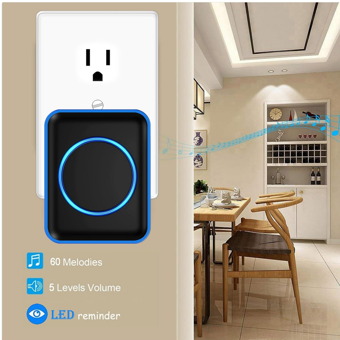
Figure 3: Receiver plugged into an electrical outlet.