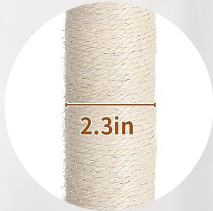
2.3in Sisal Rope

Image: A detailed view of the natural sisal rope used on the scratching posts, emphasizing its texture and durability for cat claw maintenance.