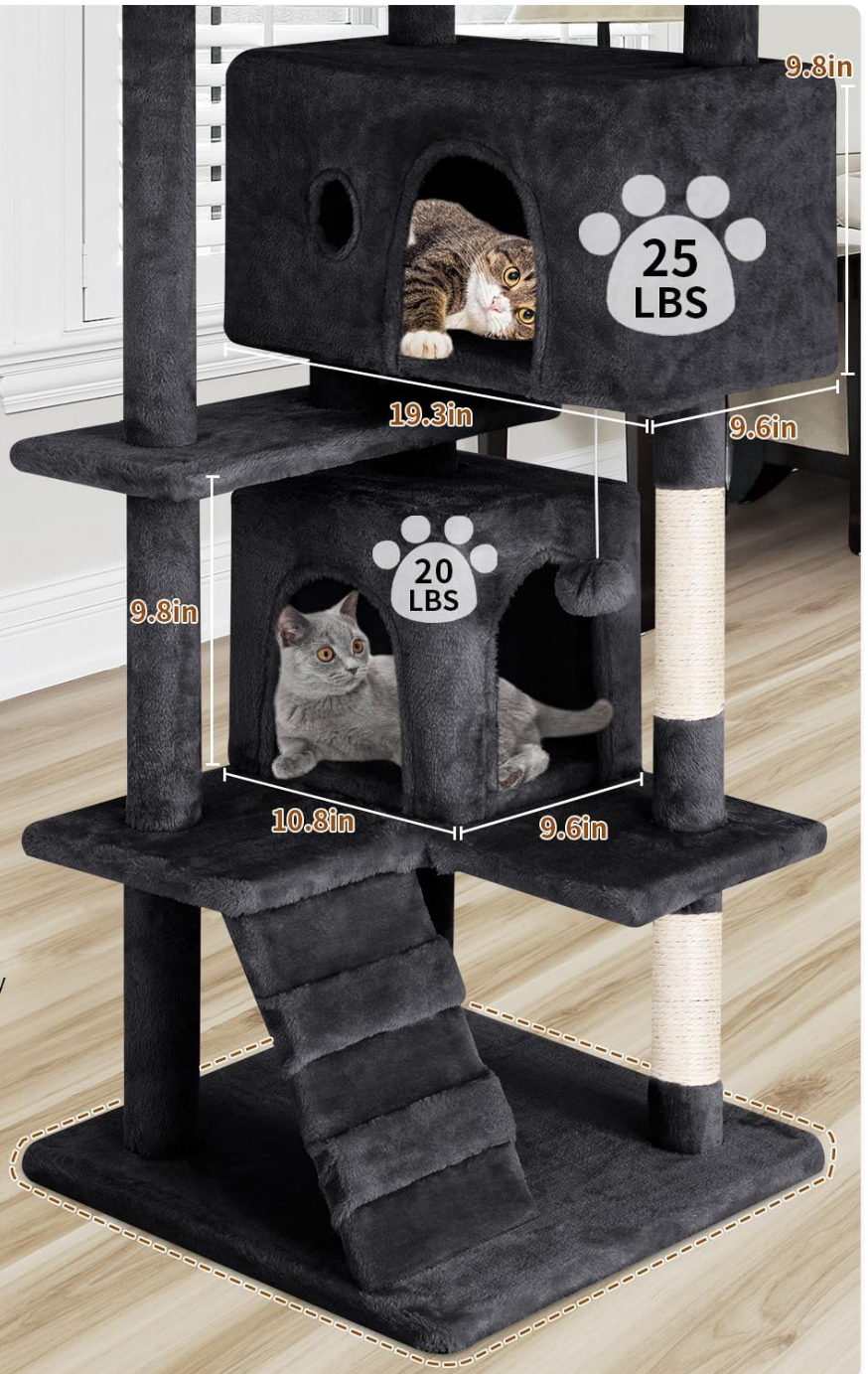
Image: A close-up demonstrating the spacious cat condos with their internal dimensions and recommended weight limits, alongside a visual of the thickened, stable base construction.