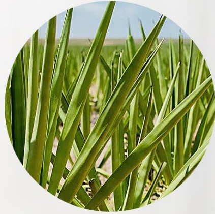
Natural Sisal Rope