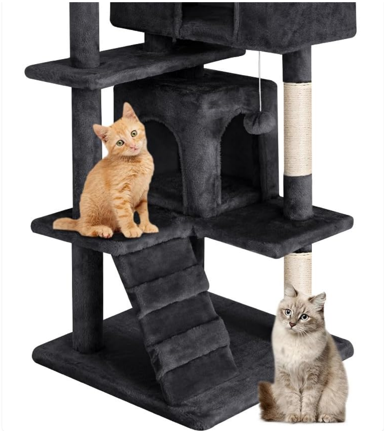
Image: The PayLessHere 54-inch Dark Grey Cat Tree, showcasing its multi-level design, integrated condos, scratching posts, and hanging toys, with several cats enjoying the structure.