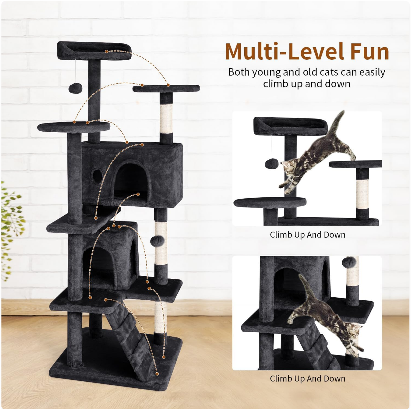
Image: A visual representation of the cat tree's multi-level design, demonstrating how cats can easily climb and navigate between different platforms and enclosed spaces.