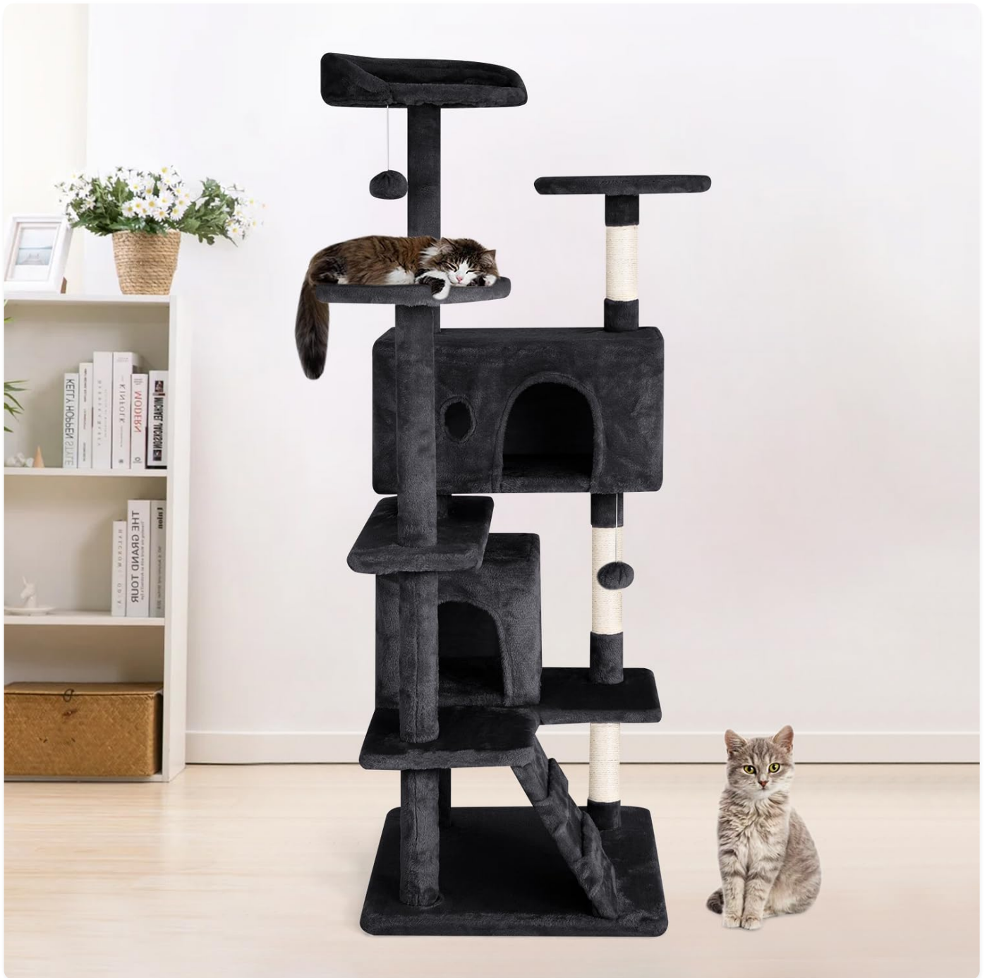
Image: A cat resting peacefully on the elevated top perch, highlighting the comfortable and secure napping spot provided by the cat tree.