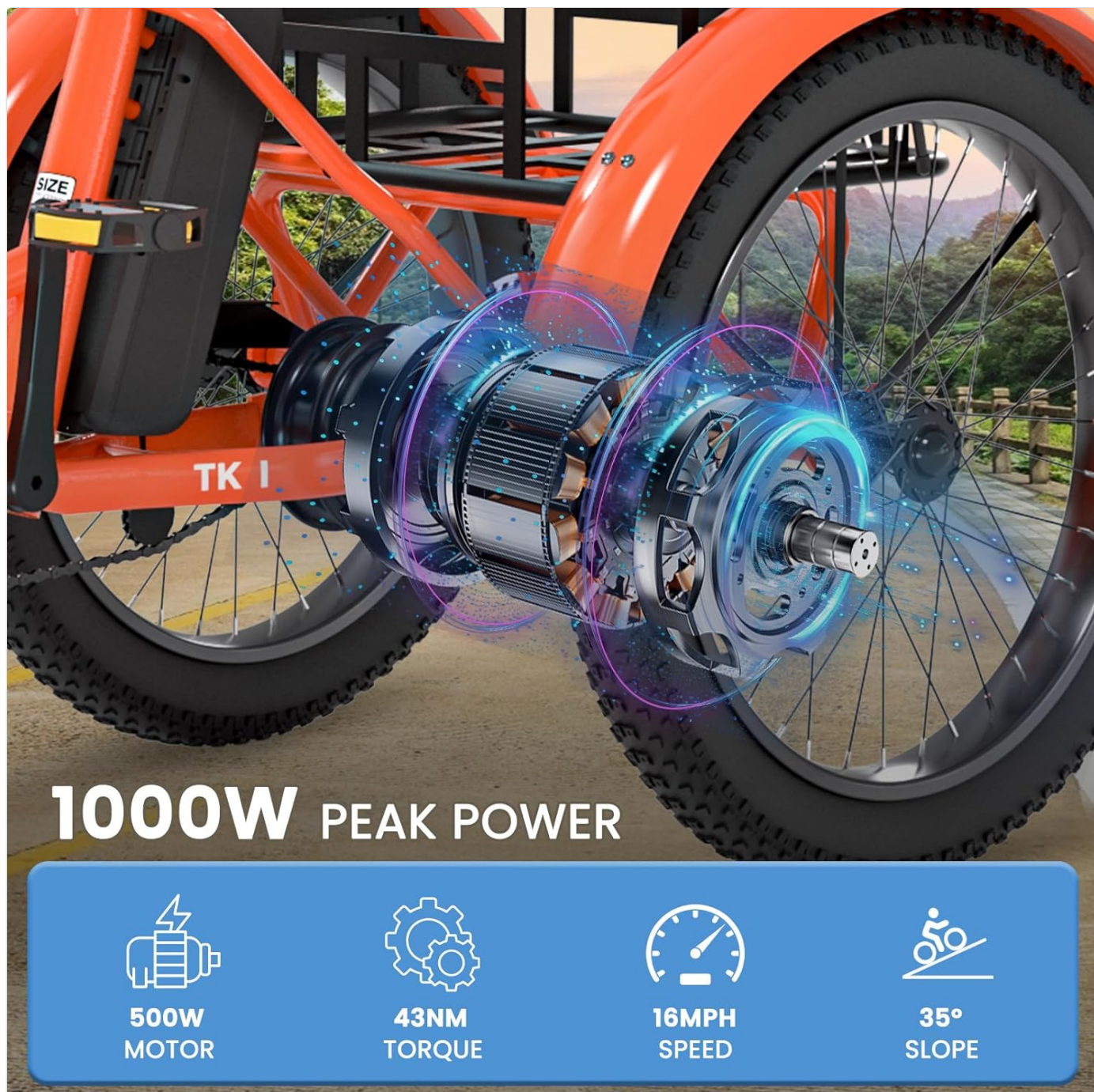
Figure 5.2: Detailed view of the 500W motor, capable of 1000W peak power, providing 43Nm of torque and supporting speeds up to 16 MPH and inclines up to 35 degrees.