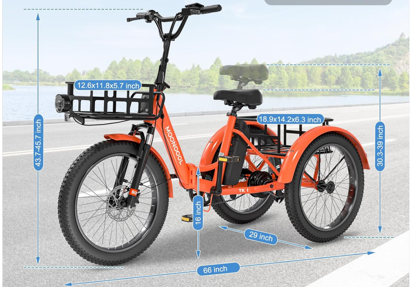
Figure 4.1: The MOONCOOL E-Trike TK1 showing its dimensions and folded state, highlighting its compact design.