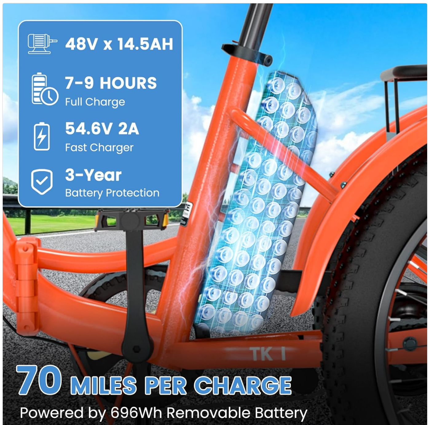
Figure 3.1: The removable 48V 14.5Ah battery, indicating a full charge time of 7-9 hours and a 3-year battery protection plan.

The battery is typically shipped partially charged. For optimal performance and battery longevity, fully charge the battery before its first use.