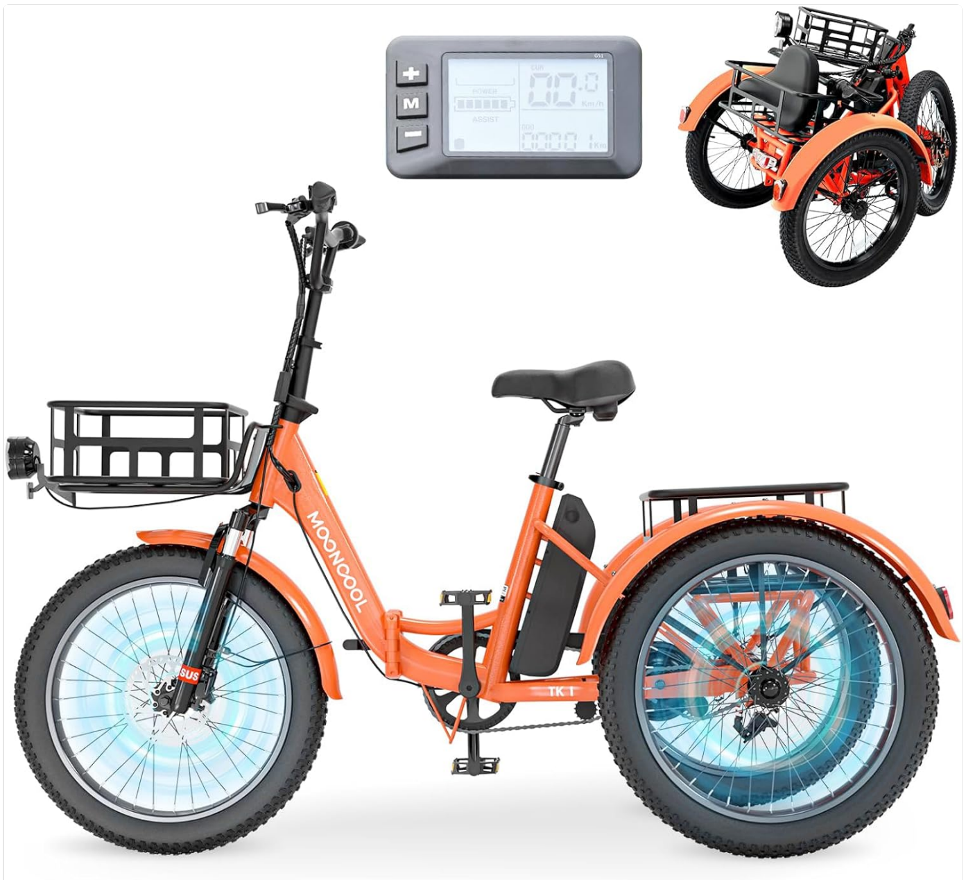
Figure 2.1: Overall view of the MOONCOOL E-Trike TK1, showing its main structure, LCD display, and a folded configuration.

Below is an illustration of the MOONCOOL E-Trike TK1 with its main components labeled.