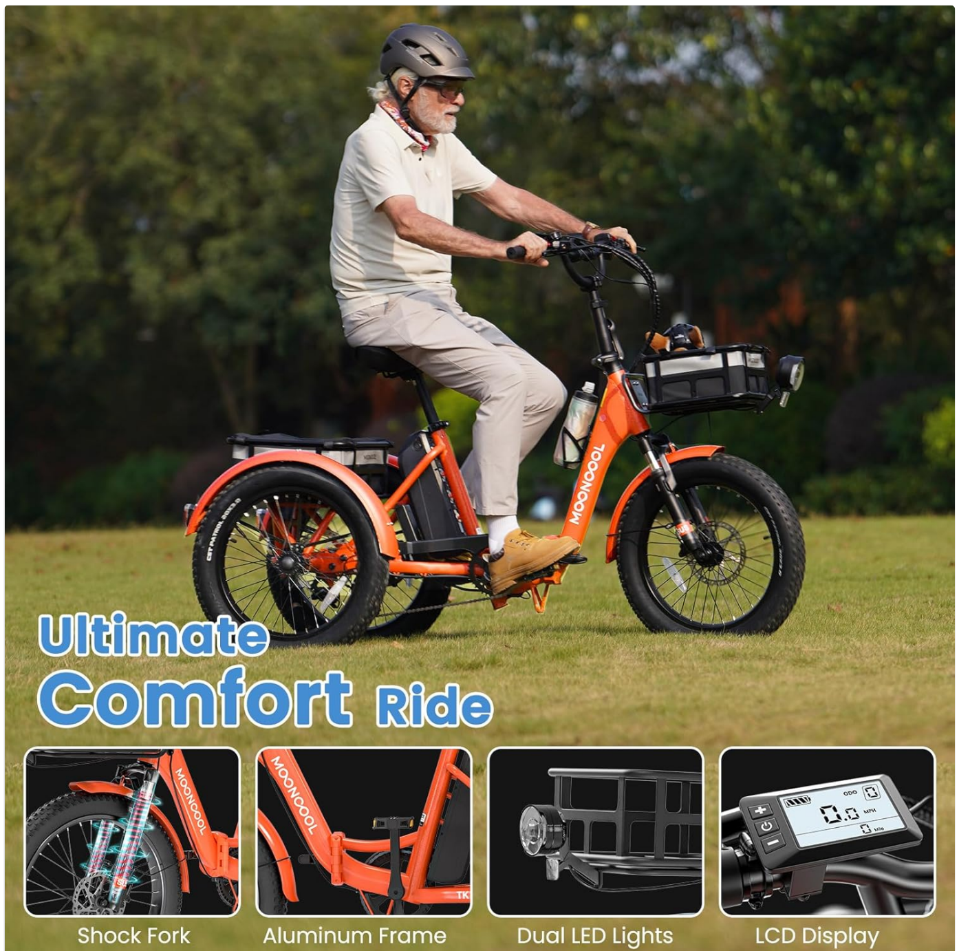
Figure 2.2: Detailed view highlighting the front shock fork, aluminum frame, dual LED lights, and the LCD display unit.