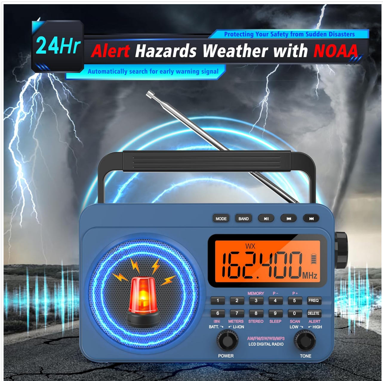
Image: The radio displaying "WX 162.400 MHz" with a warning siren icon, indicating the NOAA Weather Alert feature is active. Background shows stormy weather.