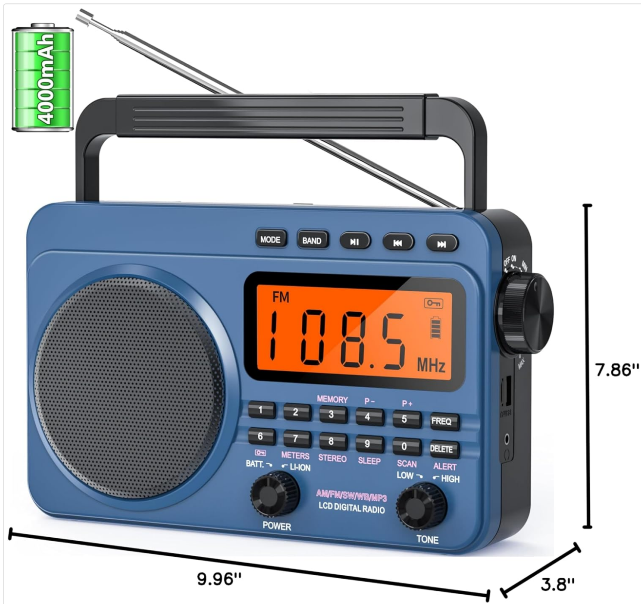
Image: Diagram showing the dimensions of the radio: 9.96 inches length, 3.8 inches width, and 7.86 inches height.