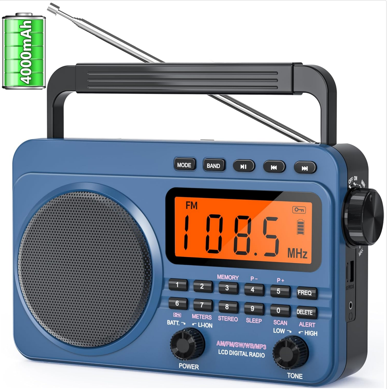
Image: Front view of the Sunoony Portable AM/FM/SW/WB Radio in blue, showing the large digital display, speaker, and control buttons. A 4000mAh battery icon is visible in the top left corner.