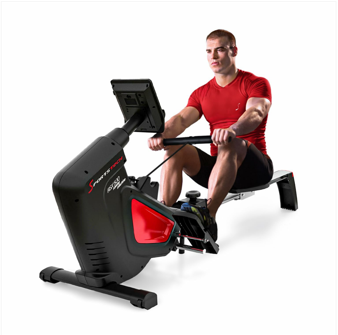
Figure 2.1: Main view of the Sportstech RSX500 Rower.