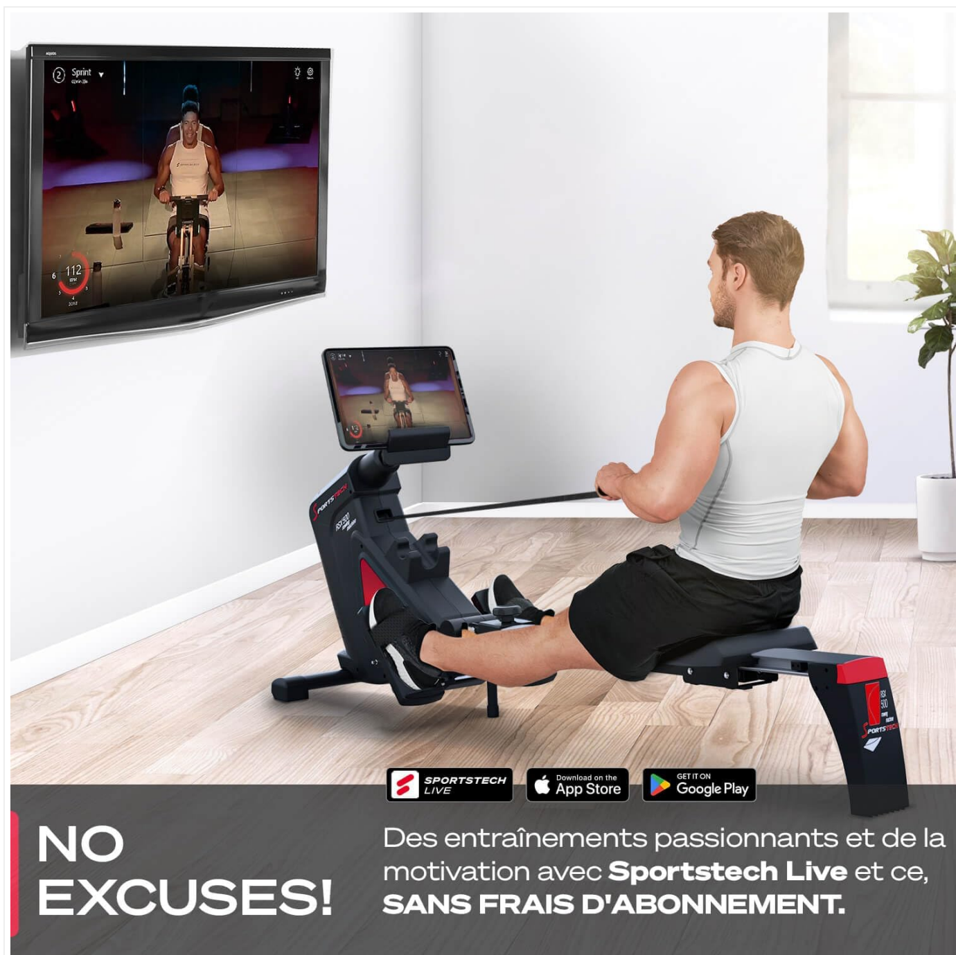
Figure 4.2: Tablet placed on the console for app connectivity.