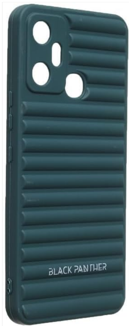
Figure 2.2: Angled view of the Generic Silicone Back Cover. This image highlights the ribbed texture on the back and the precise cutouts for side buttons and ports.