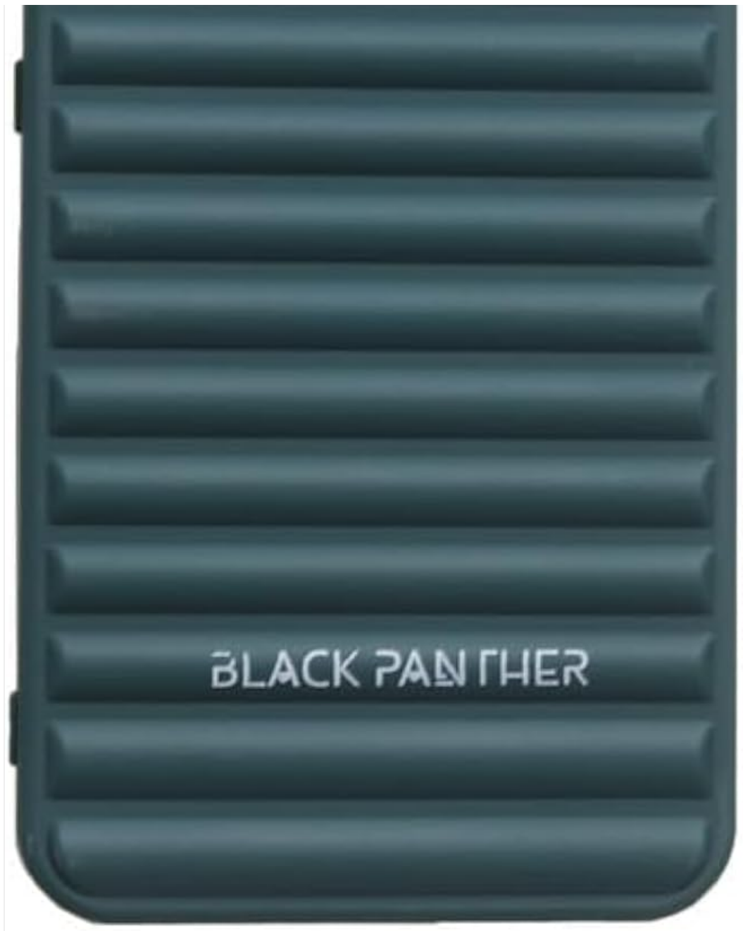
Figure 2.1: Front view of the Generic Silicone Back Cover. This image displays the overall design and camera cutouts of the case.