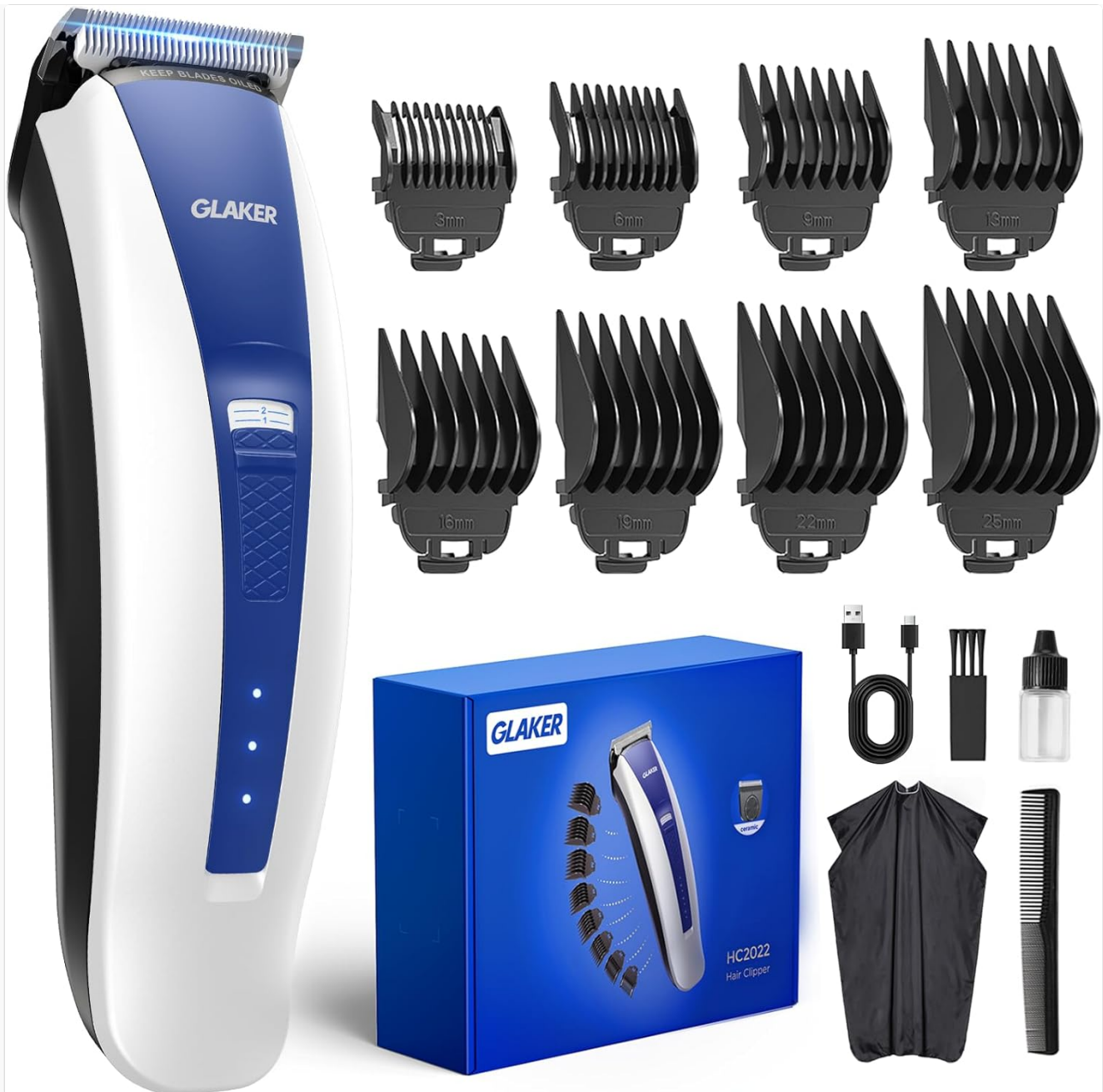
Figure 2.1: GLAKER HC2022 Cordless Hair Clipper and Trimmer with all included accessories, including the clipper, various guide combs, charging cable, cleaning brush, blade oil, and a barber cape.