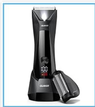
Figure 3.1: The GLAKER HC2022 clipper connected to a USB-C charging cable, illustrating the Type-C charging port.

power adapter (not included). The battery indicator lights will show charging progress. A full charge takes approximately 180 minutes and provides up to 300 minutes of run time.