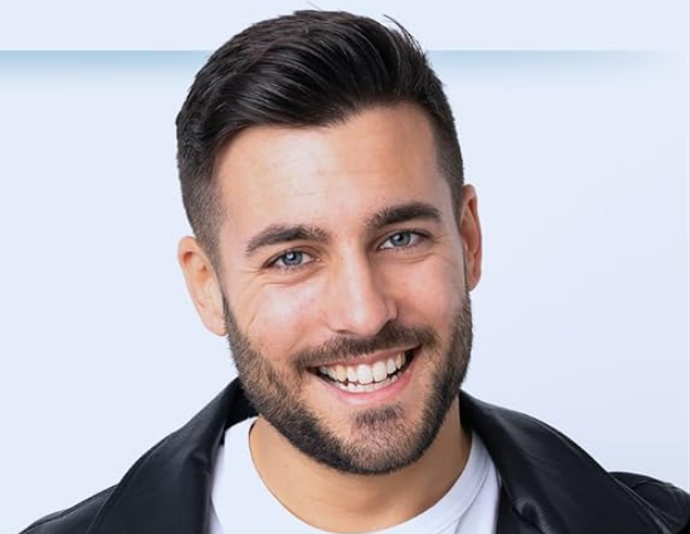
Figure 4.2: Visual guide demonstrating various hair lengths and styles achievable using the GLAKER HC2022 clipper and its multiple guide combs.