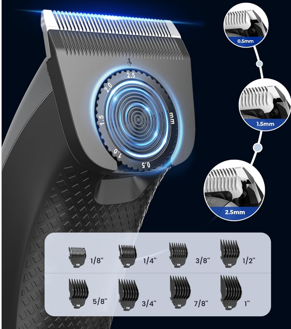
Figure 3.3: The precision dial on the GLAKER HC2022 clipper, allowing for fine adjustments of blade length between 0.5mm and 2.5mm, ideal for fading and blending.