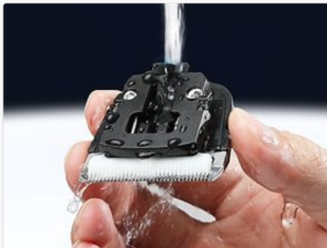
Figure 5.1: The detachable blade of the GLAKER HC2022 clipper being rinsed under water for cleaning.