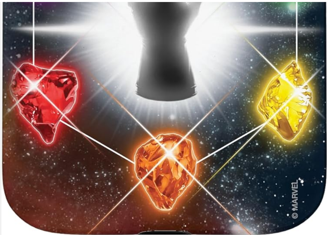
Figure 3.3: Fully assembled case on iPhone 15 Pro. The design features the Infinity Gauntlet surrounded by the six Infinity Stones.