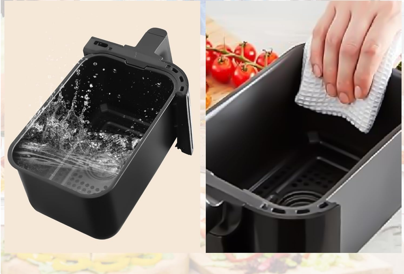
Image: Steps for cleaning the non-stick cooking basket, showing rinsing with water and towel drying.

Non-stick coating, Clean with water, then towel dry.