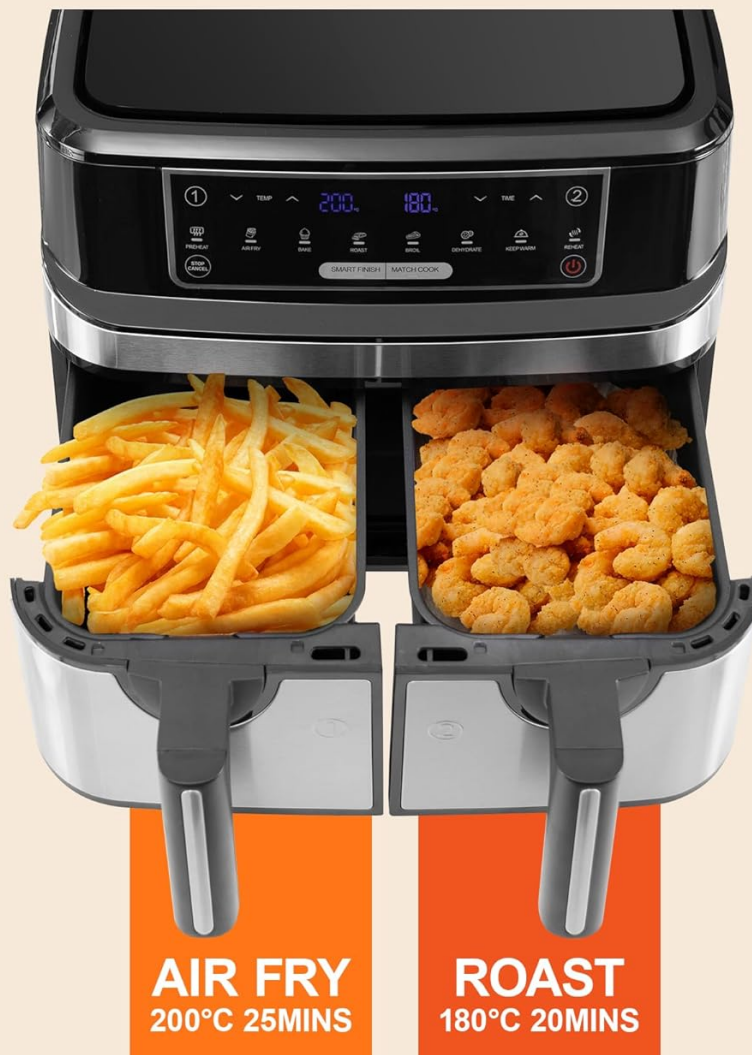
Image: The air fryer's zoned cooking capability, showing independent temperature and time settings for each basket to prevent flavor transfer.

Set the temperature and time for each food individually to avoid odor transfer between foods.