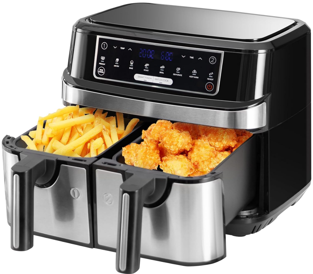
Image: The Emphism 9 Liter Dual Chamber Hot Air Fryer, showcasing its dual basket design with food ready for cooking.