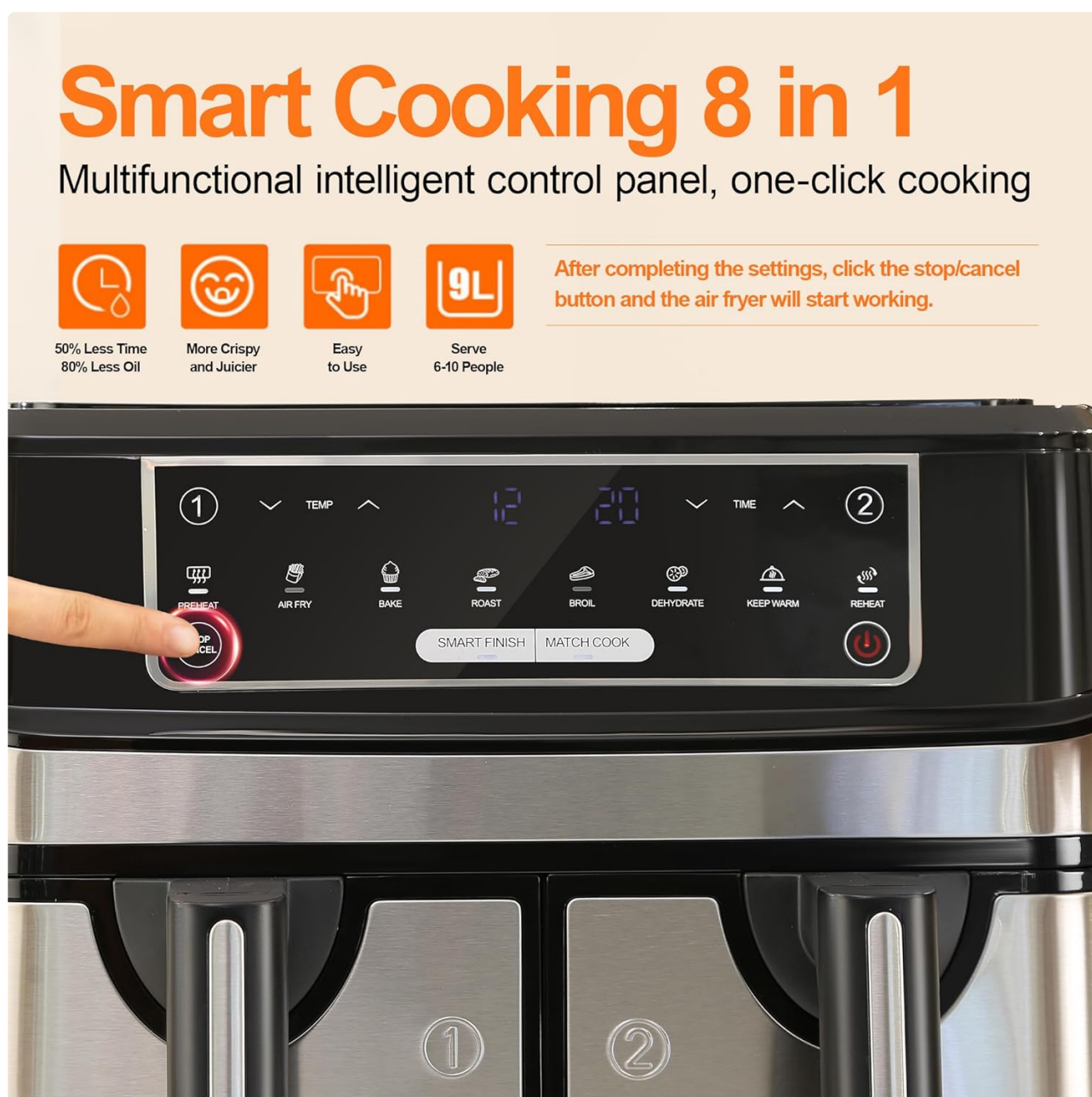
Image: The LED touchscreen control panel, showing preset functions and temperature/time controls.

The air fryer features an intuitive LED touchscreen for easy operation.