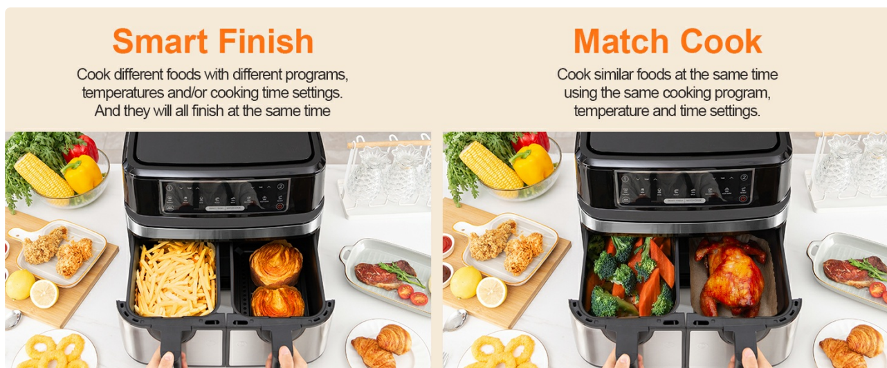
Image: Visual representation of Smart Finish and Match Cook functions, demonstrating simultaneous completion and synchronized cooking.