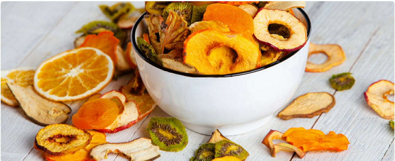
Image: A bowl filled with various dried fruits, demonstrating the dehydration capability of the air fryer.

The air fryer can be used to dehydrate fruits, preserving their original taste and nutrients.