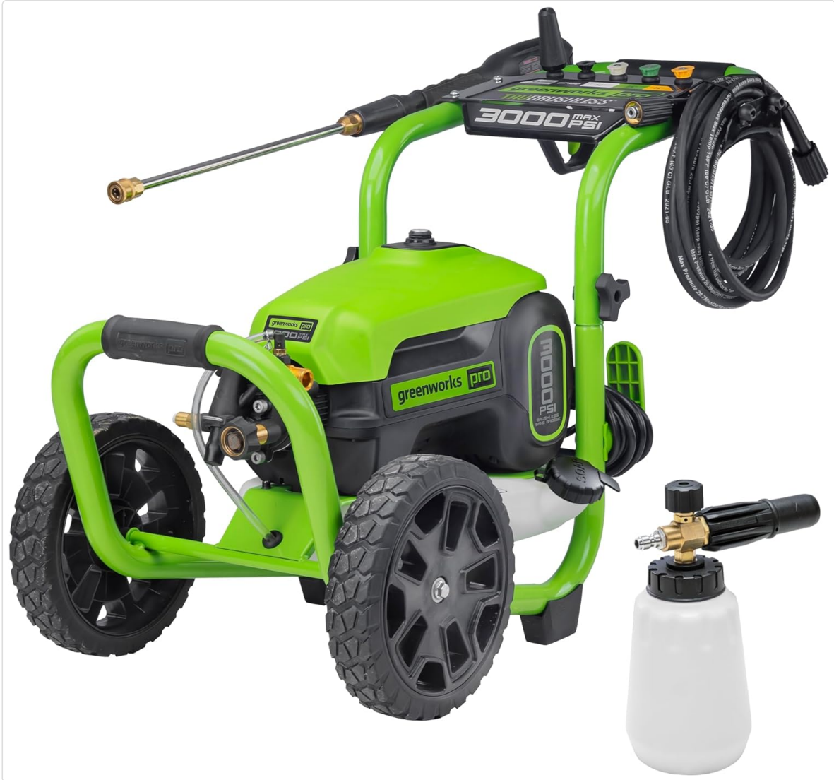
Figure 2: The Greenworks 3000 PSI Pressure Washer fully assembled with its main components, including the pressure washer unit, spray gun, wand, hose, and foam cannon.