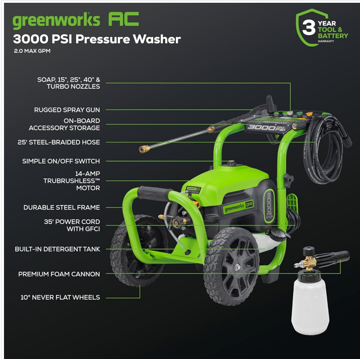
Figure 1: Greenworks 3000 PSI Pressure Washer with key components labeled, including the rugged spray gun, on-board accessory storage, 25' steel-braided hose, simple on/off switch, 14-Amp TruBrushless motor, durable steel frame, 35' power cord with GFCI, built-in detergent tank, premium foam cannon, and 10" never-flat wheels.