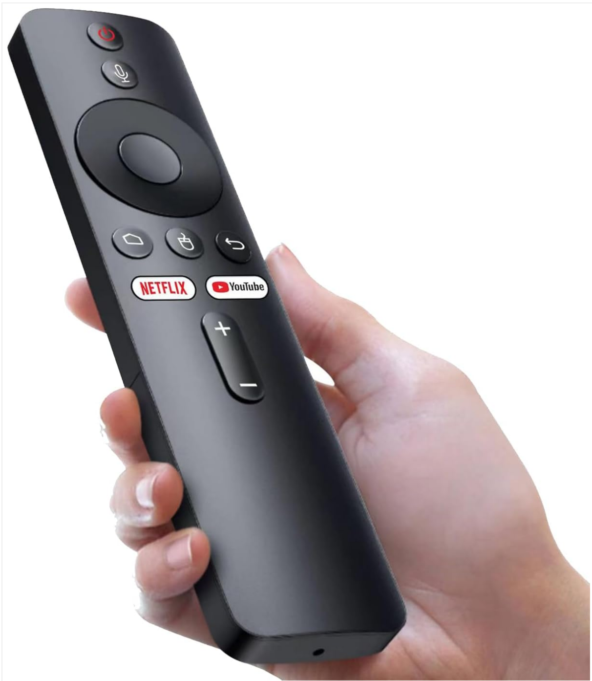
Figure 1: The BOXPOT Remoter ATV3 Mini remote control.