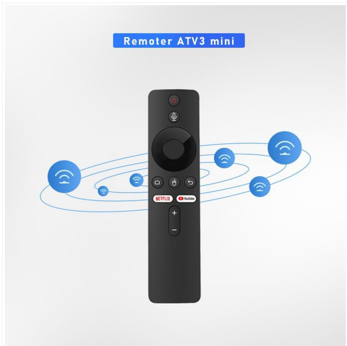
Figure 3: Illustration of the remote's Bluetooth signal range.