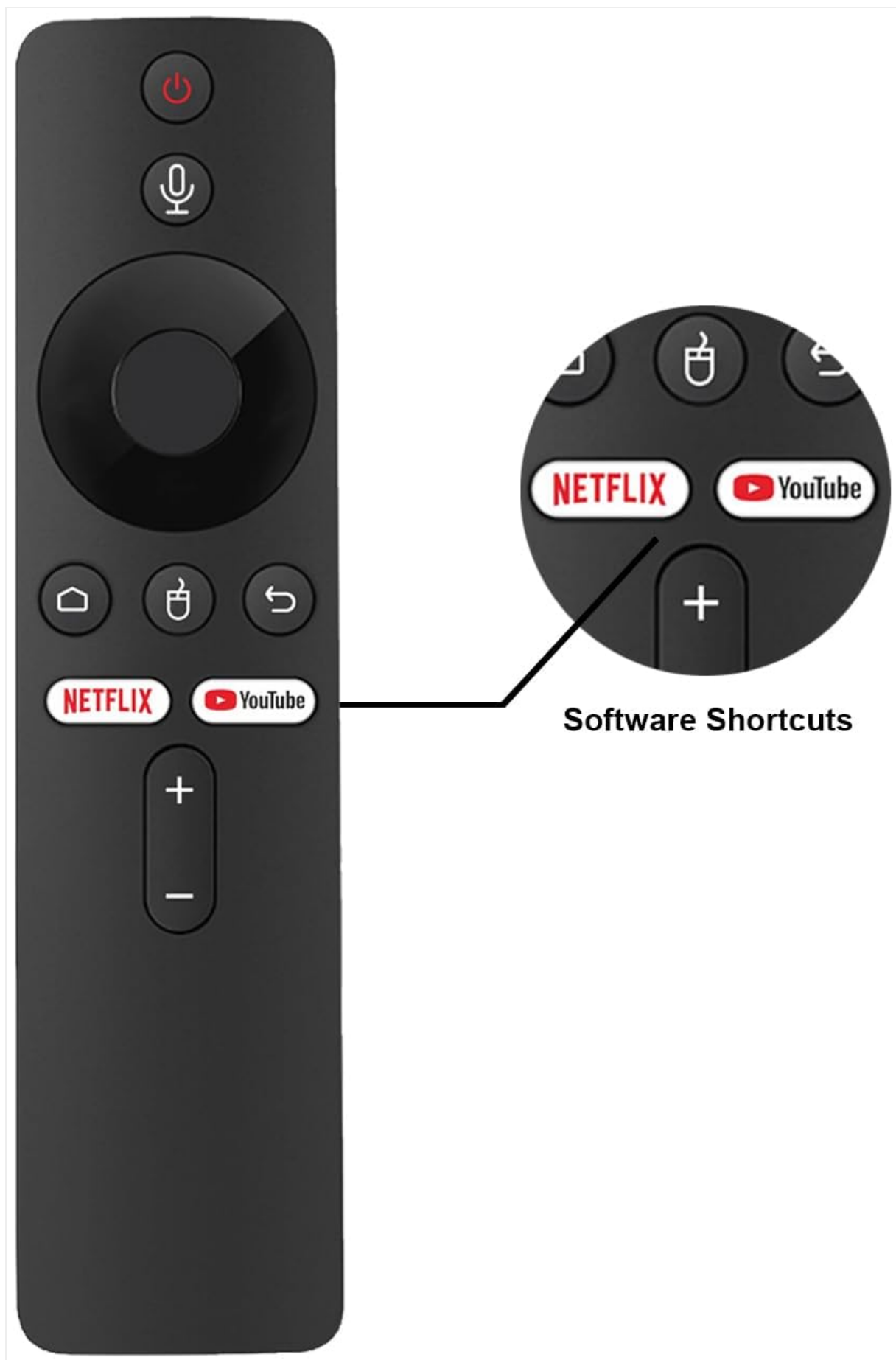
Figure 4: Software shortcut buttons for quick access to applications.