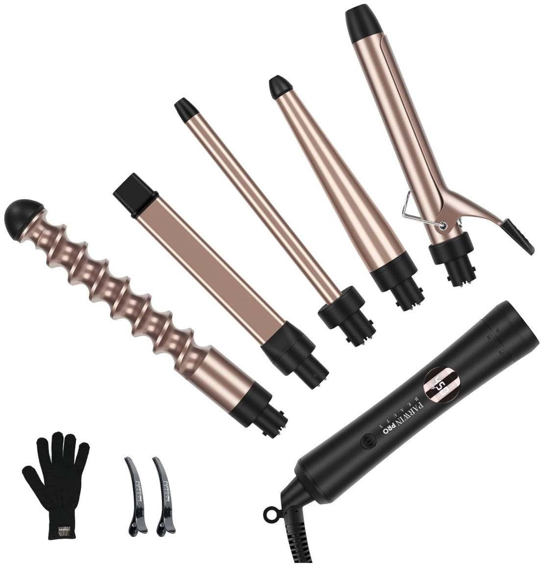
Image: The complete 5-in-1 curling iron set including the main handle, five interchangeable barrels, heat protective glove, and two hair clips.