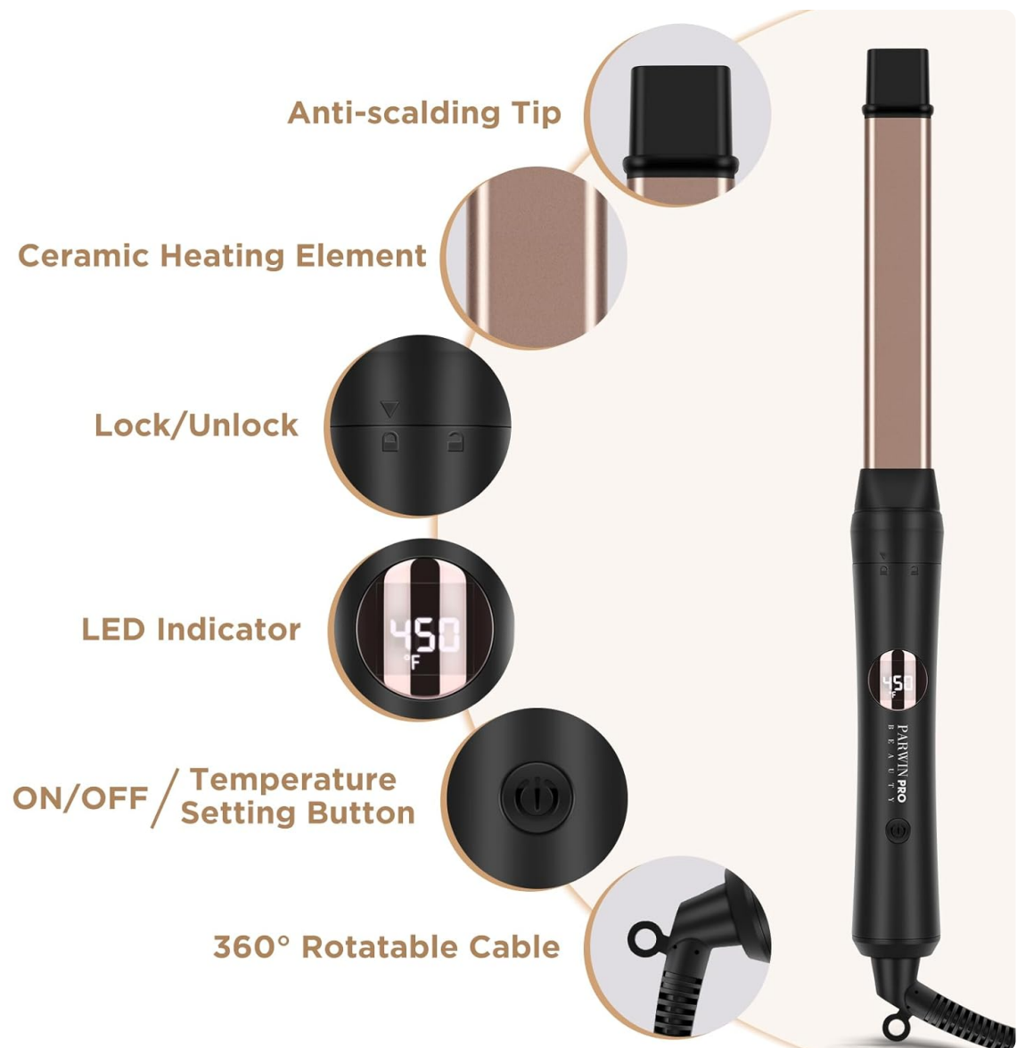
Image: Details of the curling iron handle, including the LED temperature display, ON/OFF/temperature setting button, and 360° rotatable cable.