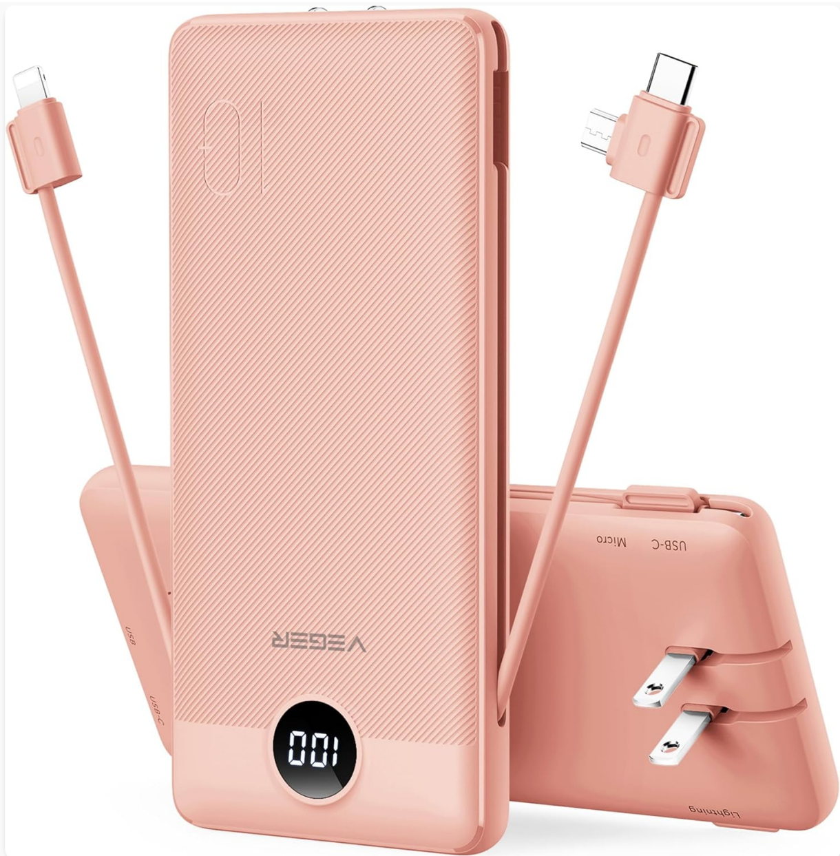
Image: The VEGER 10000mAh Portable Charger in dark pink, showcasing its sleek design and built-in cables.