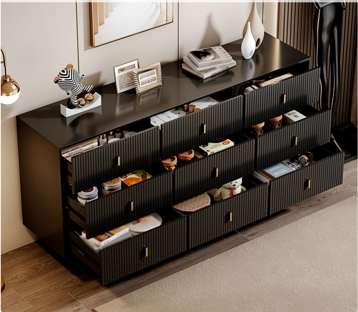
Image 5.1: The chest with multiple drawers open, illustrating the ample storage capacity and organization possibilities for various small items.

Meet your daily storage needs for small items!