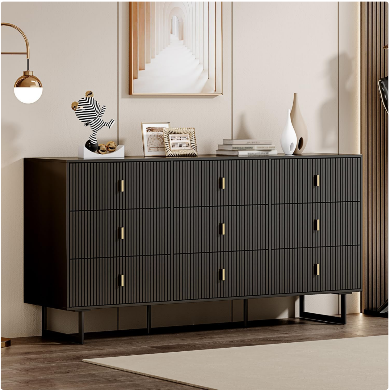
Image 1.1: The Chrangmay Modern 9-Drawer Chest in a living room setting, showcasing its matte black finish and nine drawers.