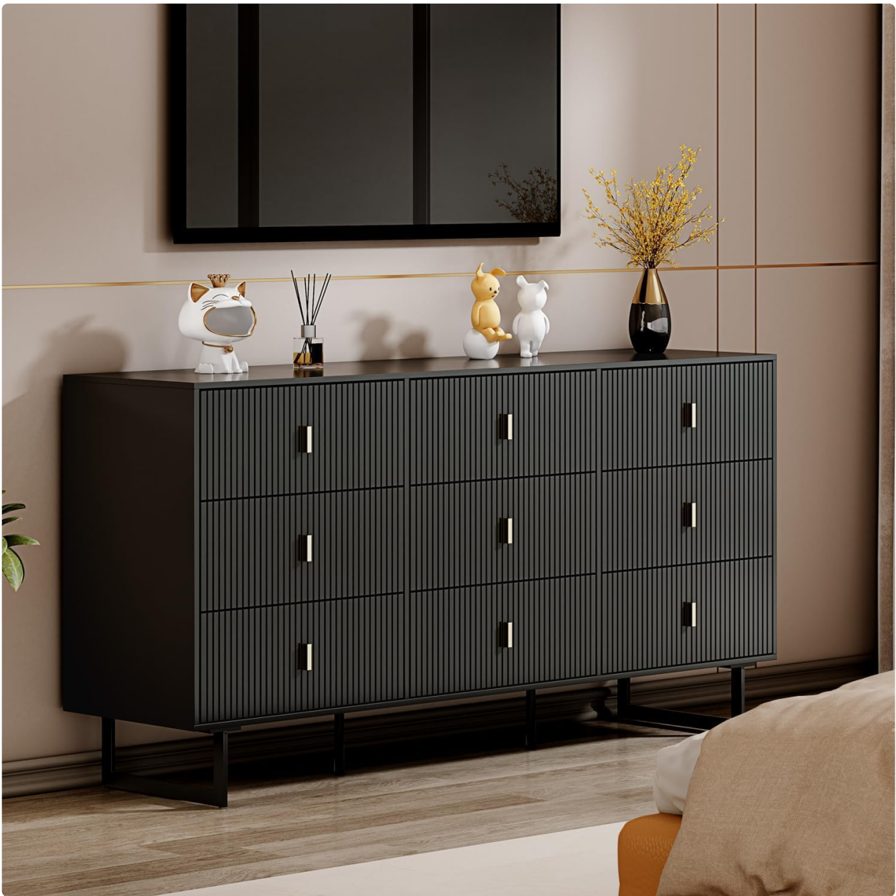
Image 1.2: The chest of drawers positioned in a bedroom, demonstrating its functional and aesthetic integration.