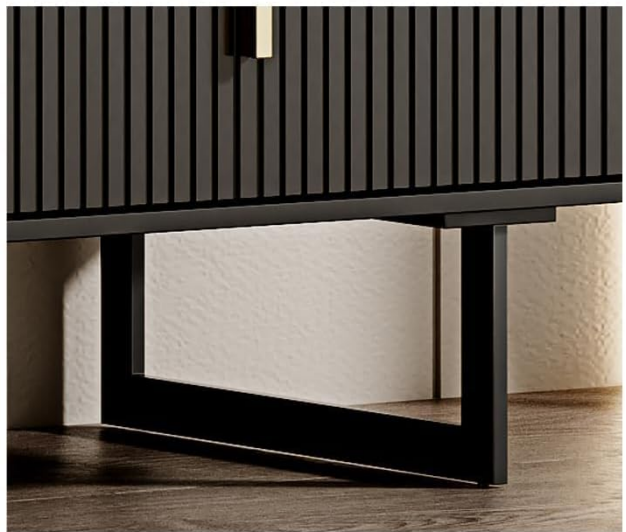
Sturdy metal legs