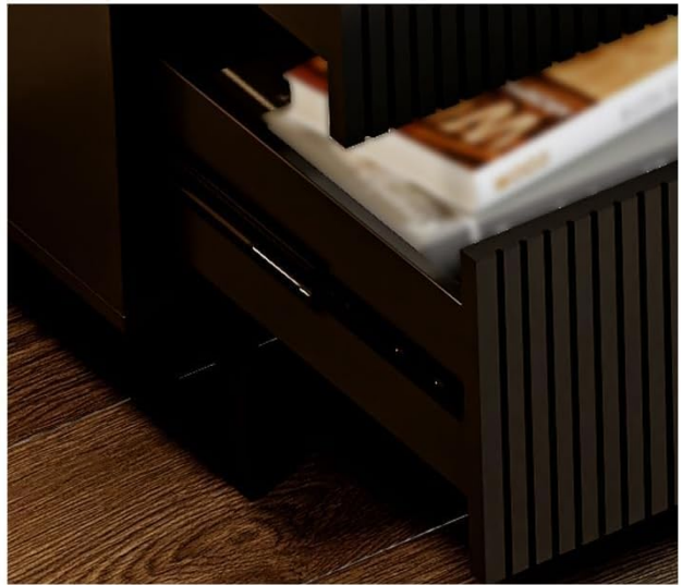
Smooth sliding rails