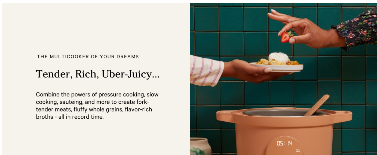
Image: The Dream Cooker's control panel, showing the digital display for time, mode indicators, and buttons for power, play/pause, and adjustments.

The Dream Cooker features a streamlined control panel designed for intuitive operation. It allows you to easily select modes, adjust settings, and monitor cooking progress.