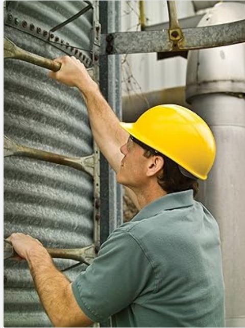
Figure 3.1: A worker demonstrating the use of a Bullard Bump Cap in a typical work environment.