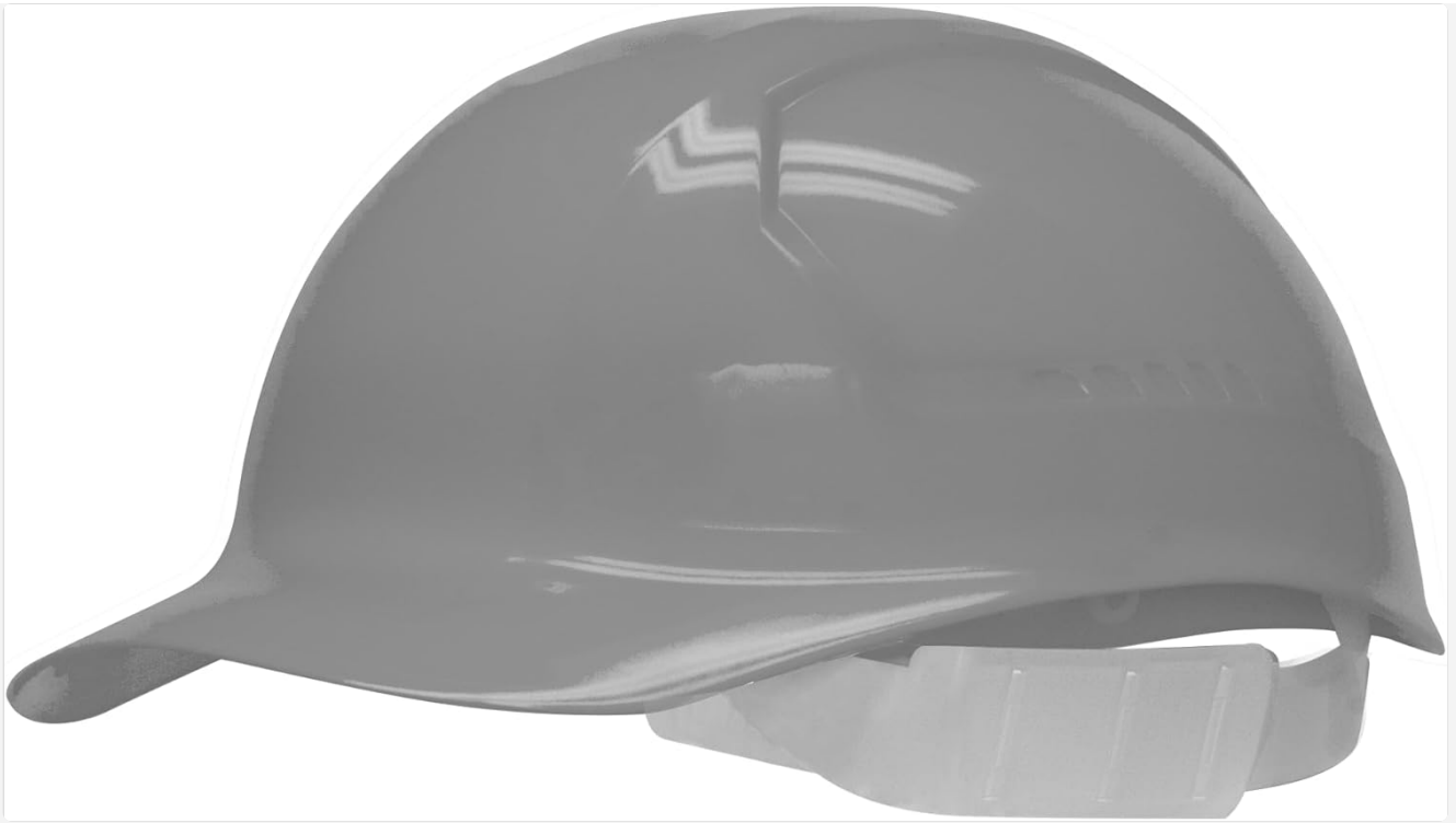
Figure 1.1: The Bullard Standard Non-Vented Bump Cap in Dove Grey, showcasing its sleek design and browpad.