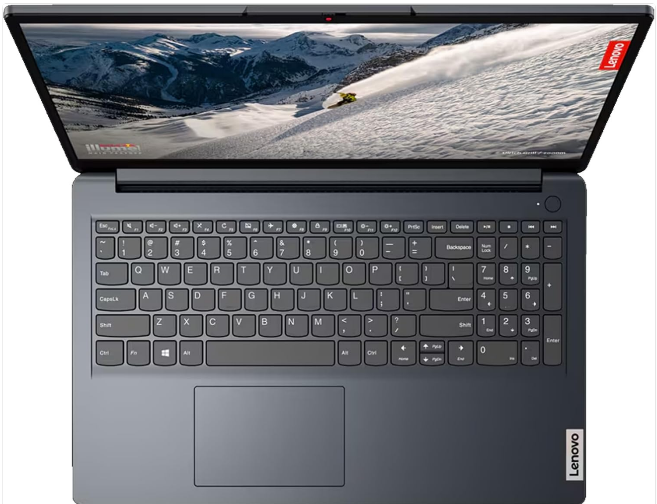
Image 3.1: A top-down perspective of the Lenovo IdeaPad 1 15AMN7, showcasing the full keyboard with numeric pad and the integrated touchpad.