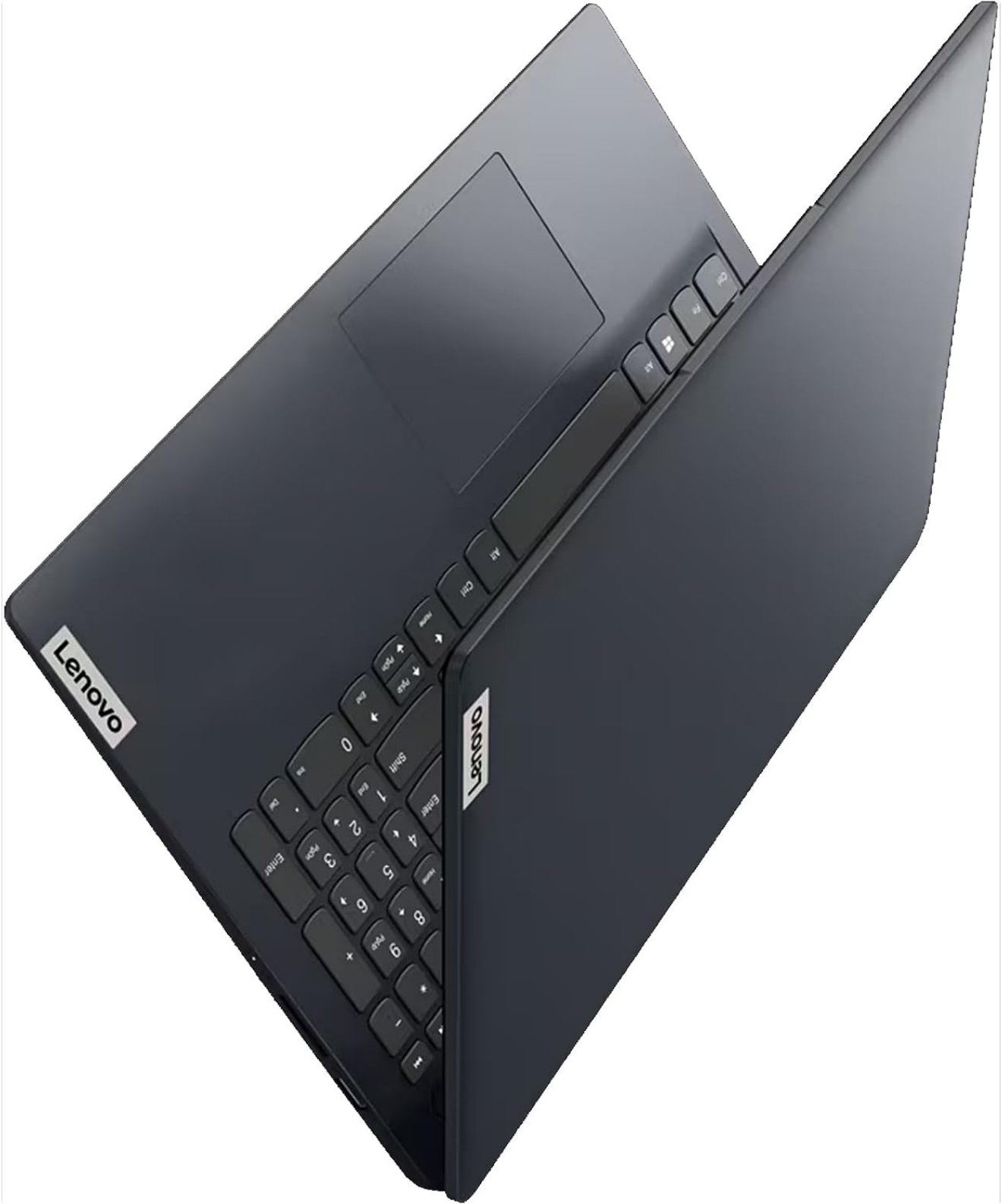
Image 6.1: A side view of the Lenovo IdeaPad 1 15AMN7 laptop, illustrating its slim design and port placement.