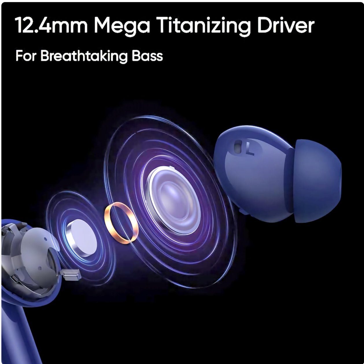
Figure 2: Internal structure of the 12.4mm Mega Titanized Dynamic Bass Driver, designed for powerful audio output.