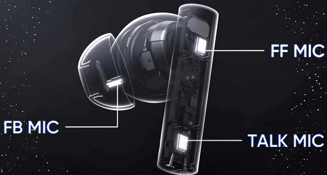
Figure 3: Illustration showing the placement of the Front Feed (FF), Feedback (FB), and Talk microphones for 6-Mic Call Noise Cancellation.